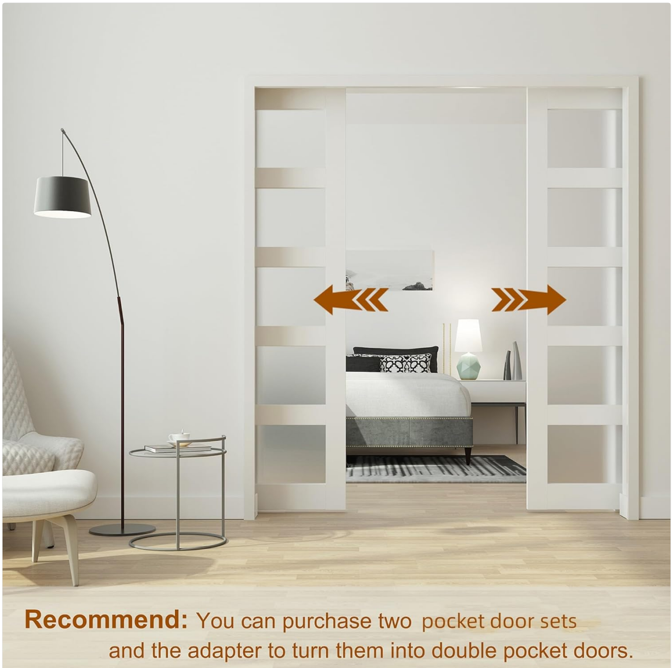
Image: Recommendation for creating a double pocket door setup.