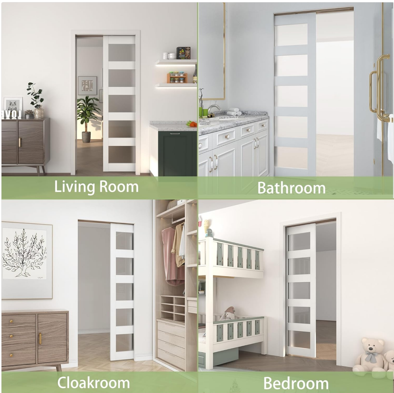
Image: Examples of the pocket door in various room applications.

Your browser does not support the video tag.