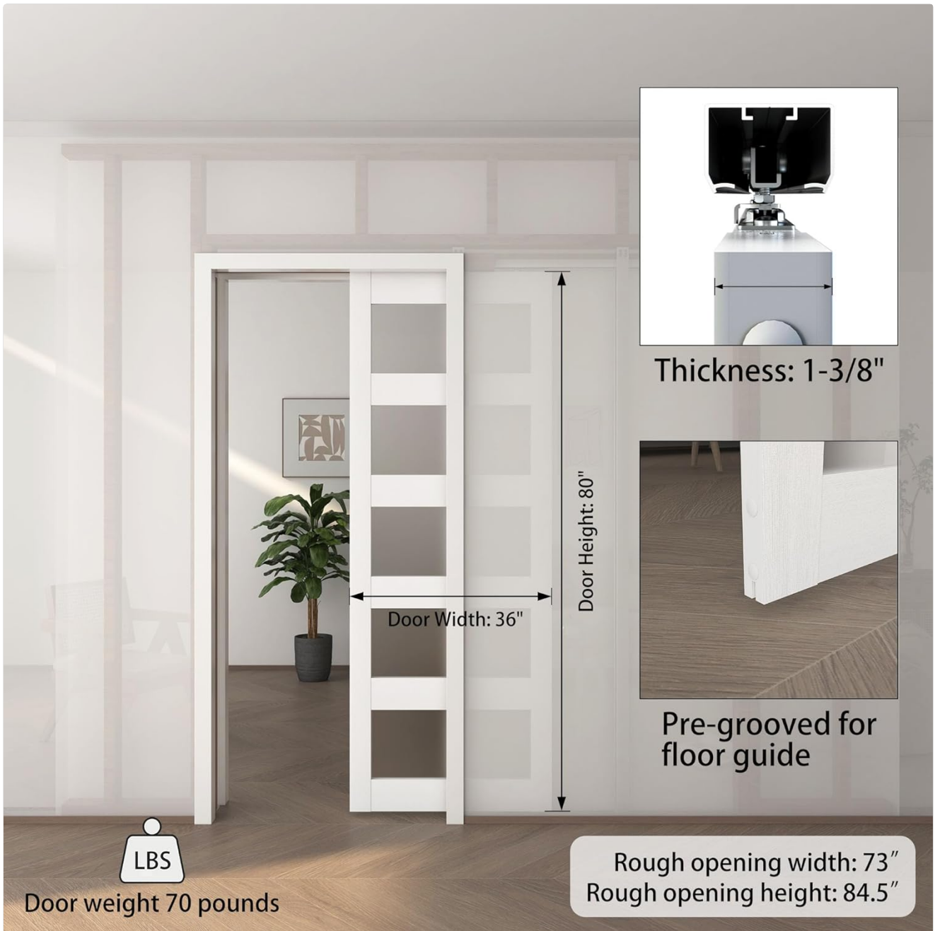
Image: Door and rough opening dimensions.