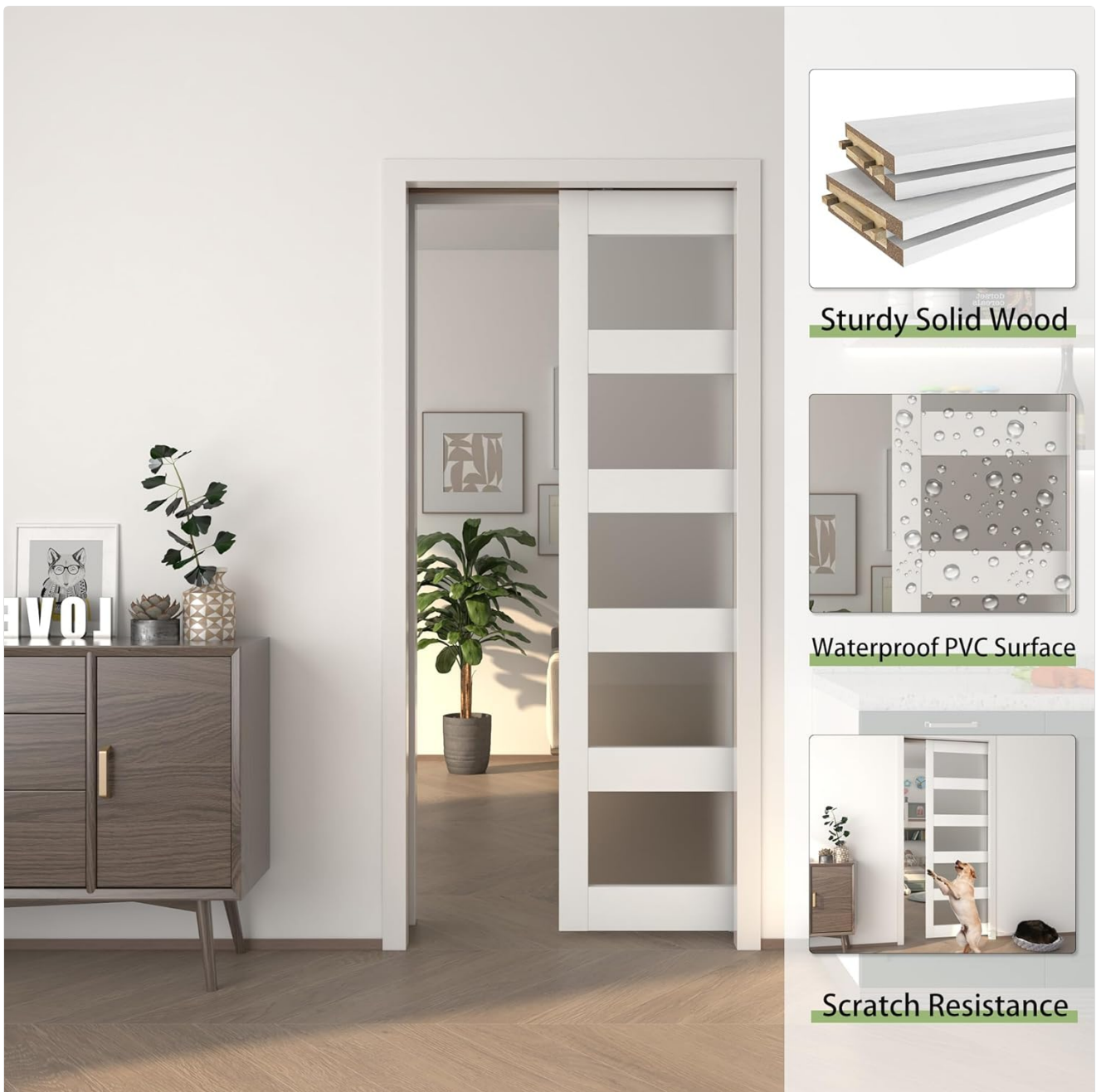
Image: Construction details showing solid wood, waterproof PVC, and scratch resistance.