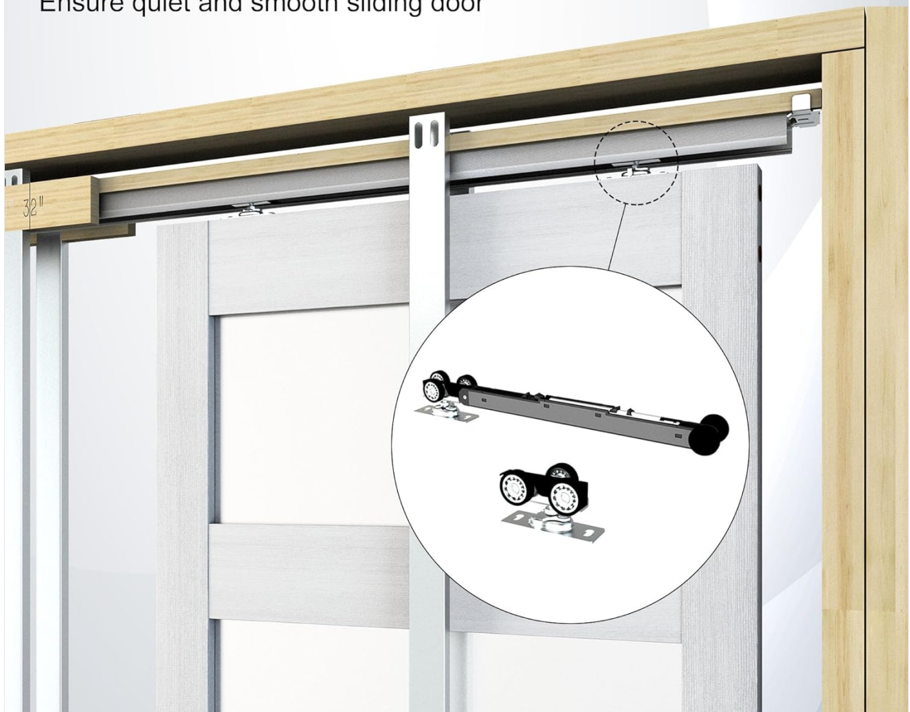
Image: Soft-close mechanism and three-wheel ball-bearing hangers for smooth sliding.

The frosted glass panels provide privacy while allowing natural light to pass through, making it suitable for various rooms such as living rooms, bathrooms, cloakrooms, and bedrooms.