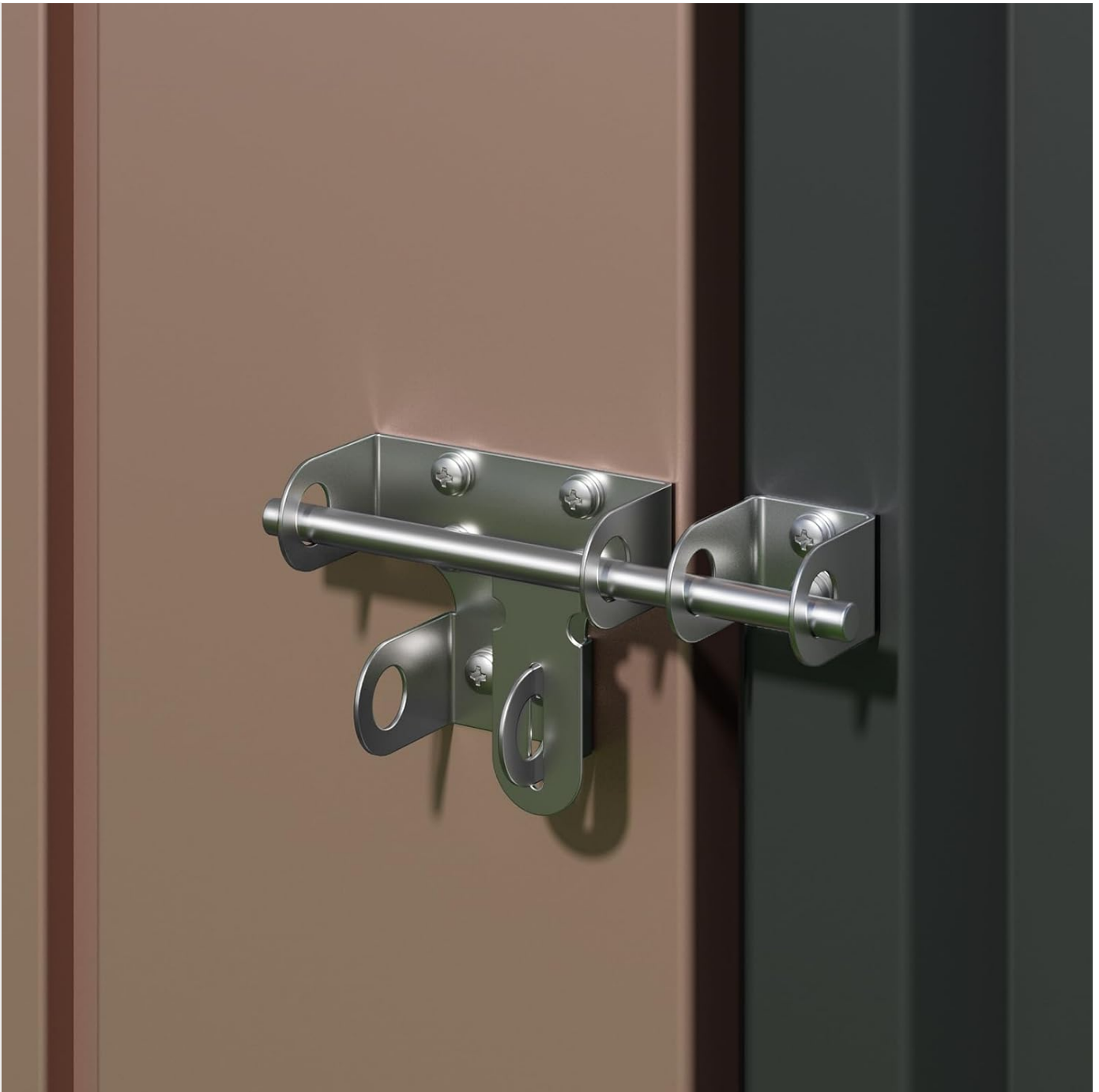
Image: Detail of the door lock for security.

Multifunctional Use: Beyond garden tool storage, this shed can serve various purposes, such as a secure storage unit for waste bins, or even a sheltered space for pets, providing protection from the elements.