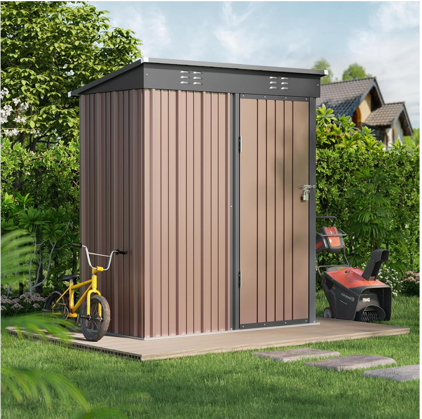
Image: Shed in a garden setting, demonstrating its outdoor use.

Security: The shed features a robust hinged door with a lock mechanism to secure your stored items and prevent unauthorized access or loss. Ensure the door is properly closed and locked when not in use.