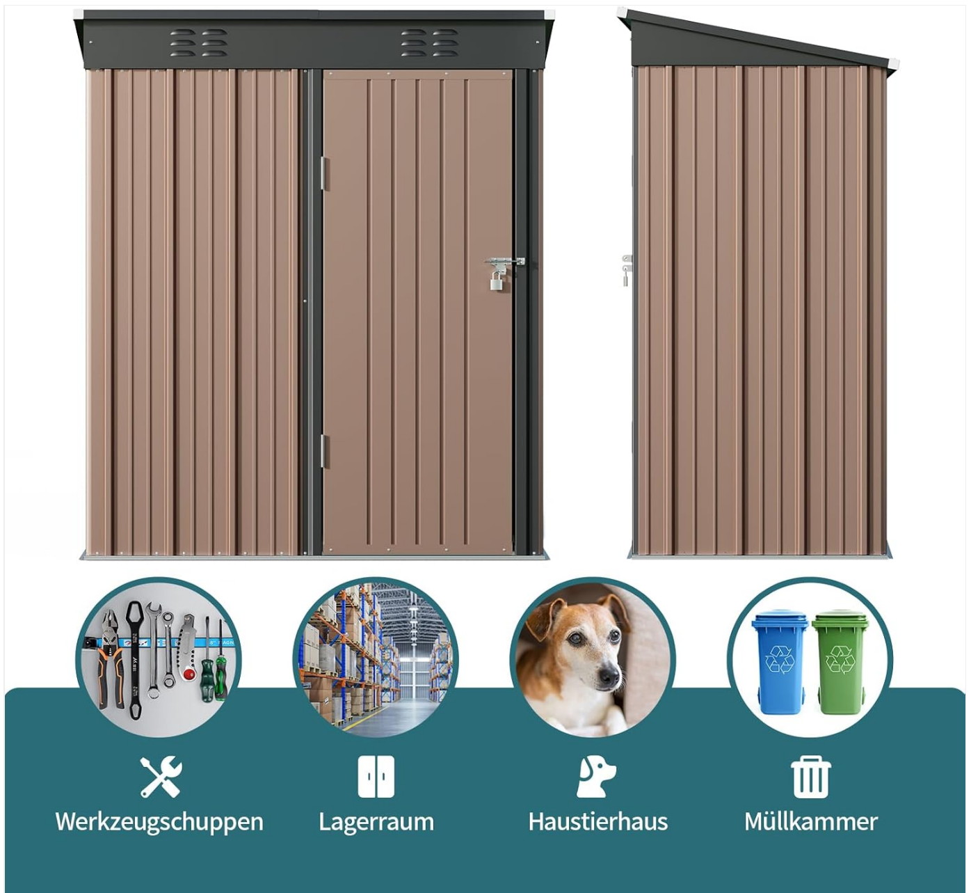
Image: Visual representation of multi-purpose functionality.