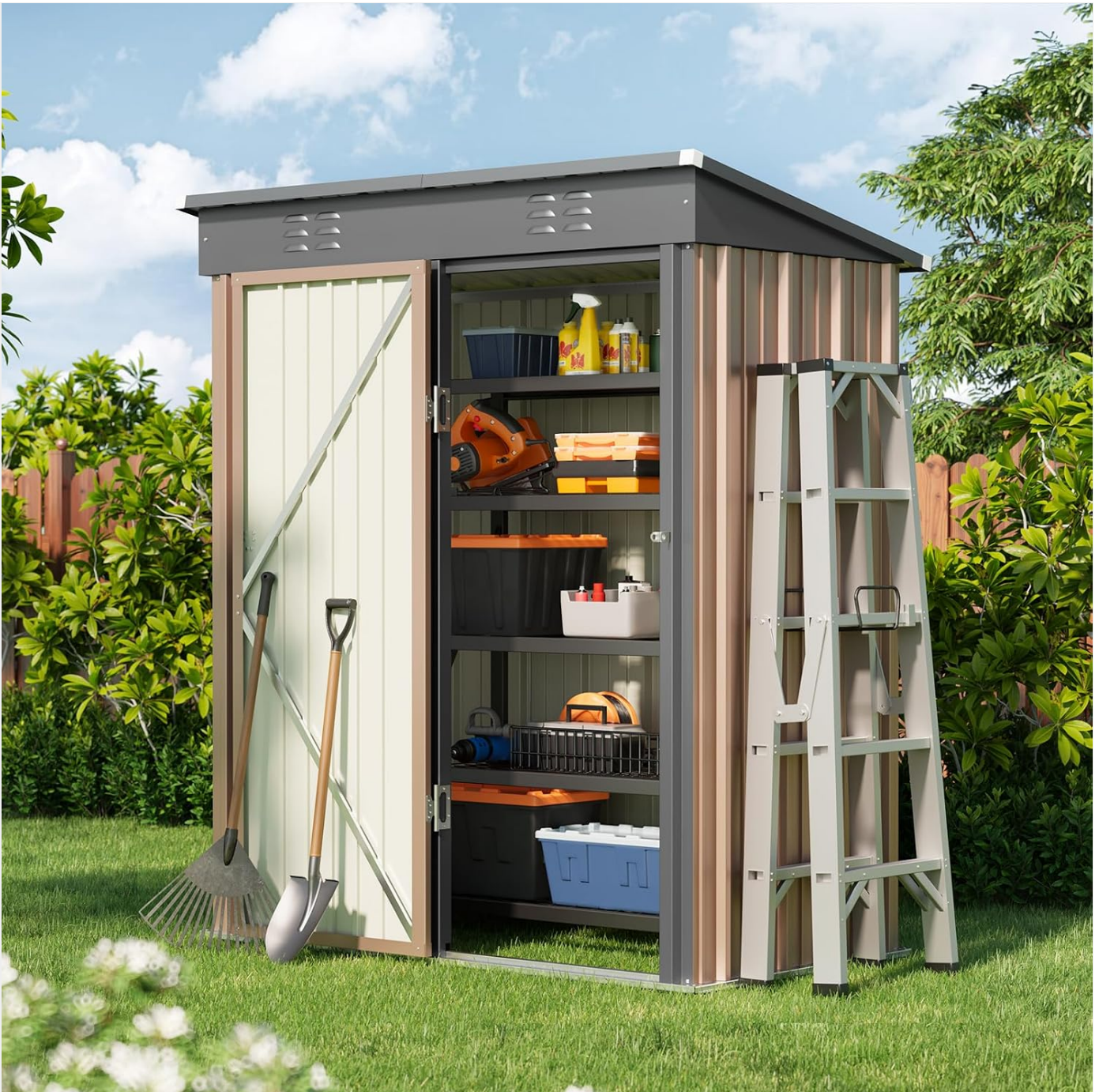
Image: Interior storage capacity with shelves.

Storage Capacity: With approximate dimensions of 155 cm (width) x 87 cm (depth) x 180 cm (height) at the base, the shed offers sufficient room for large garden tools like lawnmowers, hedge trimmers, brooms, rakes, and smaller hand tools. Shelves can be added (if not included) to optimize vertical storage.