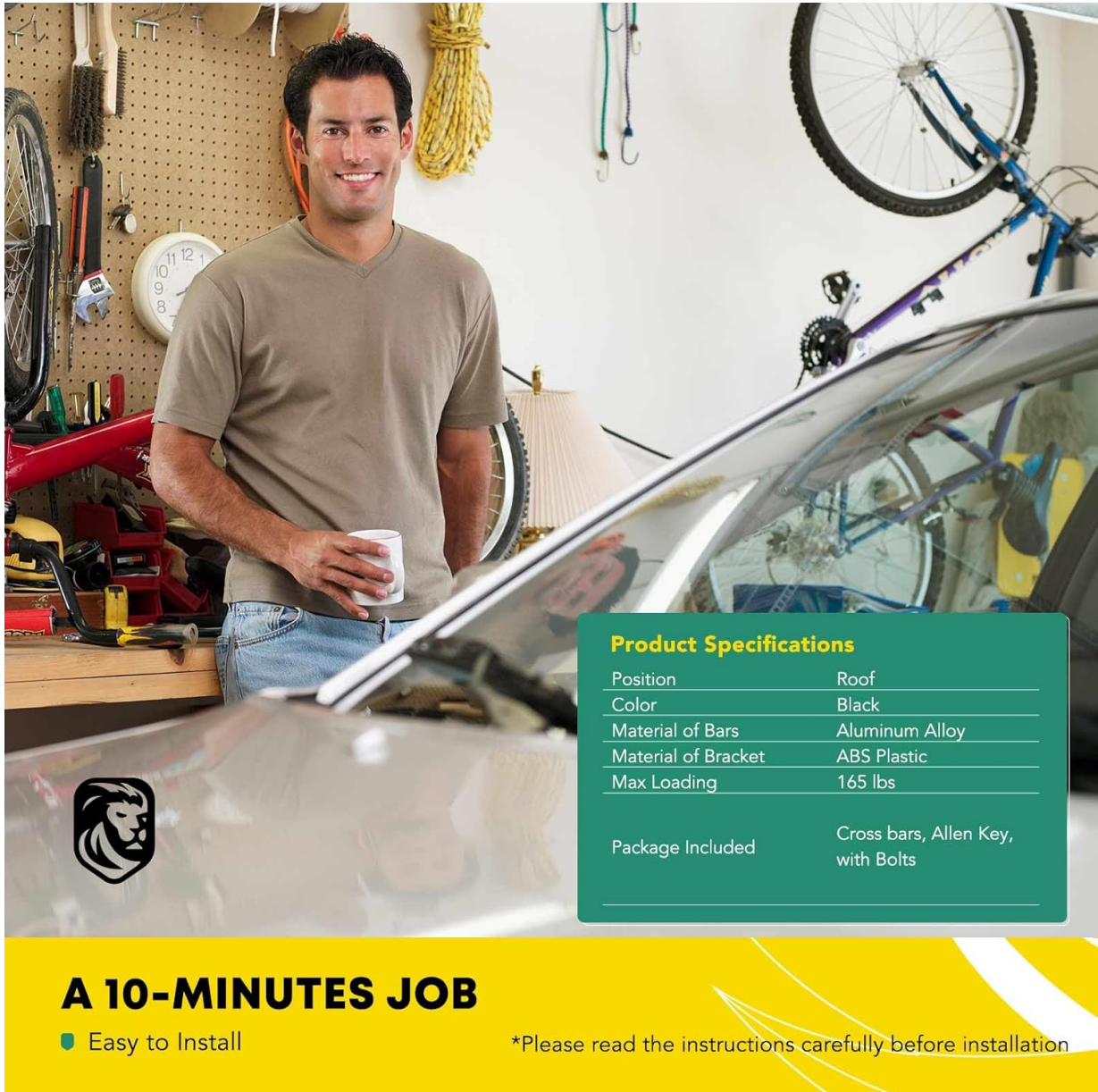
Figure 5.1: Installation Process and Product Specifications. This image depicts a person performing the installation, reinforcing the "10-minutes job" claim, and includes a table of product specifications for quick reference.