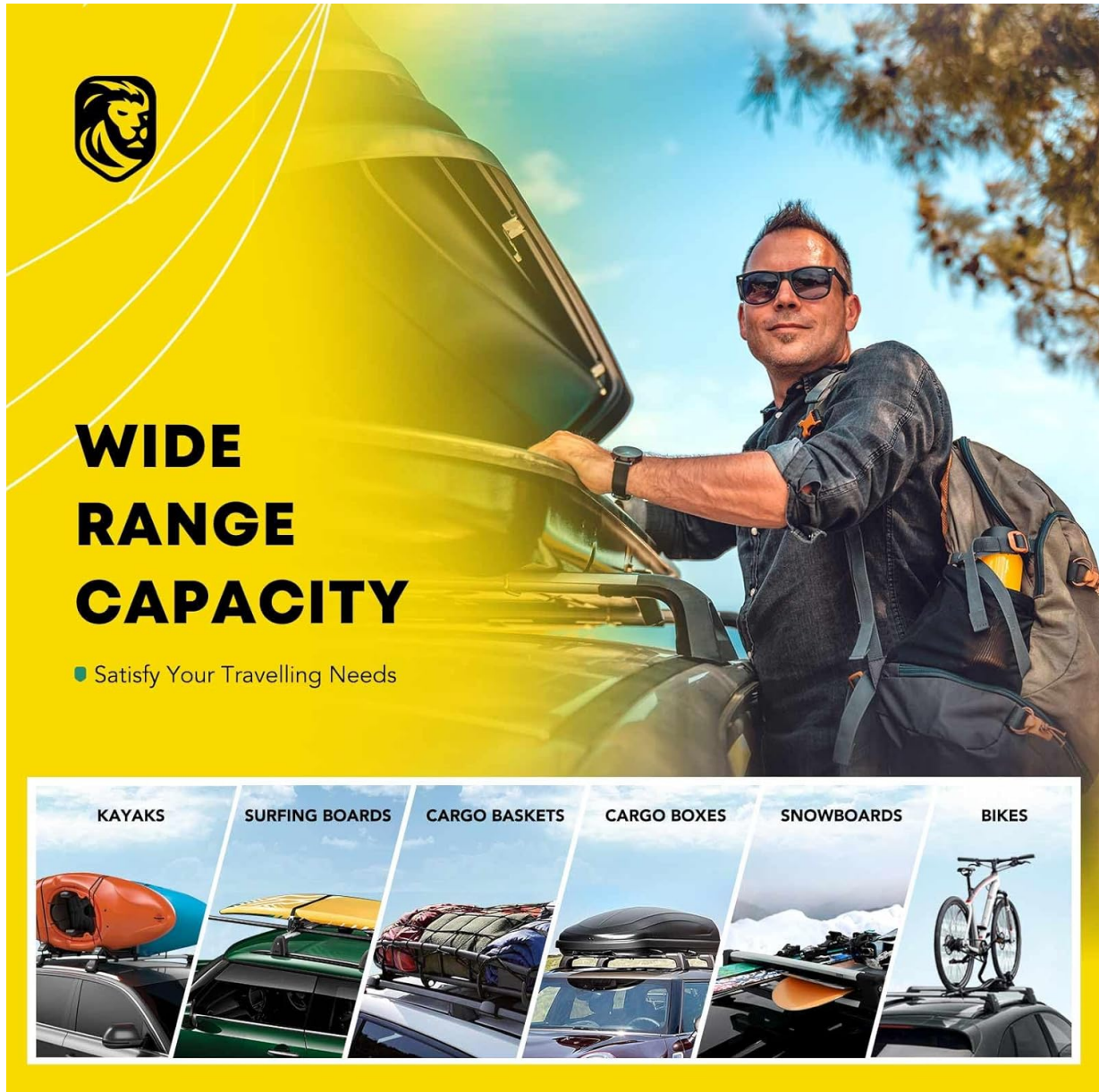
Figure 6.1: Wide Range Capacity. This image demonstrates the versatility of the roof rack, capable of carrying various items such as kayaks, surfboards, cargo baskets, cargo boxes, snowboards, and bikes.