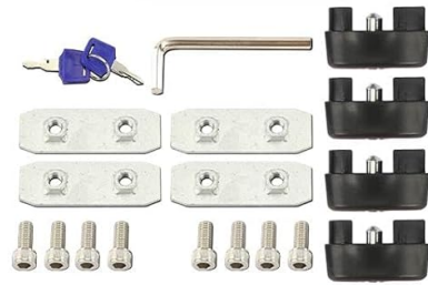
Figure 4.1: Included Components. This image displays the complete set of parts: two cross bars, four bases, hardware, and keys, ensuring you have everything needed for installation.