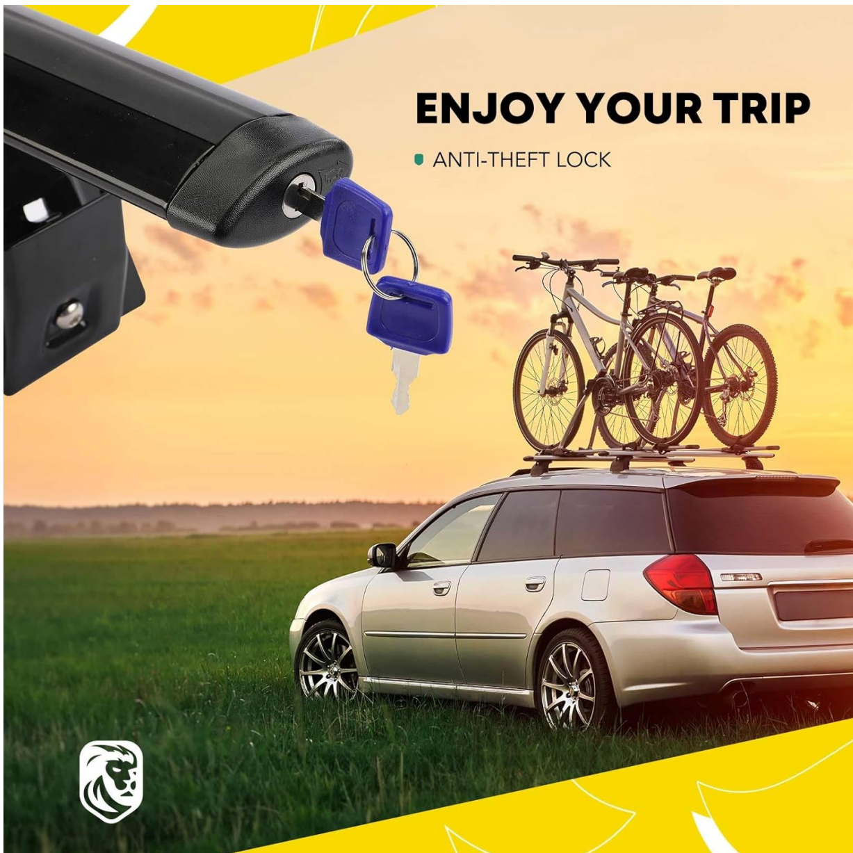
Figure 3.3: Anti-Theft Lock Feature. This image highlights the integrated anti-theft lock, providing security for your cargo.