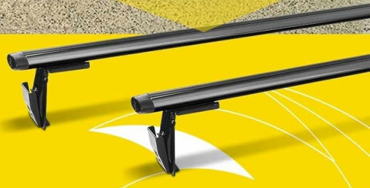
Figure 3.1: Load Capacity and Material Durability. This image emphasizes the 165 lbs (75 kg) load capacity and the rustproof, anti-corrosion properties of the aluminum alloy construction.