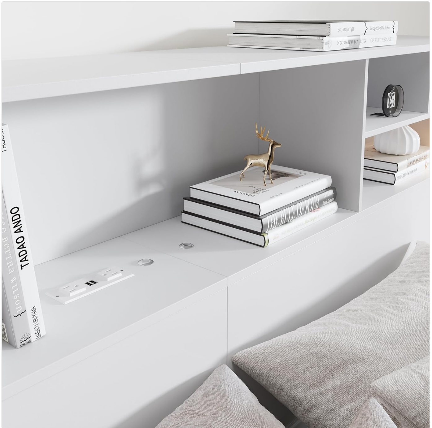
Figure 3: Close-up view of the built-in charging station on the AYEASY headboard, featuring two AC outlets and two USB ports. This allows for convenient charging of various electronic devices.