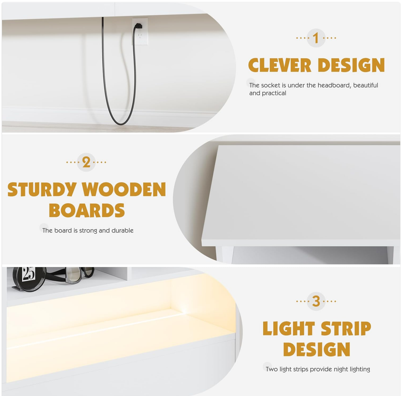
Figure 4: The AYEASY headboard with LED lights illuminated, showcasing the ambient lighting in the storage compartments. The lights add a vibrant touch and cater to nighttime lighting needs.

Video 3: AYEASY home furniture. This video demonstrates the product in a home setting, including a brief segment showing the LED lights changing colors, illustrating their functionality.