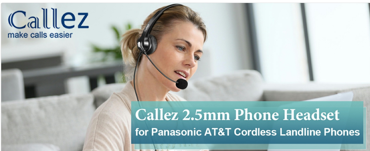
Image: Panasonic DECT Phone Compatibility. The headset connects via a 2.5mm jack to the corresponding port on your phone.