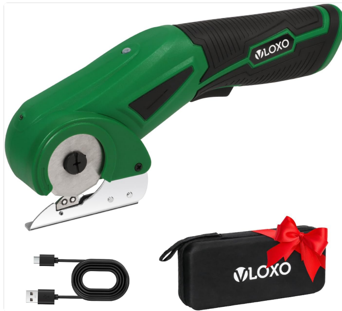
Figure 1: VLOXO Cordless Electric Scissors and included accessories.