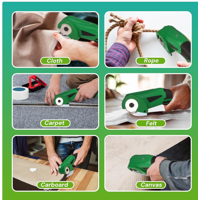
Figure 6: Examples of materials that can be cut with the tool.

Your browser does not support the video tag.