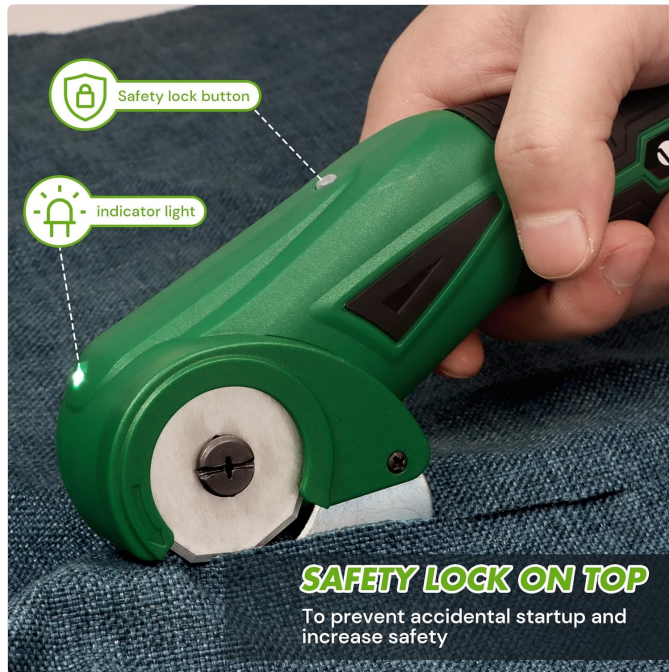
Figure 2: Detail of the safety lock button and indicator light.