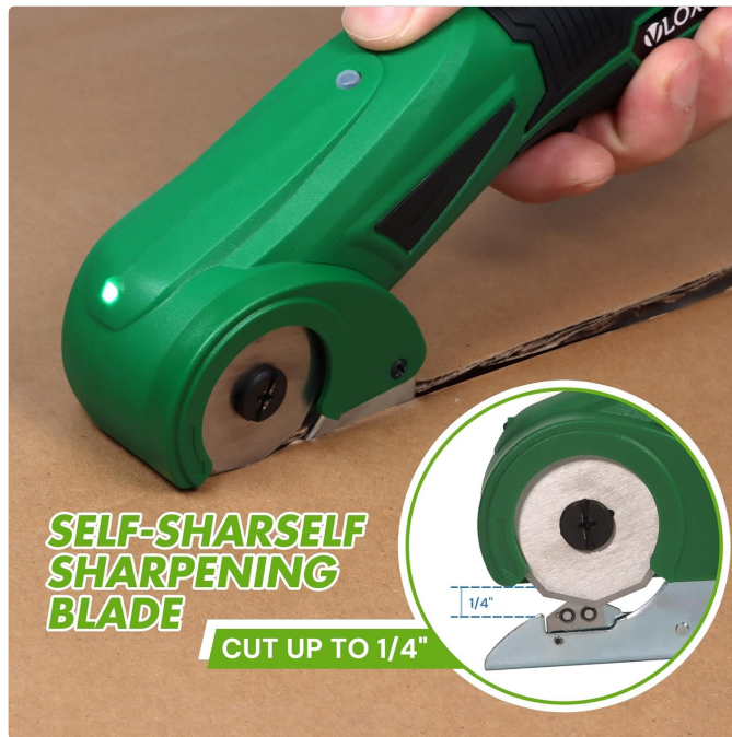
Figure 3: The self-sharpening rotary blade with 1/4-inch cutting capacity.