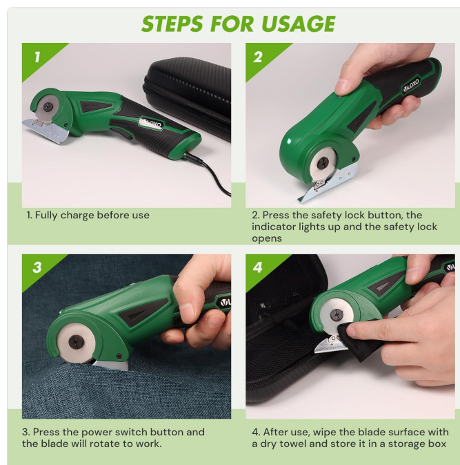
Figure 5: Basic steps for operating the electric scissors.

Ensure the material is positioned flat and stable before cutting. Guide the tool steadily along the desired cutting line. For optimal results, avoid forcing the tool through excessively thick or hard materials beyond its specified capacity.