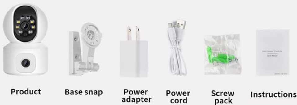
Figure 3: Product Diagram and Packing List. This image shows a detailed diagram of the camera's components (TF card slot, reset button, speaker, power interface, HD cameras, IR LED, microphone) and a visual representation of all items included in the package.