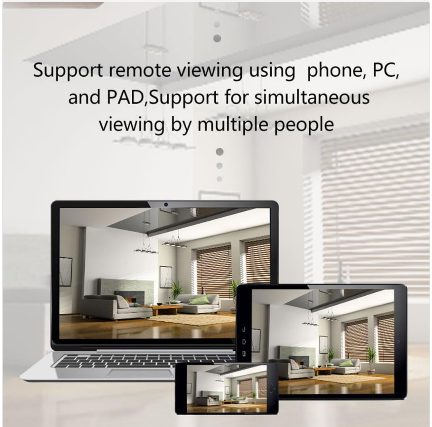
Figure 5: Remote Viewing Capability. This image shows the camera's live feed being viewed simultaneously on a laptop, tablet, and smartphone, demonstrating multi-device and multi-user viewing support.

Access the live video feed through the mobile application. Use the on-screen controls to pan (355° horizontal) and tilt (90° vertical) the camera lens to adjust the viewing angle.