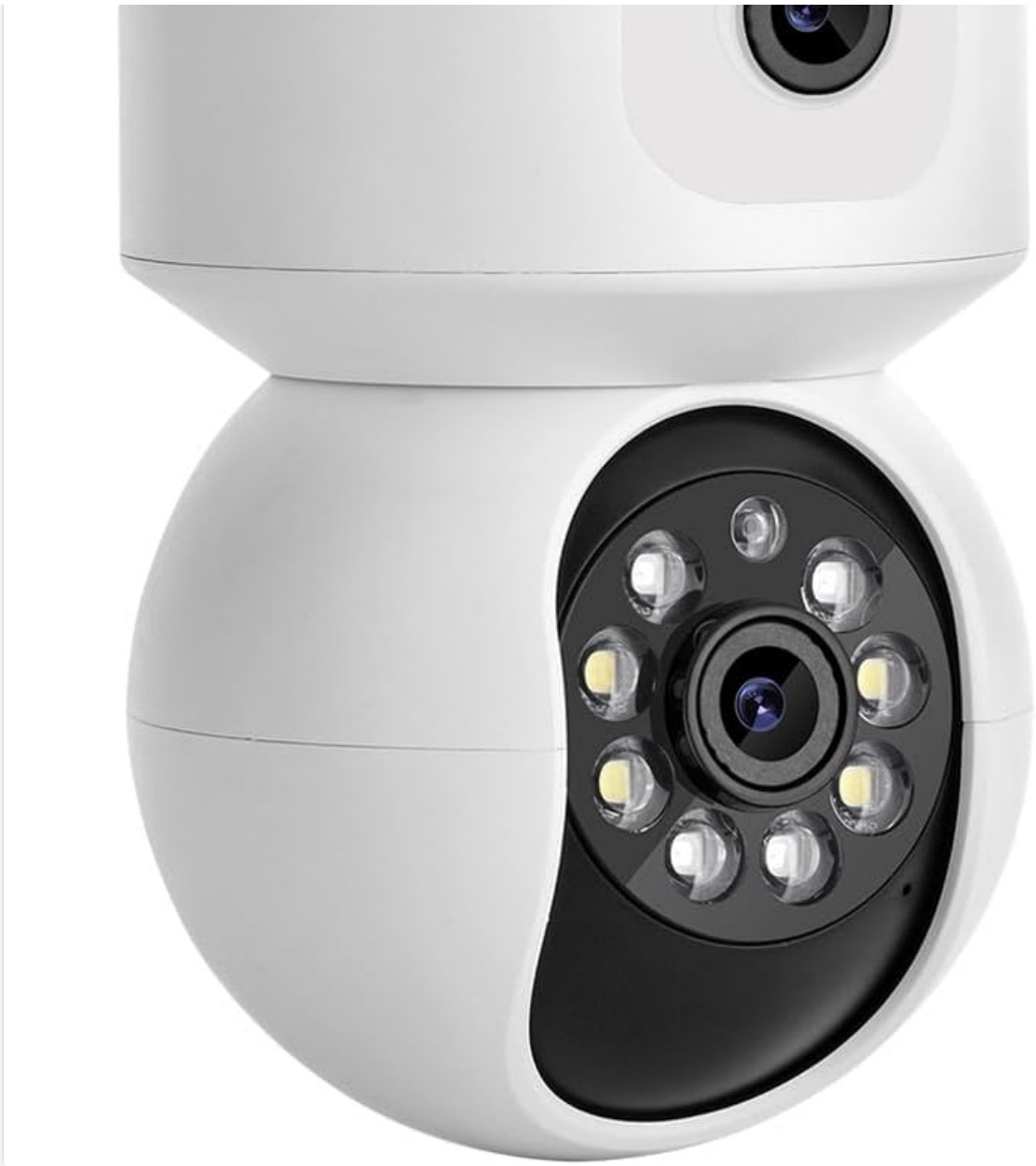
Figure 1: Andoer 1080P HD Wireless Security Camera. This image shows the white dome-shaped camera with its mounting bracket, featuring two lenses and an array of IR LEDs and white lights.