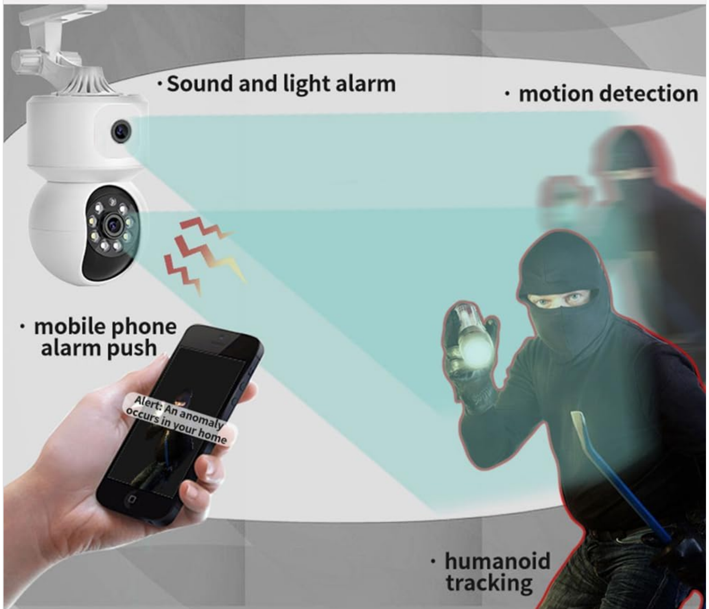
Figure 8: Motion Detection and Warning System. This image illustrates the camera's ability to detect motion, trigger sound and light alarms, send mobile phone alerts, and perform humanoid tracking.