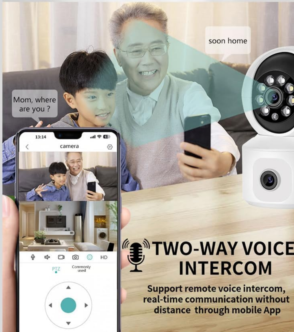
Figure 6: Bluetooth Pairing and Two-Way Audio. This image illustrates the BT pairing process for faster connection and the two-way voice intercom feature, allowing real-time communication through the mobile app.

Support BT network connection, BT network connection is one step faster, faster and more convenient than the regular WIFI network configuration speed