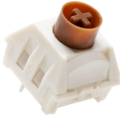
Side profile of the KPREPUBLIC Kailh Box Ice Cream Brown Switch, highlighting the housing design and the stem's position.

A collection of KPREPUBLIC Kailh Box Ice Cream Brown Switches, demonstrating the quantity and consistency of the product.