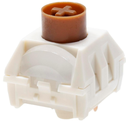
Top-down view of the KPREPUBLIC Kailh Box Ice Cream Brown Switch, showing the cross-shaped stem compatible with MX-style keycaps.