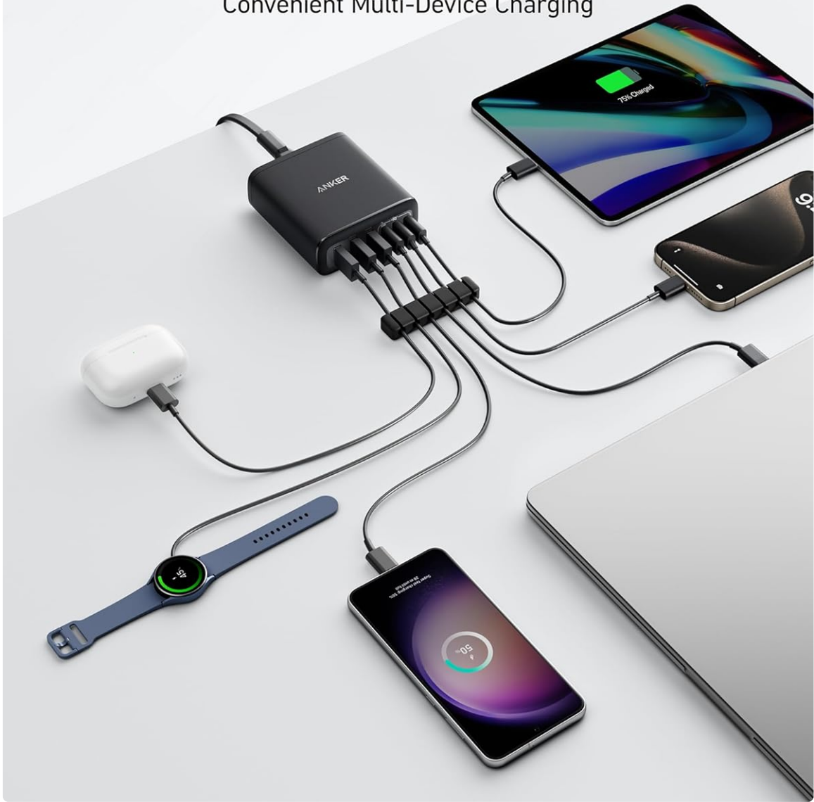
Illustration of the 6-in-1 Fast Charging Station in use, demonstrating its ability to charge various devices simultaneously, including laptops, tablets, smartphones, and wearables.