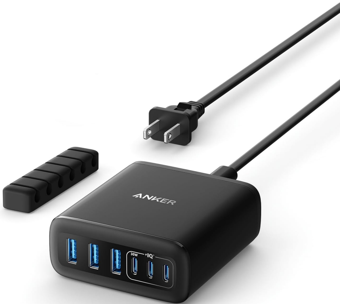
The Anker 112W 6-Port Charging Station, showing its compact design, multiple ports, power cable, and included cable organizer.

protection, static resistance, and output temperature control for safe and reliable charging.