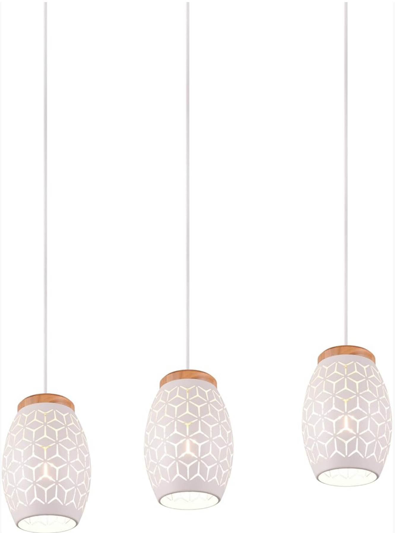
Image 1.1: The Reality Leuchten Bidar R31573031 3-Bulb Pendant Light, showcasing its matte white metal shades with intricate patterns and natural wood accents.