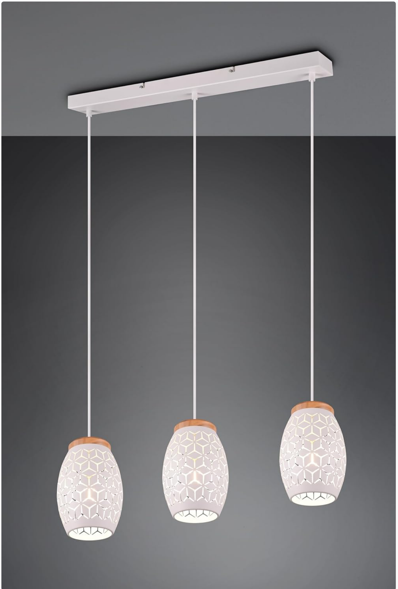
Image 1.2: The Bidar pendant light installed in a modern living space, demonstrating its aesthetic appeal and light distribution.