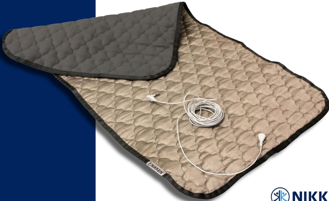
Image: The KenkoGround Mat with its size and weight specifications highlighted.