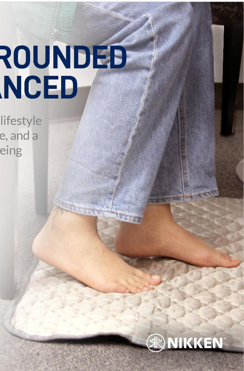
Image: Bare feet making direct contact with the KenkoGround mat, emphasizing proper usage for grounding.