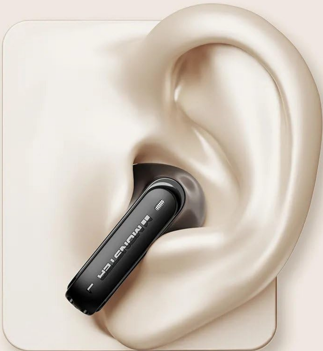
Image: An illustration demonstrating the ergonomic design and proper placement of the Monster XKT12 earphone in the ear for optimal

Semi-in-ear design, skin-friendly and in-ear Lightweight fit, comfortable and stable, comfortable for sports wear