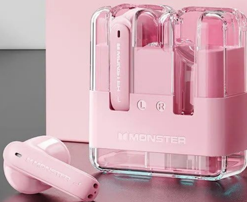
Image: A detailed view of the Monster XKT12 earphone, emphasizing its high-definition sensitive microphone for clear call quality.

The call is clear and the communication is like face-to-face