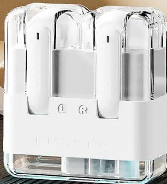
Image: The Monster XKT12 charging case illustrating its extended battery life capability, ensuring prolonged usage.