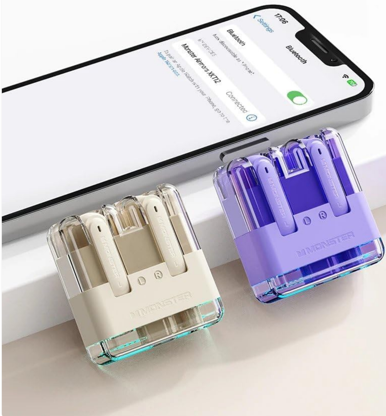
Image: A smartphone displaying its Bluetooth settings, with "Monster XKT12" listed as a connected device, demonstrating the pairing process.

Compatible with most of the devices on the market, the mobile phone can be connected by turning on the Bluetooth function