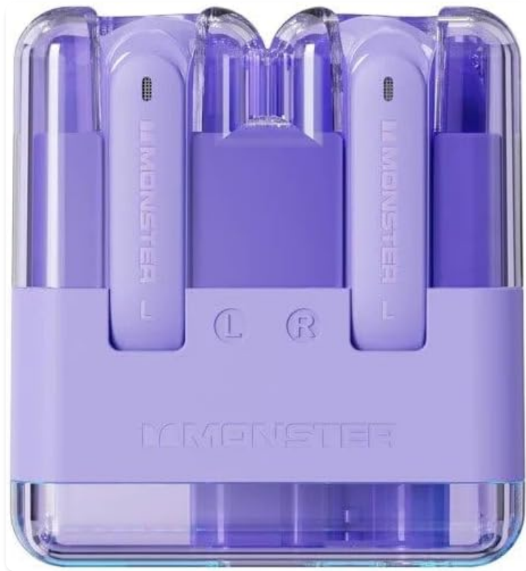
Image: The Monster XKT12 earphones securely placed within their purple charging case, showcasing their compact and portable design.

The Monster XKT12 Gaming Earphones are designed for an immersive audio experience with advanced Bluetooth 5.3 technology. Featuring HIFI sound and noise reduction, these TWS earbuds are perfect for gaming, sports, and daily use.