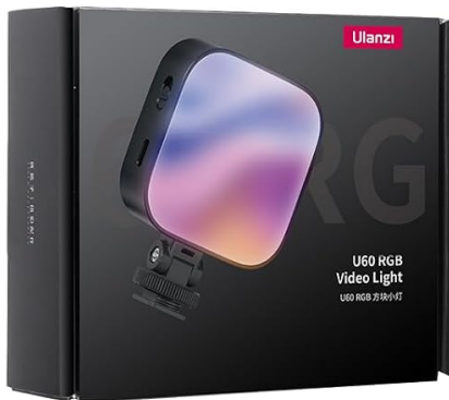
Packaging box * 1