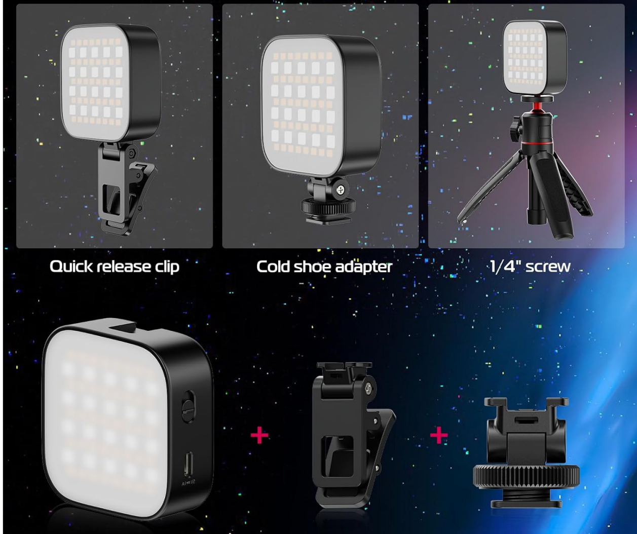
Figure 7.1: The ULANZI U60 offers flexible mounting solutions for diverse shooting environments.