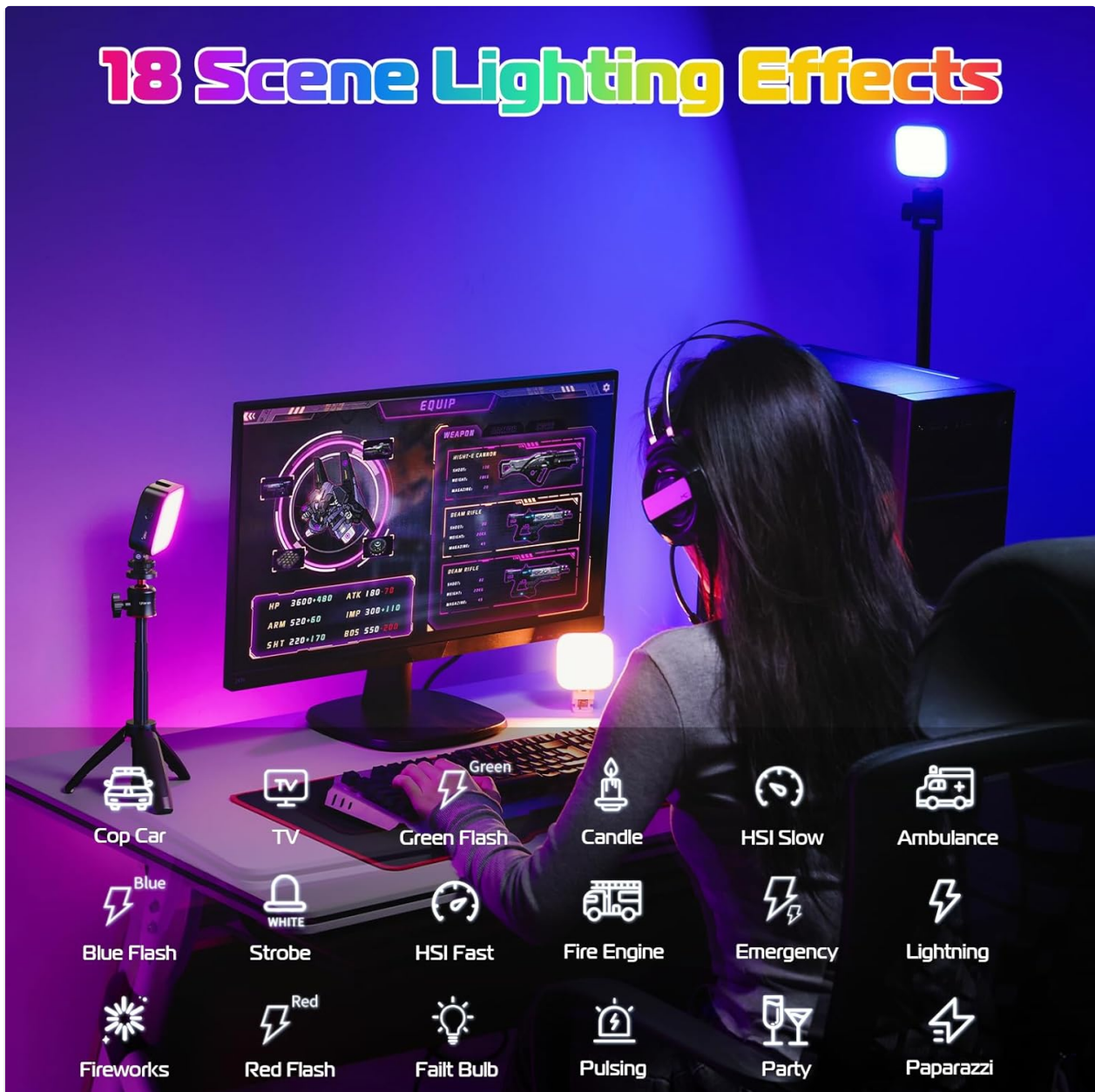
Figure 4.1: The ULANZI U60 RGB Video Light can be used with a quick release clip, cold shoe adapter, or mounted using its 1/4 inch screw.