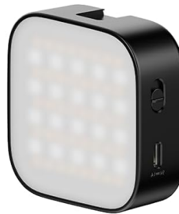
U60 RGB * 1