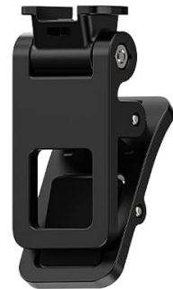
Quick Release Clip * 1