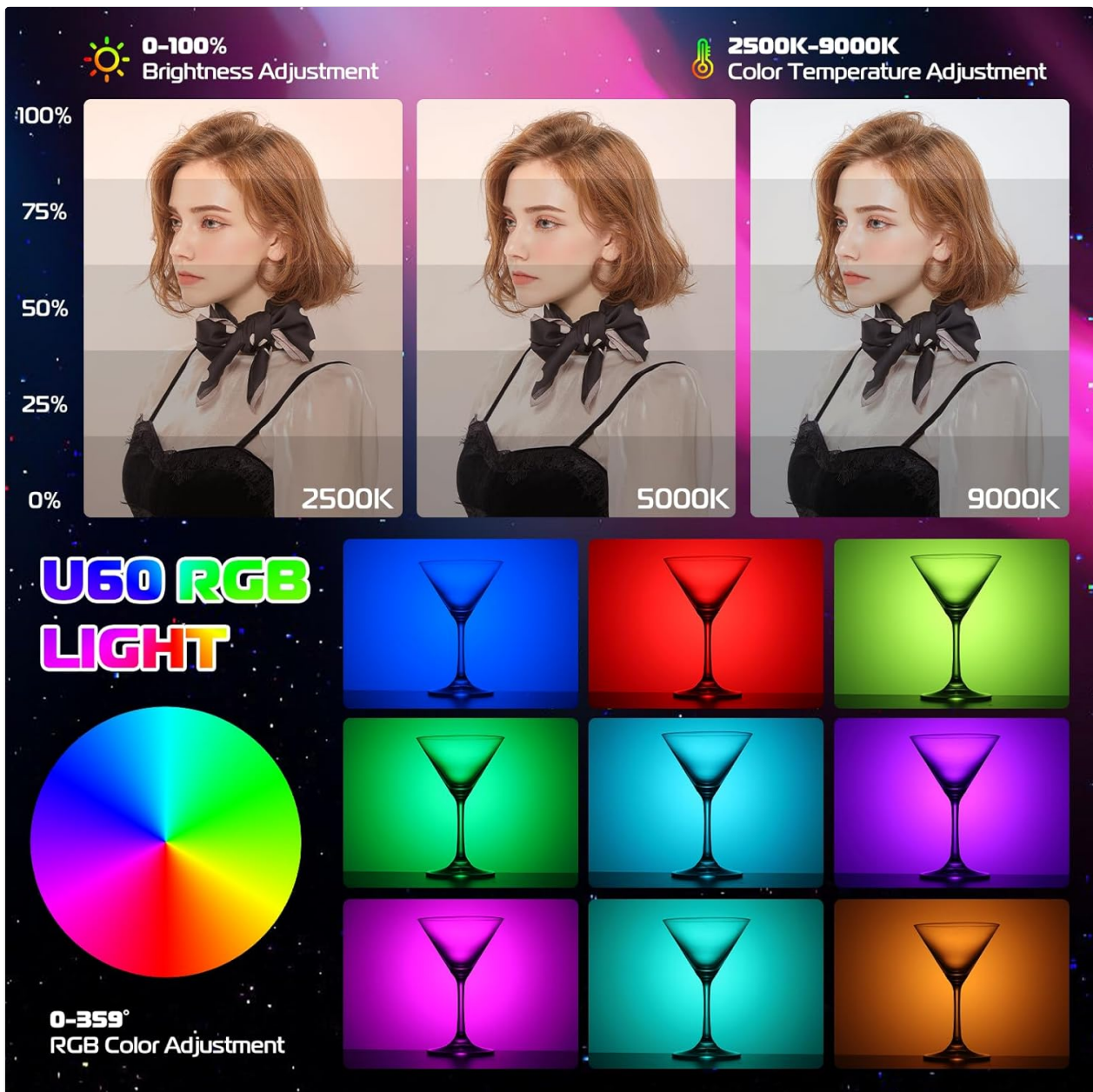
Figure 5.1: Visual representation of the ULANZI U60's adjustable brightness, color temperature, and full RGB color spectrum.