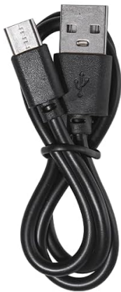
Type-C Cable * 1