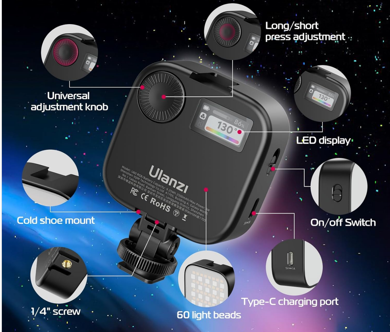
Figure 3.1: Key components of the ULANZI U60 RGB Video Light, including the universal adjustment knob, LED display, and charging port.