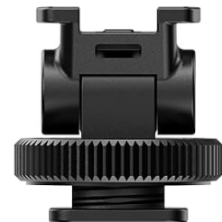
Cold Shoe Adapter * 1