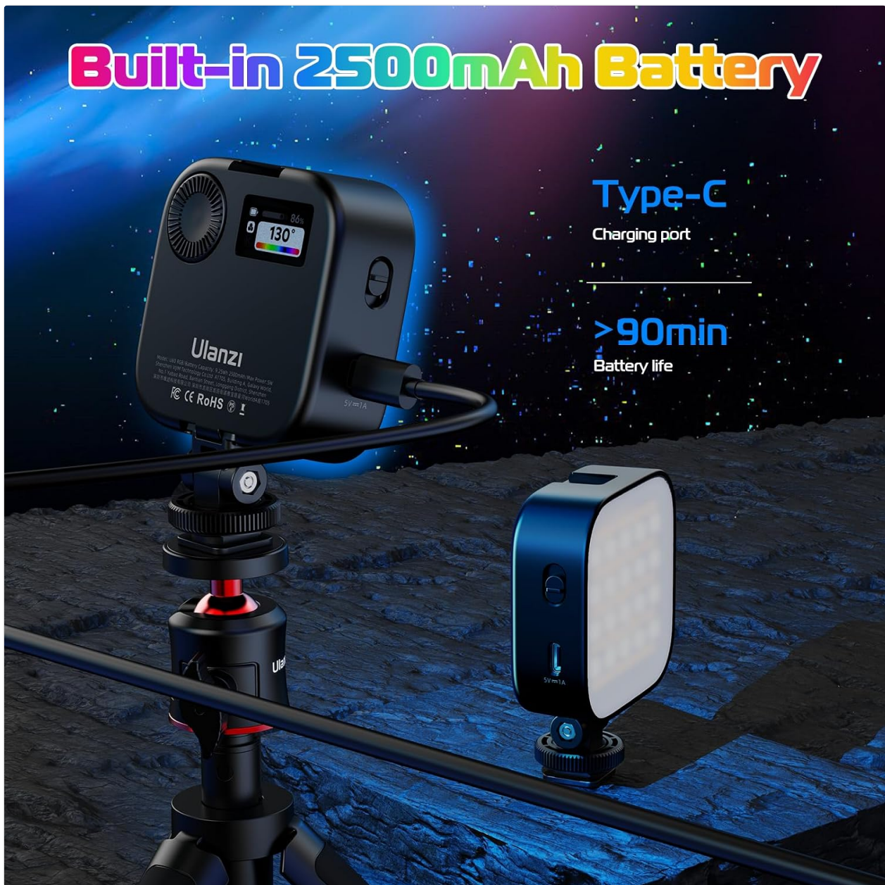
Figure 6.1: The ULANZI U60 features a built-in 2500mAh battery and Type-C charging, offering extended use.