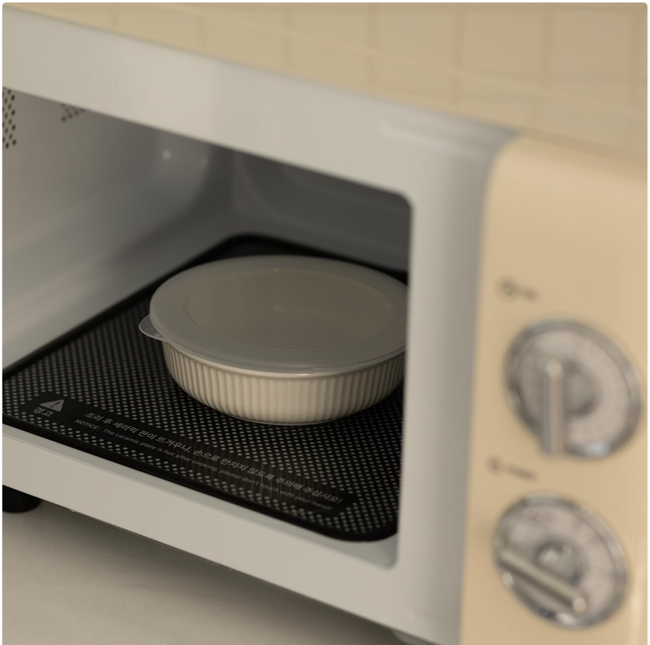
Image: A ZEN Porcelain bowl with its lid on, placed inside a microwave oven for reheating.