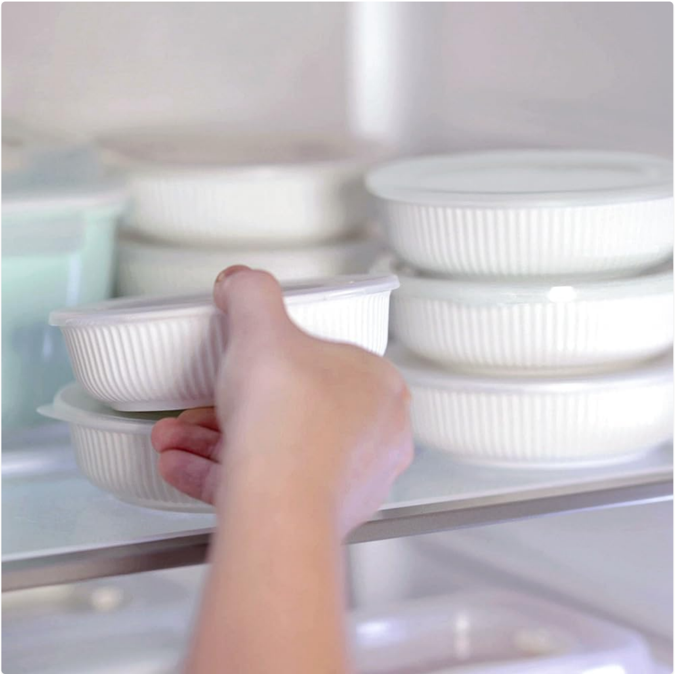
Image: Several ZEN Porcelain bowls with lids stacked neatly inside a freezer, showcasing their storage capability.