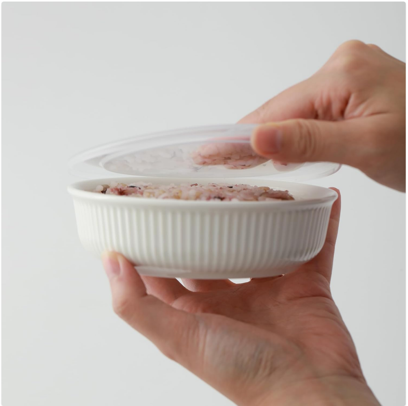
Image: Hands securing the clear lid onto a bowl containing food, demonstrating the airtight seal.