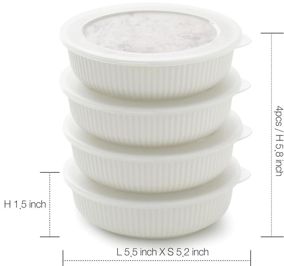
Image: A diagram illustrating the dimensions (5.5 inches width, 1.5 inches height) and 9oz capacity of the bowls.