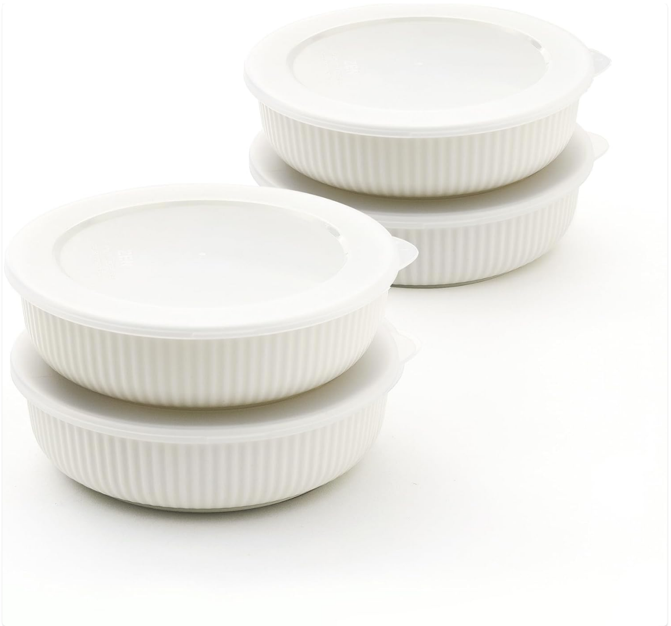
Image: The ZEN Porcelain Serve and Store bowls, showing the four bowls with their clear lids, ready for use.