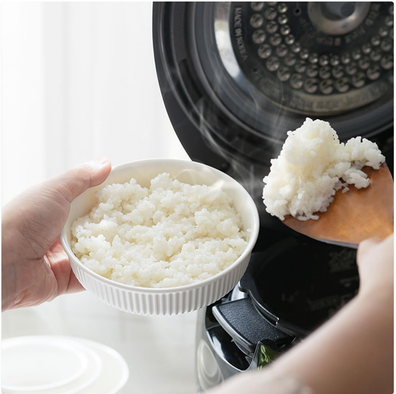
Image: A hand using a wooden spoon to transfer freshly cooked rice into one of the porcelain bowls.