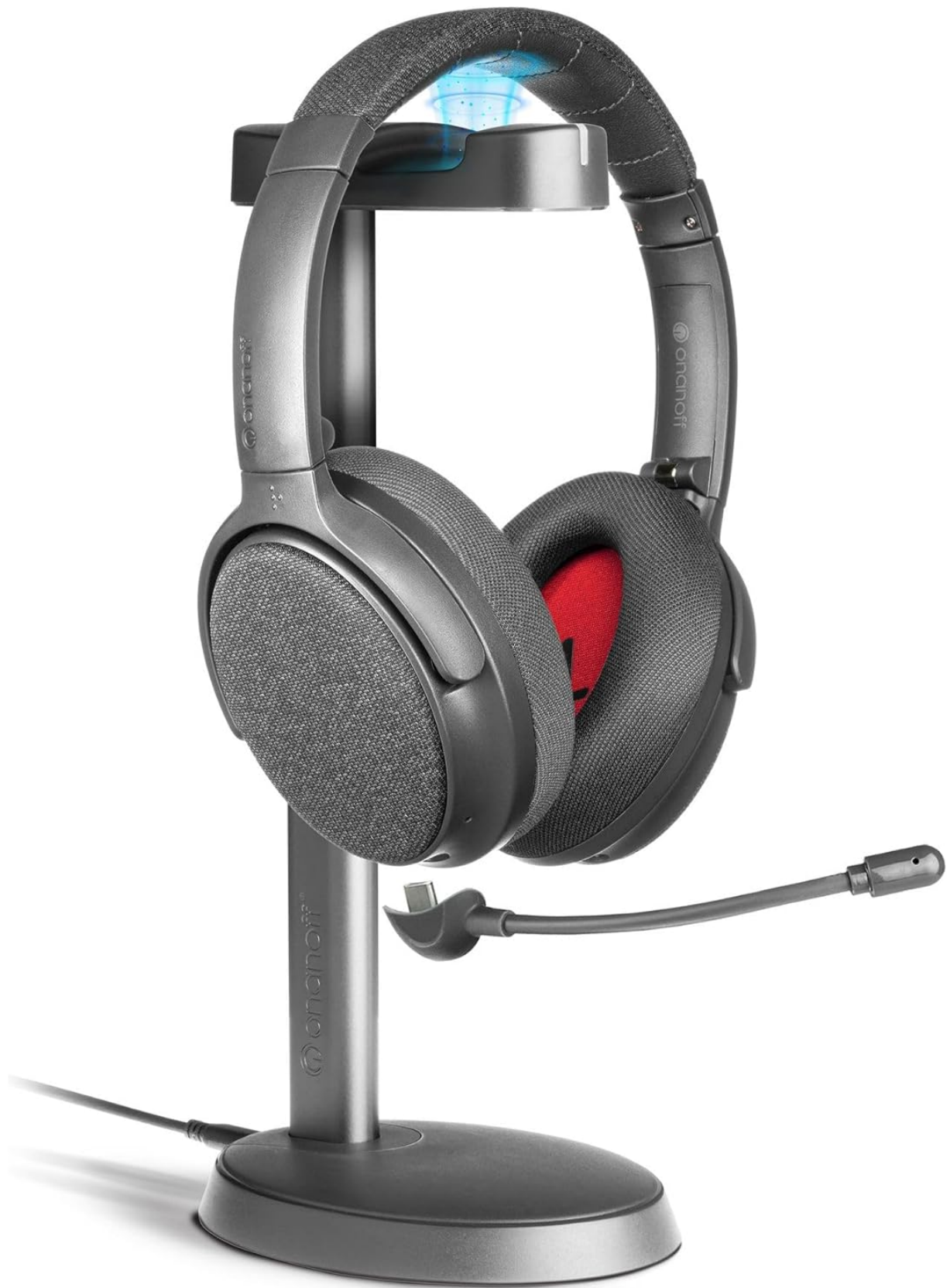
Image: The ONANOFF Fokus+ Headset resting on its dedicated wireless charging stand, illustrating the charging process.