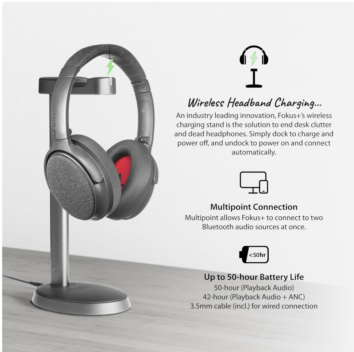
Image: A graphic illustrating the multipoint connection feature, showing the ONANOFF Fokus+ headset simultaneously connected to a smartphone and a laptop, enabling seamless switching between devices.