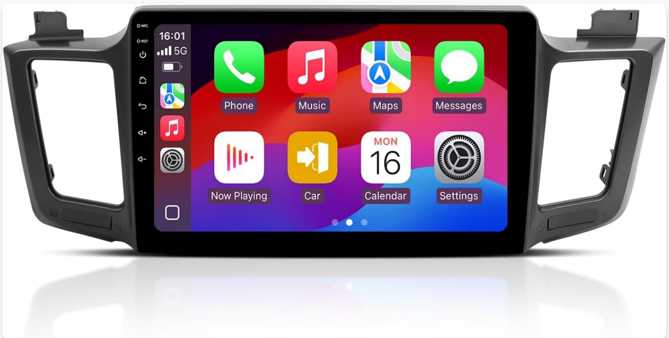
Image: The ViaBecs Android 13 Car Stereo unit, showcasing its sleek design and the Apple CarPlay interface on its QLED display.

This manual provides detailed instructions for the installation, operation, and maintenance of your ViaBecs Android 13 Car Stereo. Designed specifically for 2013-2018 Toyota RAV4 models, this unit integrates advanced features such as wireless Apple CarPlay, Android Auto, and a high-resolution QLED touchscreen to enhance your driving experience.