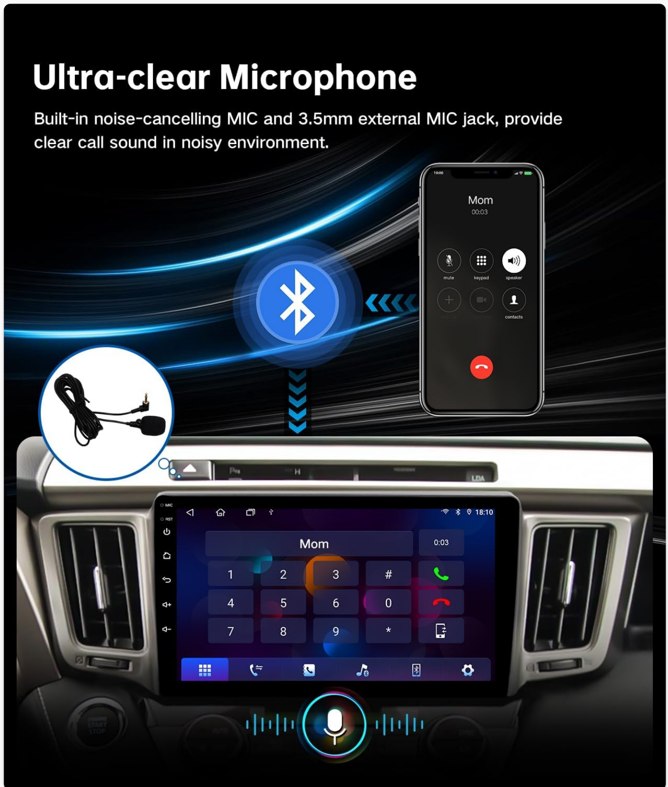
Image: Illustration of the ultra-clear microphone feature, showing a Bluetooth connection between a smartphone and the car stereo for hands-free communication.

Pair your smartphone via Bluetooth 5.0 for hands-free calling and high-quality audio streaming. Access your phonebook and manage calls directly from the unit. The dual microphone ensures clear communication.