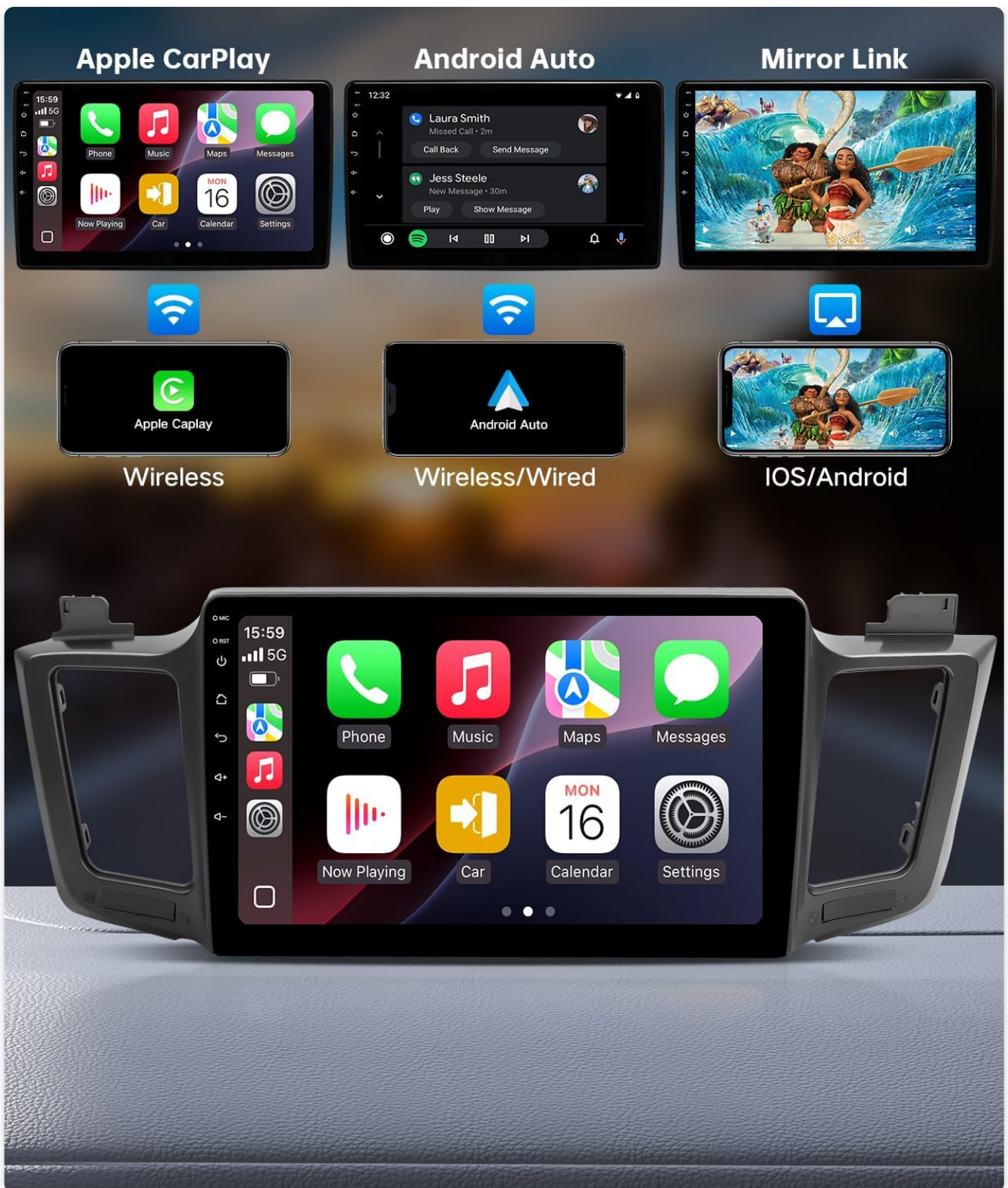
Image: A visual representation of the different connectivity options: Wireless Apple CarPlay, Wireless/Wired Android Auto, and Wired/Wireless Mirror Link, showing their respective interfaces on the car stereo screen.

For a comprehensive installation guide, please refer to the official Installation Manual (PDF) available for download from the product page or contact customer support.