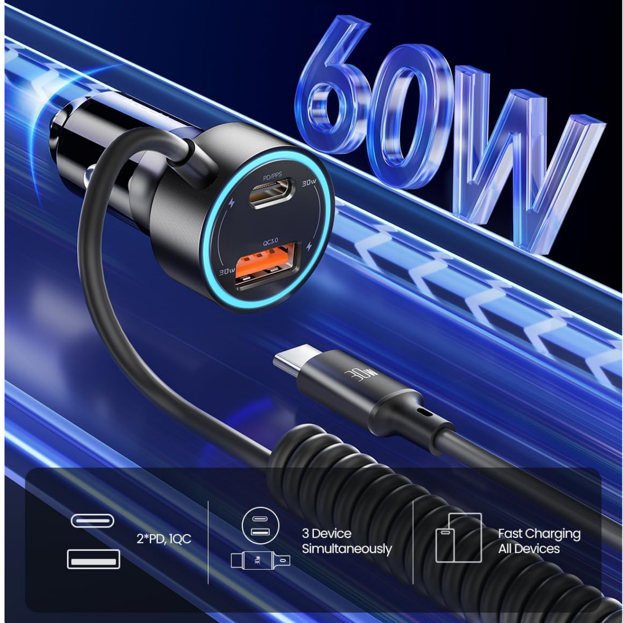
Diagram illustrating the super fast charging capability of the toocki 60W car charger, highlighting the 60W total output and the two distinct charging ports.