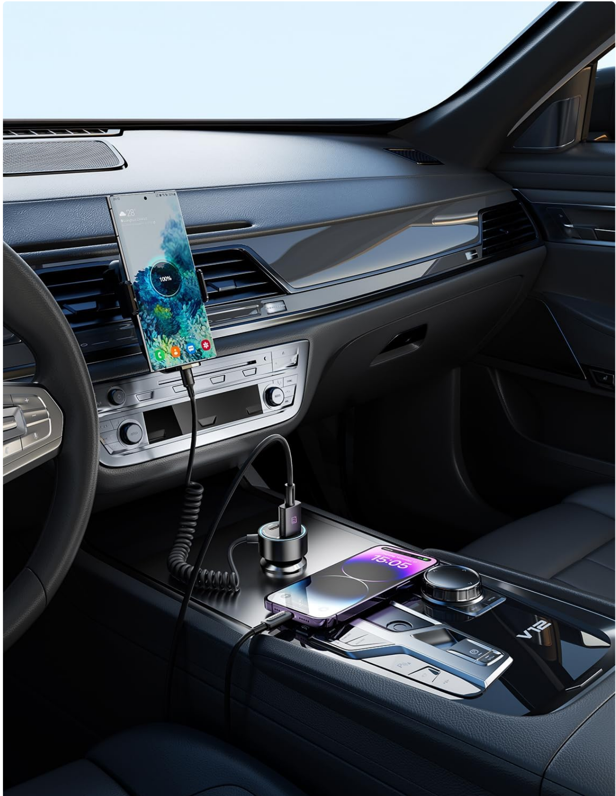
Image showing the toocki car charger in use within a car's interior, charging multiple devices simultaneously, highlighting its practical application.