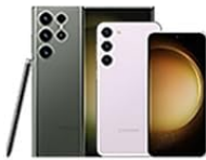
Samsung Galaxy S Series