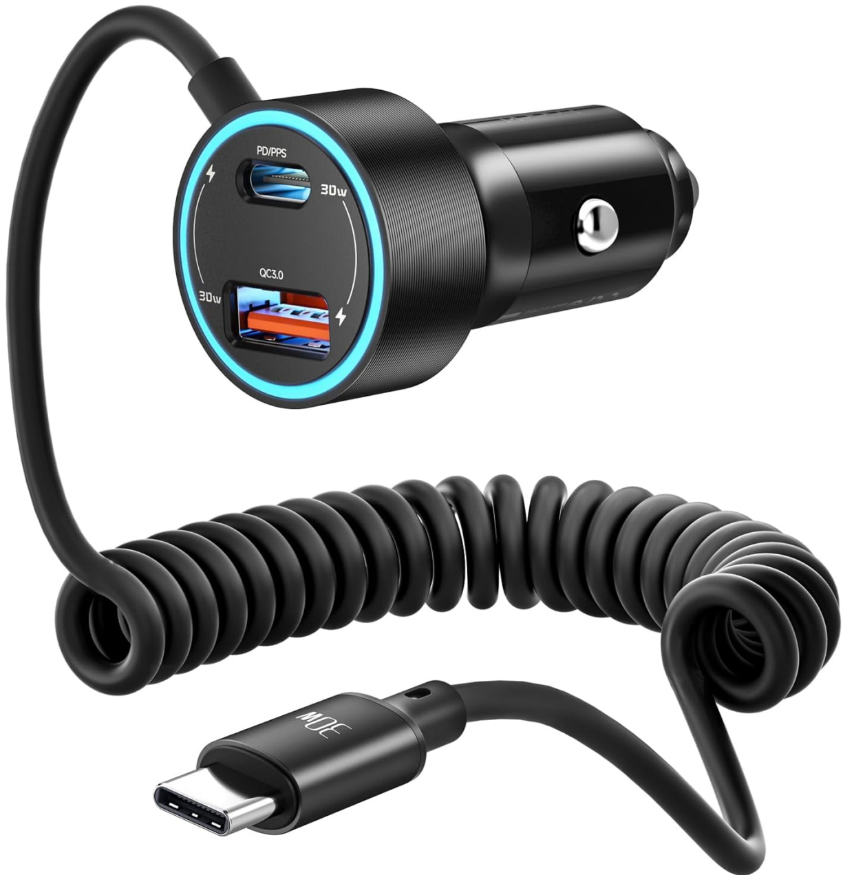
Image of the toocki 60W Car Charger USB C with its integrated coiled Type-C cable, showcasing the dual charging ports (USB-C PD/PPS and USB-A QC3.0) and the cigarette lighter plug.