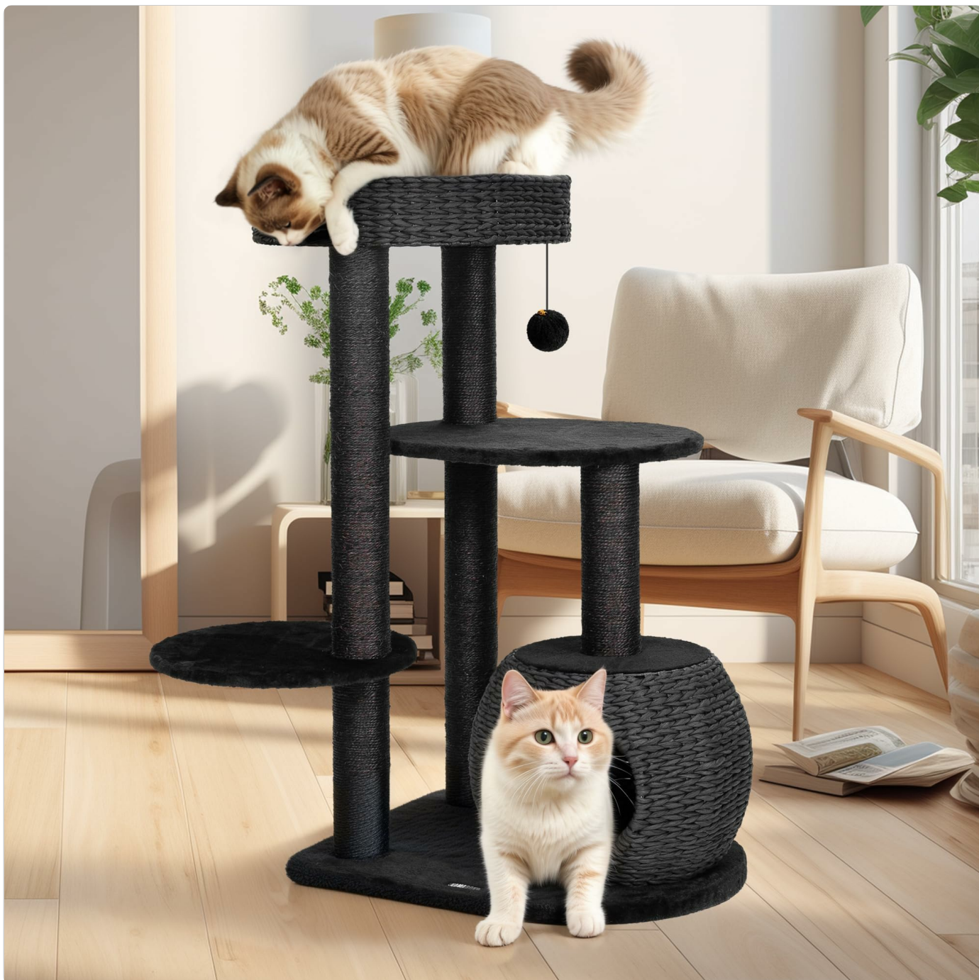
Image: The KAMABOKO Modern Cat Tree 39" H Black, showcasing its multi-level design with a top perch, platforms, and a cat condo. Two cats are visible, one on the top perch and another inside the condo.