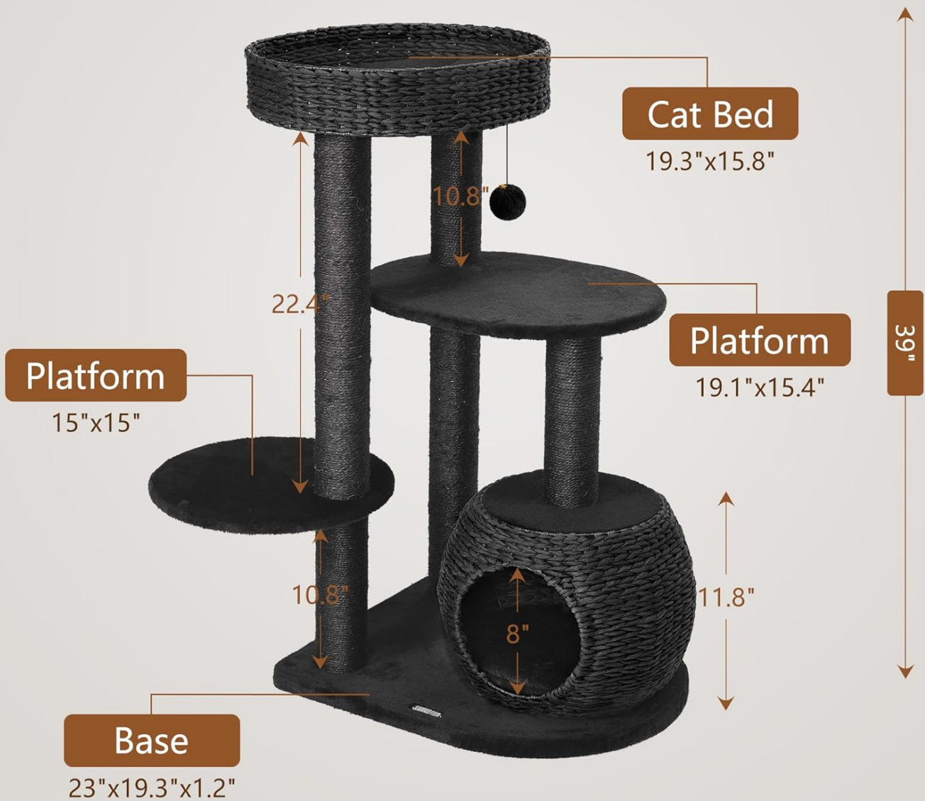
Image: A detailed diagram outlining the dimensions of the cat tree, including the base, various platforms, the cat bed, and the total height of 39 inches.