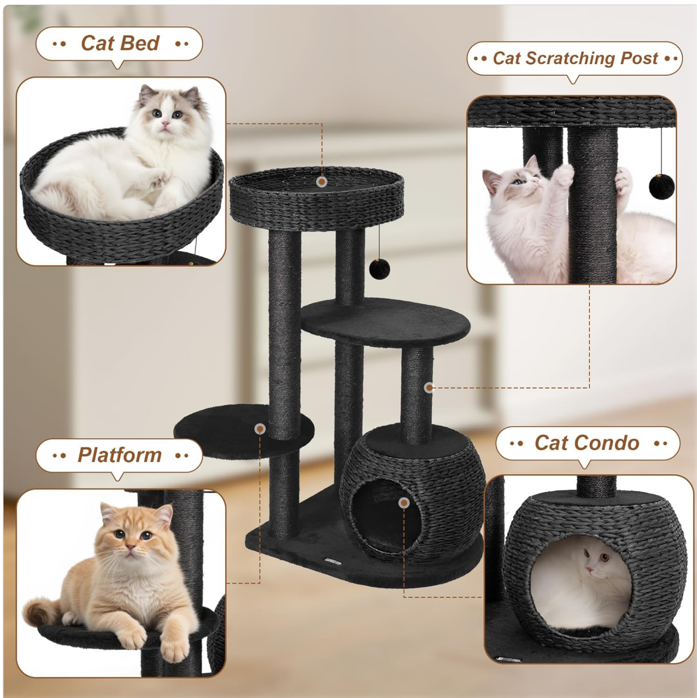
Image: A white cat actively scratching one of the sisal-wrapped posts on the cat tree, demonstrating the scratching feature.