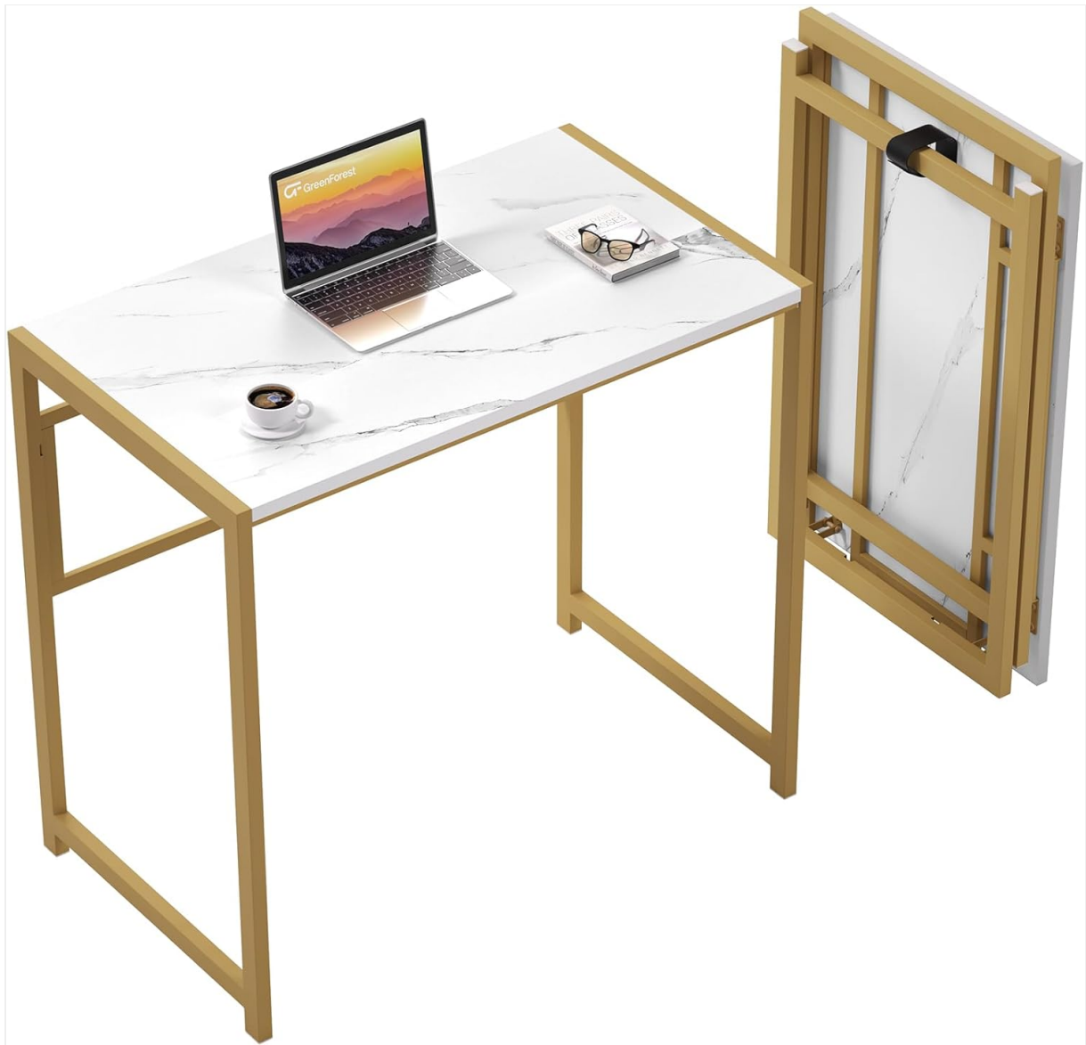
Image: The desk in use as a computer desk in a modern home office setting.