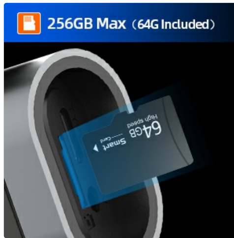
Included components of the WeBeqer Dash Cam Q20.