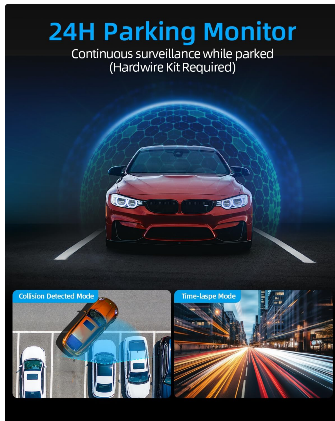
24-hour parking monitor for continuous surveillance.

Fortify your vehicle's safety with the enhanced parking monitor feature. When activated (requires a separate Hardwire Kit), it provides 24/7 protection, ensuring continuous surveillance even when parked. Coupled with the G-sensor, this feature offers peace of mind by detecting and recording impacts.