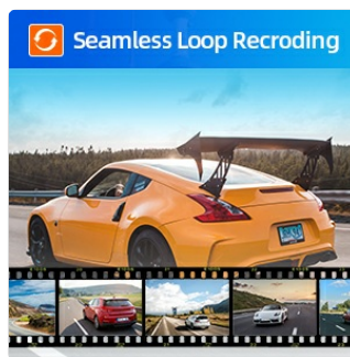
Seamless Loop Recording ensures continuous capture.

Loop recording prevents storage overflows by continuously overwriting the oldest unlocked footage when the SD card is full. This ensures uninterrupted video capture while efficiently managing memory card space.