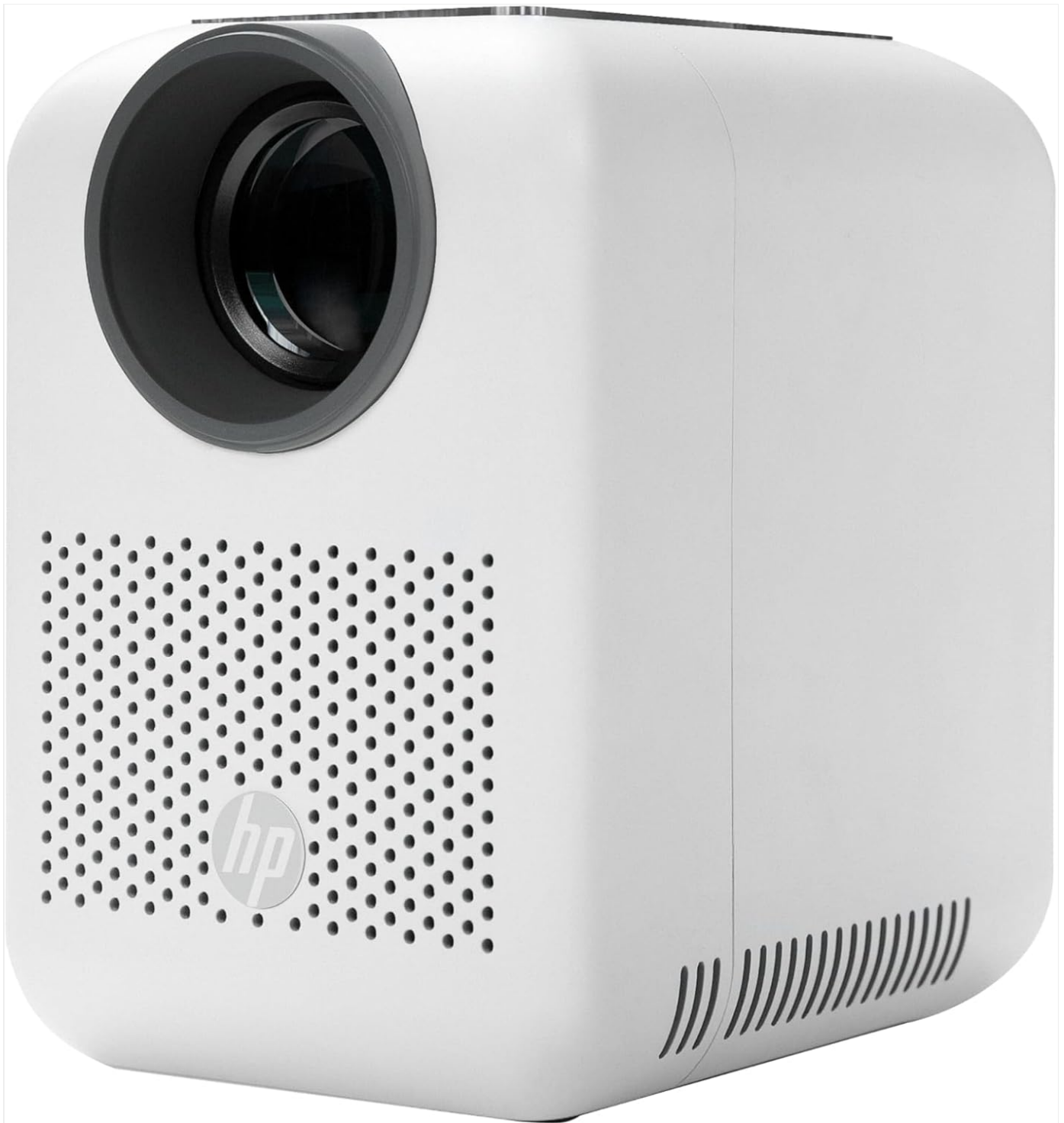
Image: Front view of the HP Projector CC180, showcasing its compact design and lens.