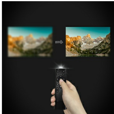
Image: A hand holding the projector's remote control, illustrating the motorized focus adjustment feature.

Use the focus buttons on the remote control to adjust the image clarity. The motorized focus allows for precise adjustments to achieve a sharp picture.