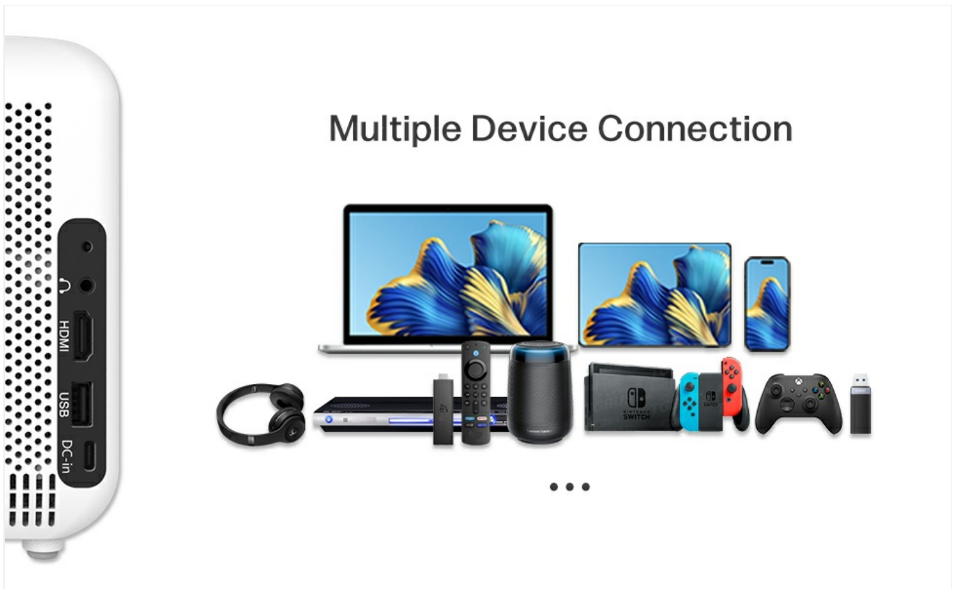
Image: A visual representation of various devices (laptop, phone, game console, streaming stick, USB drive) connecting to the HP Projector CC180 via its available ports.