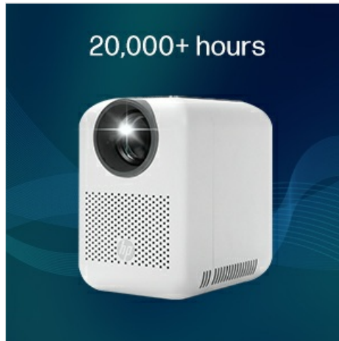
Image: The HP Projector CC180 highlighting its LED lamp life of over 20,000 hours.

The projector utilizes an LED light source with an expected lifespan of up to 20,000 hours, requiring minimal maintenance.