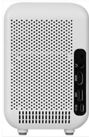
Image: Rear view of the HP Projector CC180, showing the various input ports including HDMI, USB, and USB-C power input.