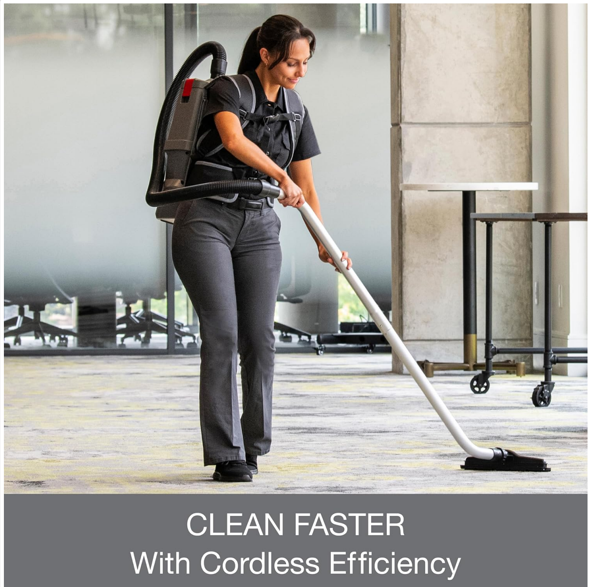
Image: Cleaning a carpeted area with the backpack vacuum.