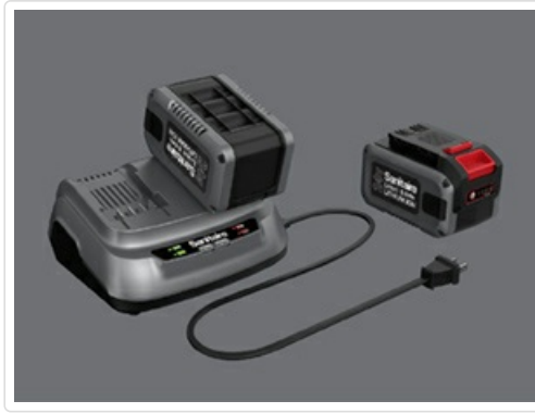
Image: Included accessories for the Sanitaire Transport Commercial Cordless Backpack Vacuum.