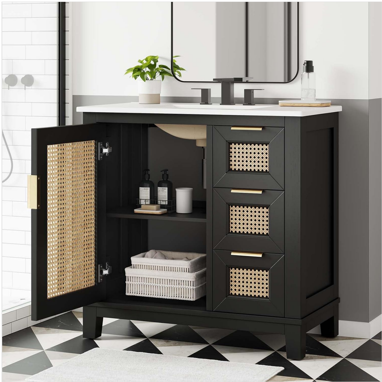
Figure 3: Interior view of the vanity cabinet with the door open, showing the adjustable shelf.