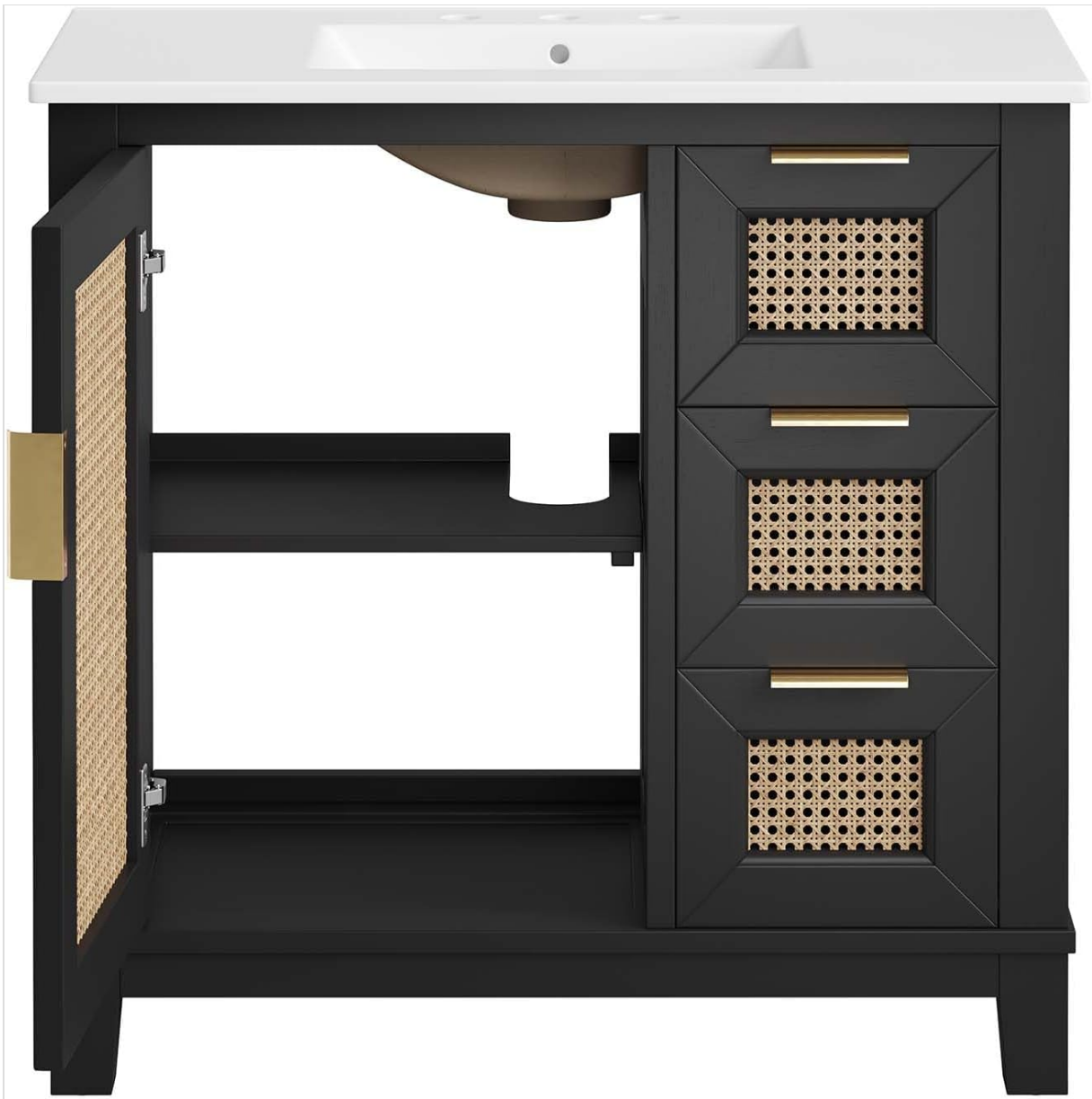
Figure 4: Front view of the vanity cabinet with drawers partially open.

Your browser does not support the video tag.