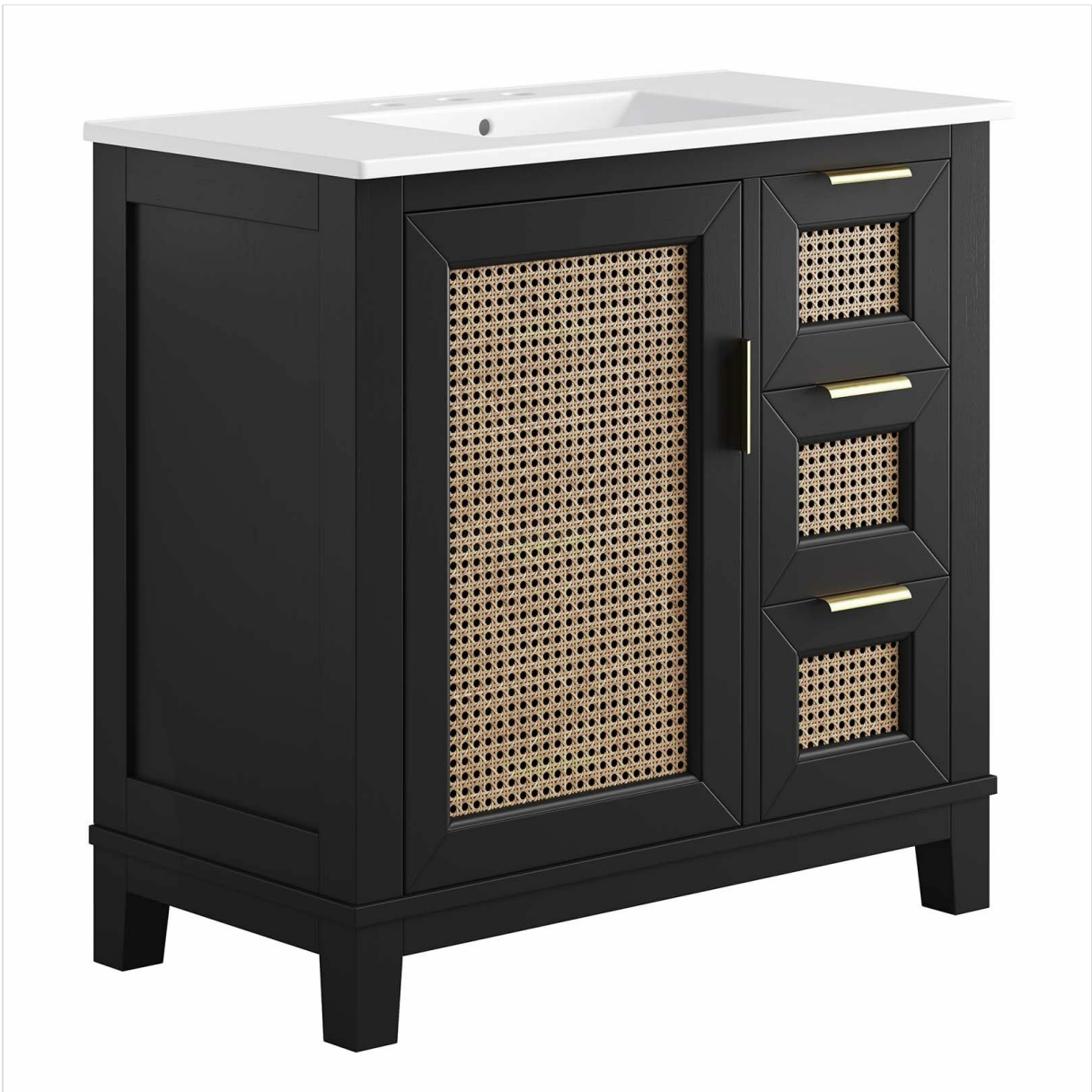
Figure 1: Front view of the Modway Dixie 36-inch Bathroom Vanity Cabinet.