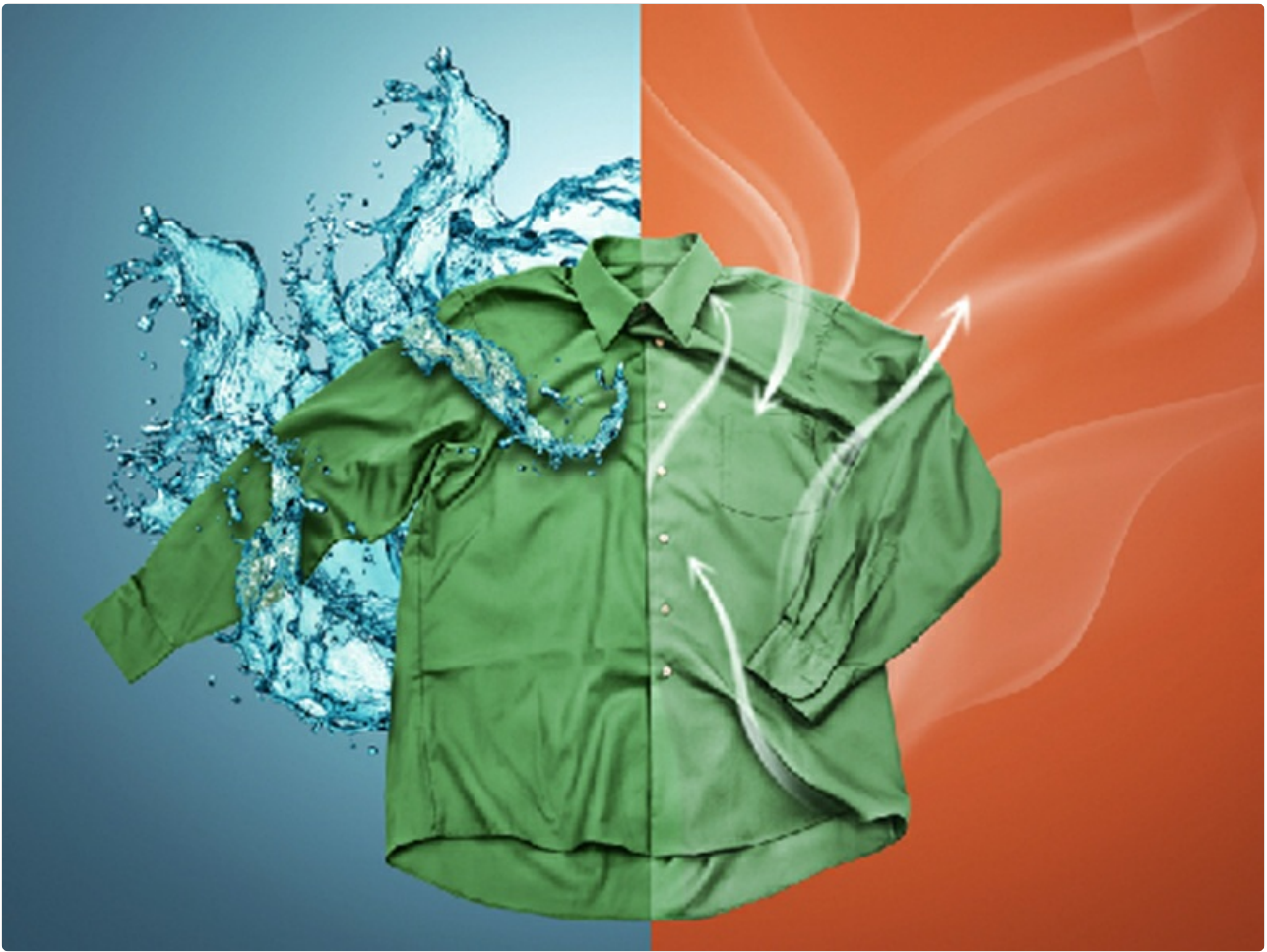
The Steam Refresh function revitalizes garments with steam, reducing odors and wrinkles without a full wash cycle.