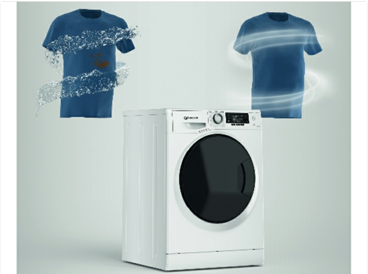
Active Care ensures thorough cleaning by pre-mixing detergent, while Steam Hygiene provides deep sanitization for your laundry.