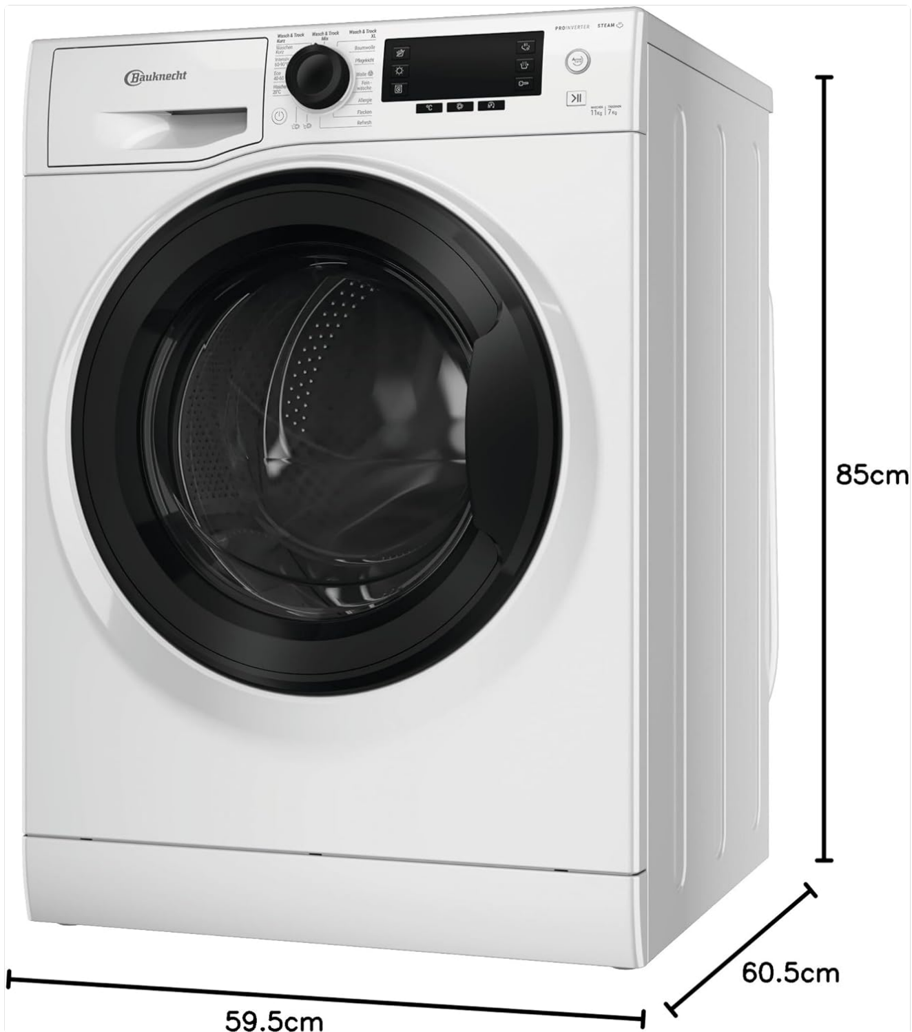
Dimensional diagram of the Bauknecht washer dryer, providing precise measurements for installation planning.