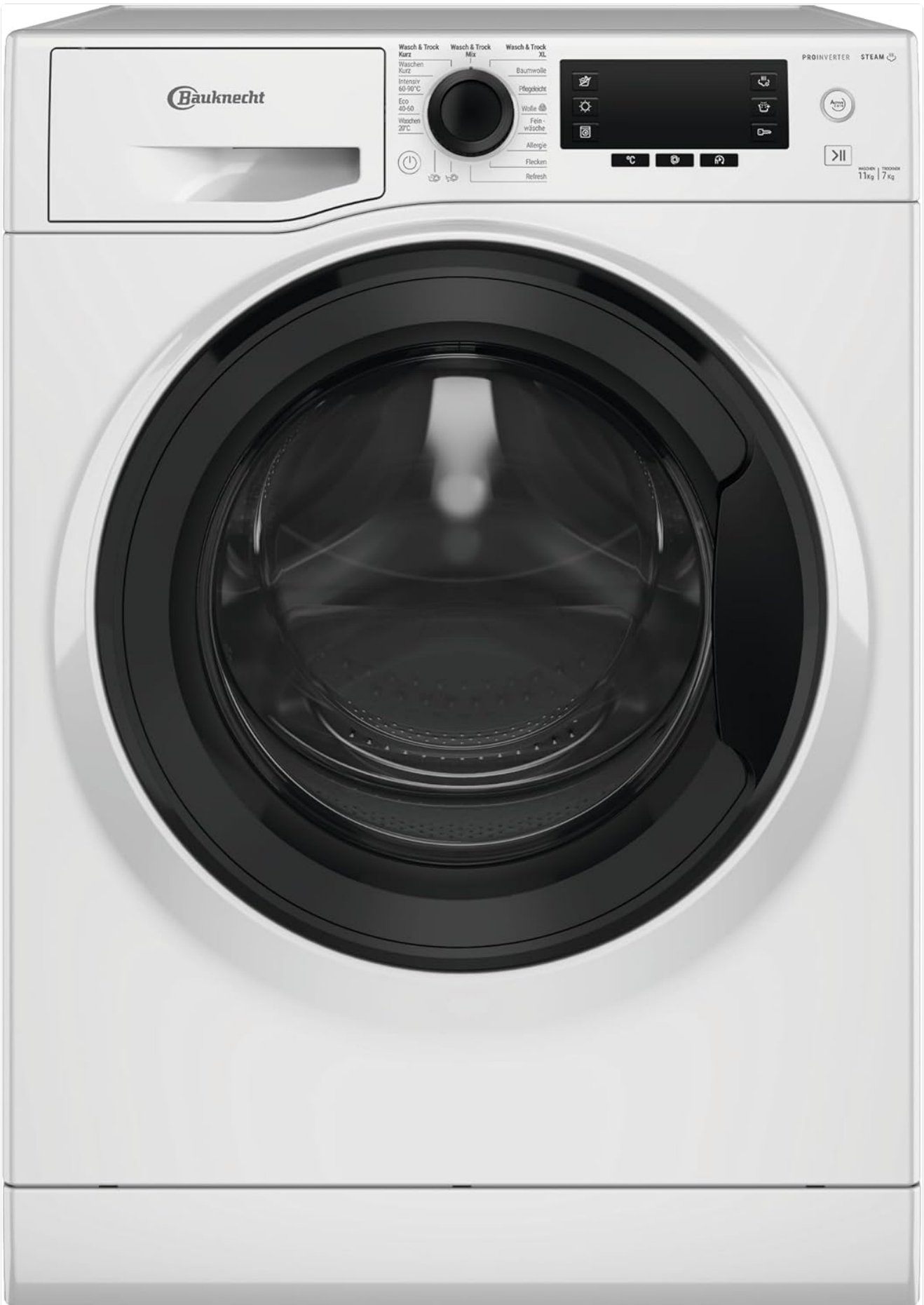
Front view of the Bauknecht WATK Sense 117B 59 N washer dryer, showcasing its sleek white design and central control panel.