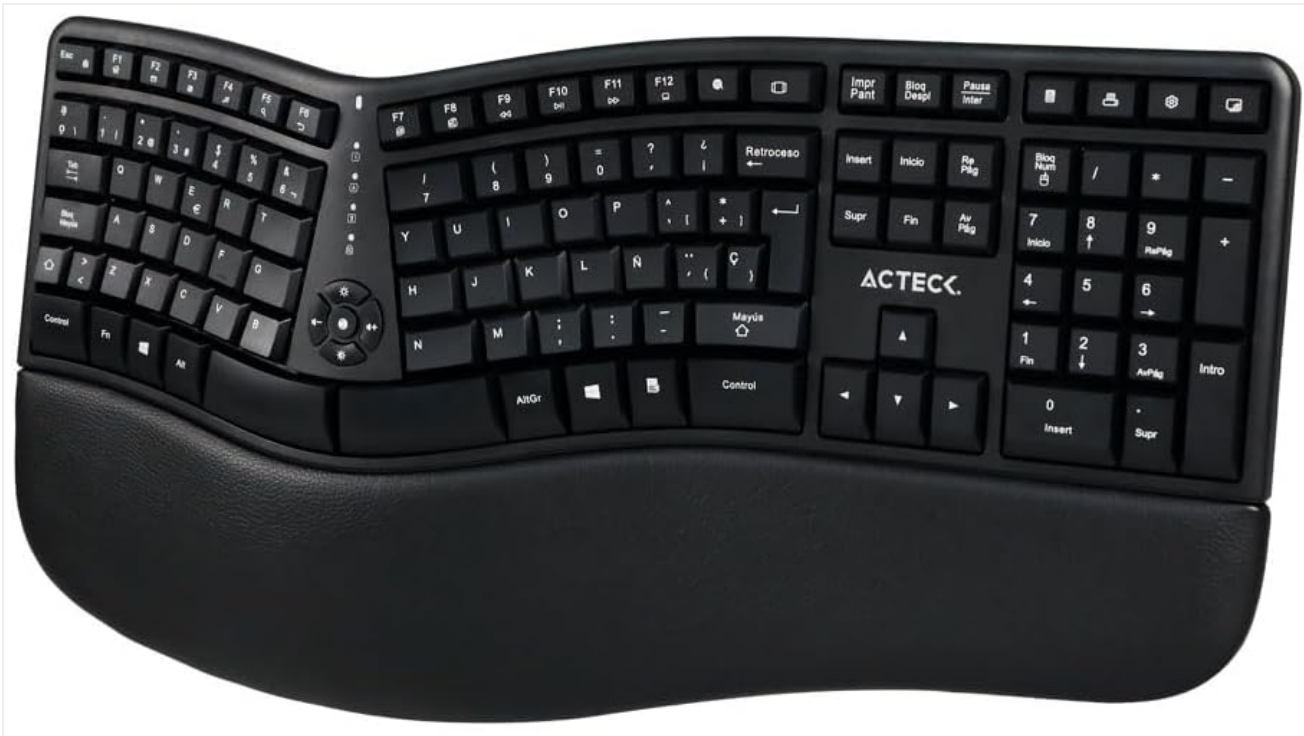
Image: The Acteck VIRTUOS Fitt MK770 ergonomic wireless keyboard and vertical mouse, as included in the kit.