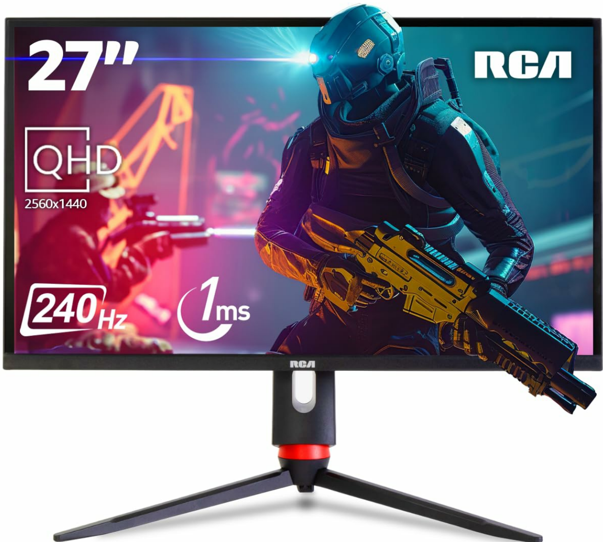
Figure 3: The RCA 27" Evolution Premium QHD Gaming Monitor showcasing a dynamic game scene with rich colors and sharp details.

Experience ultra-smooth gameplay and quick reactions with the QHD 2K display and 240Hz refresh rate. The 1ms response time ensures fluid motion, keeping you ahead in competitive gaming.