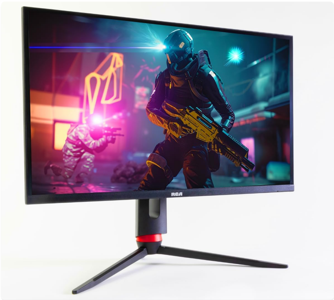
Figure 4: Front view of the RCA M27PG135F monitor, highlighting its borderless design and adjustable stand for ergonomic comfort.

The monitor features a borderless design for enhanced viewing and an ergonomic stand that allows for height, swivel, and tilt adjustments, ensuring comfort during long gaming sessions. It also supports VESA 100x100mm mounting.