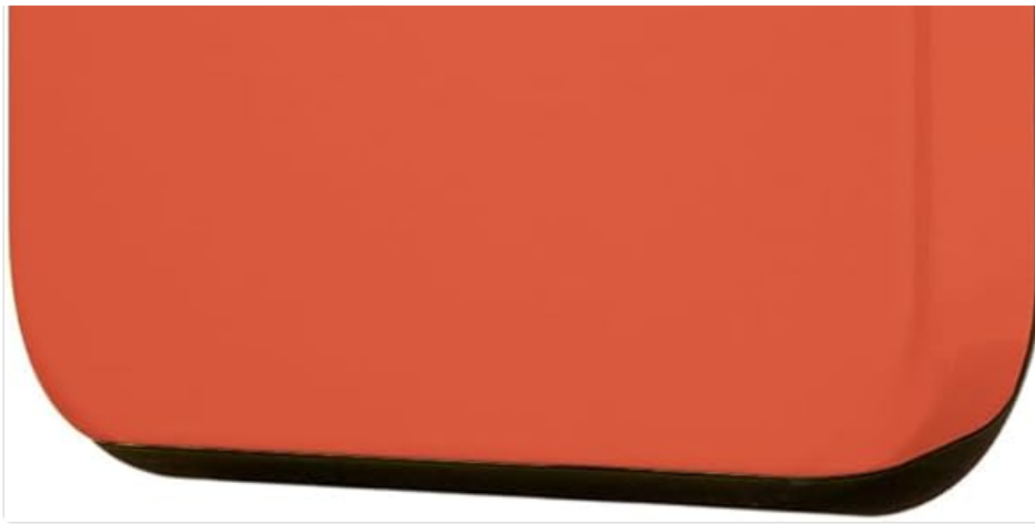
Image: Side view of the Poppy iPhone 14 Plus case. This view demonstrates the accessible cutouts for the volume buttons and the silent switch, ensuring full functionality.