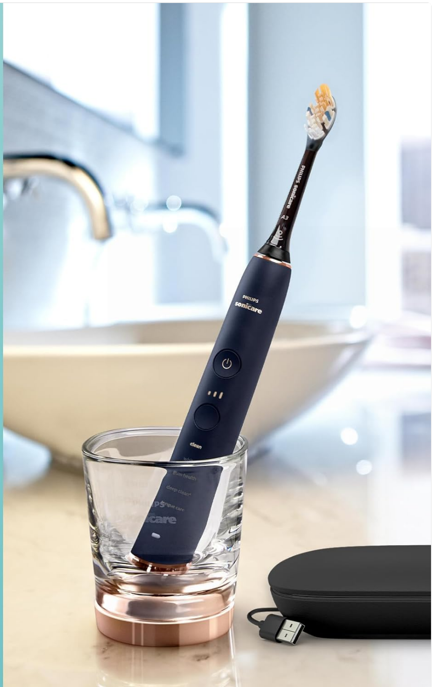
Image: The Philips Sonicare DiamondClean Smart 9700 toothbrush handle charging upright in its specialized glass, with the USB charging travel case positioned next to it, ready for travel.