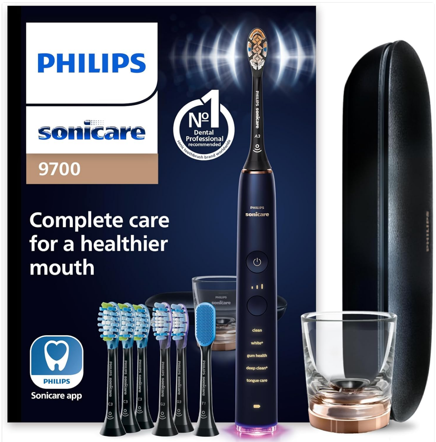
Image: The complete Philips Sonicare DiamondClean Smart 9700 package, showcasing the toothbrush handle, various brush heads, the elegant charging glass, and the convenient USB charging travel case.