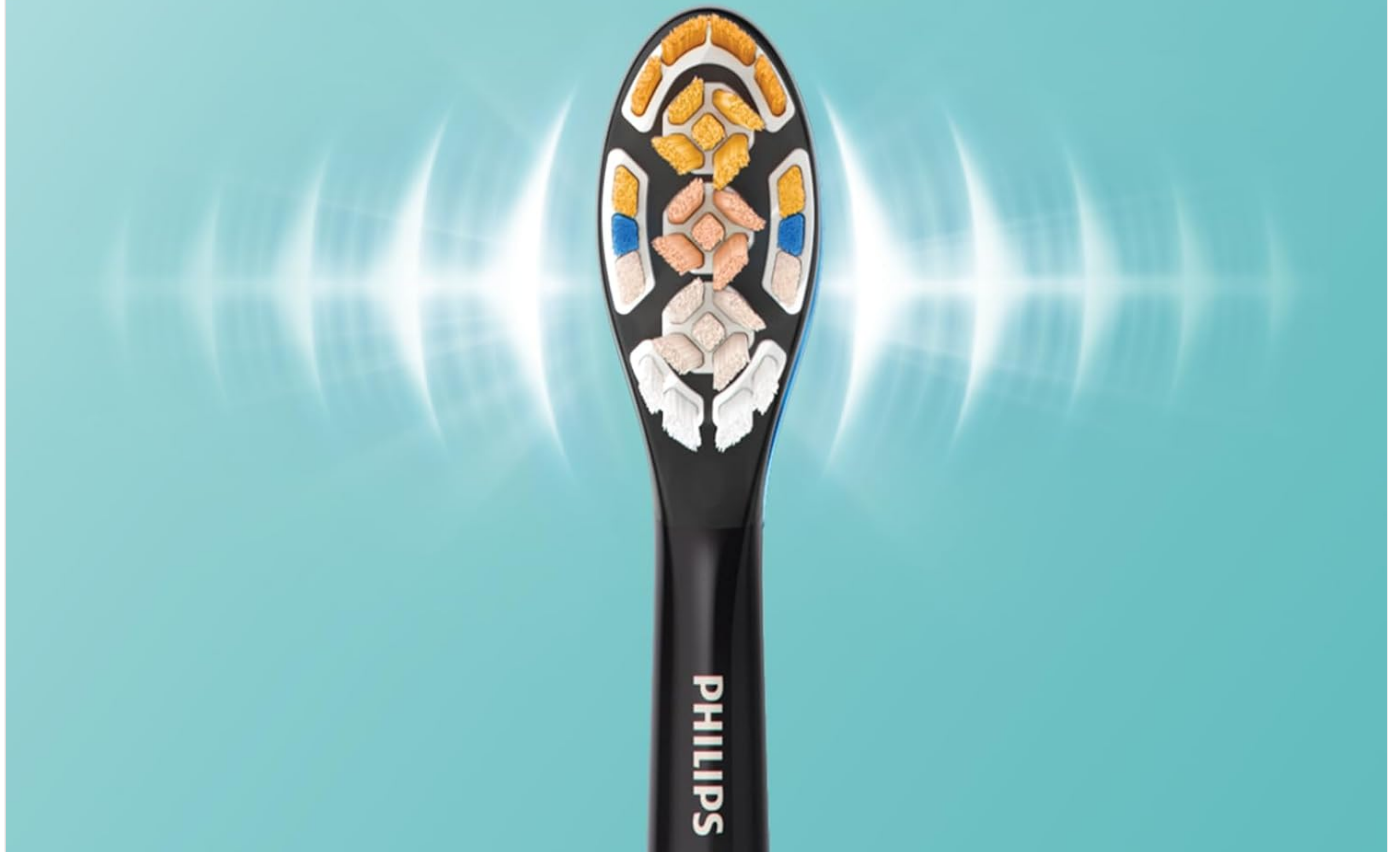
Image: A magnified view of a Philips Sonicare brush head, illustrating the intricate bristle design and the advanced sonic technology that generates powerful cleaning action.