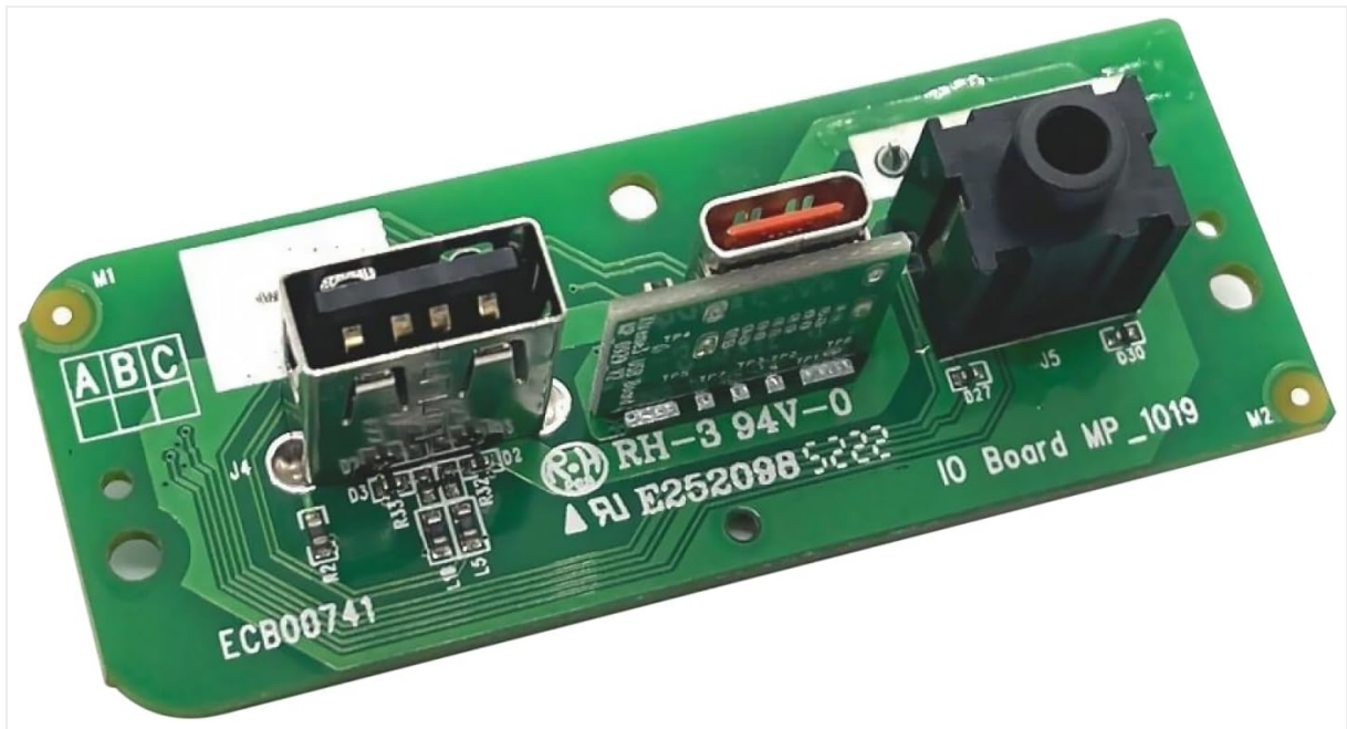
Figure 2: Included ZEZEUFU Charging Port Board.