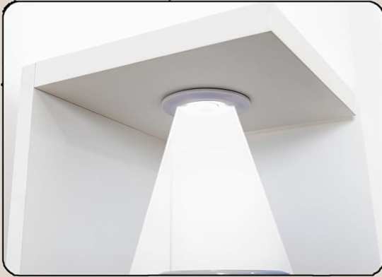
LED Lights with Remote Control