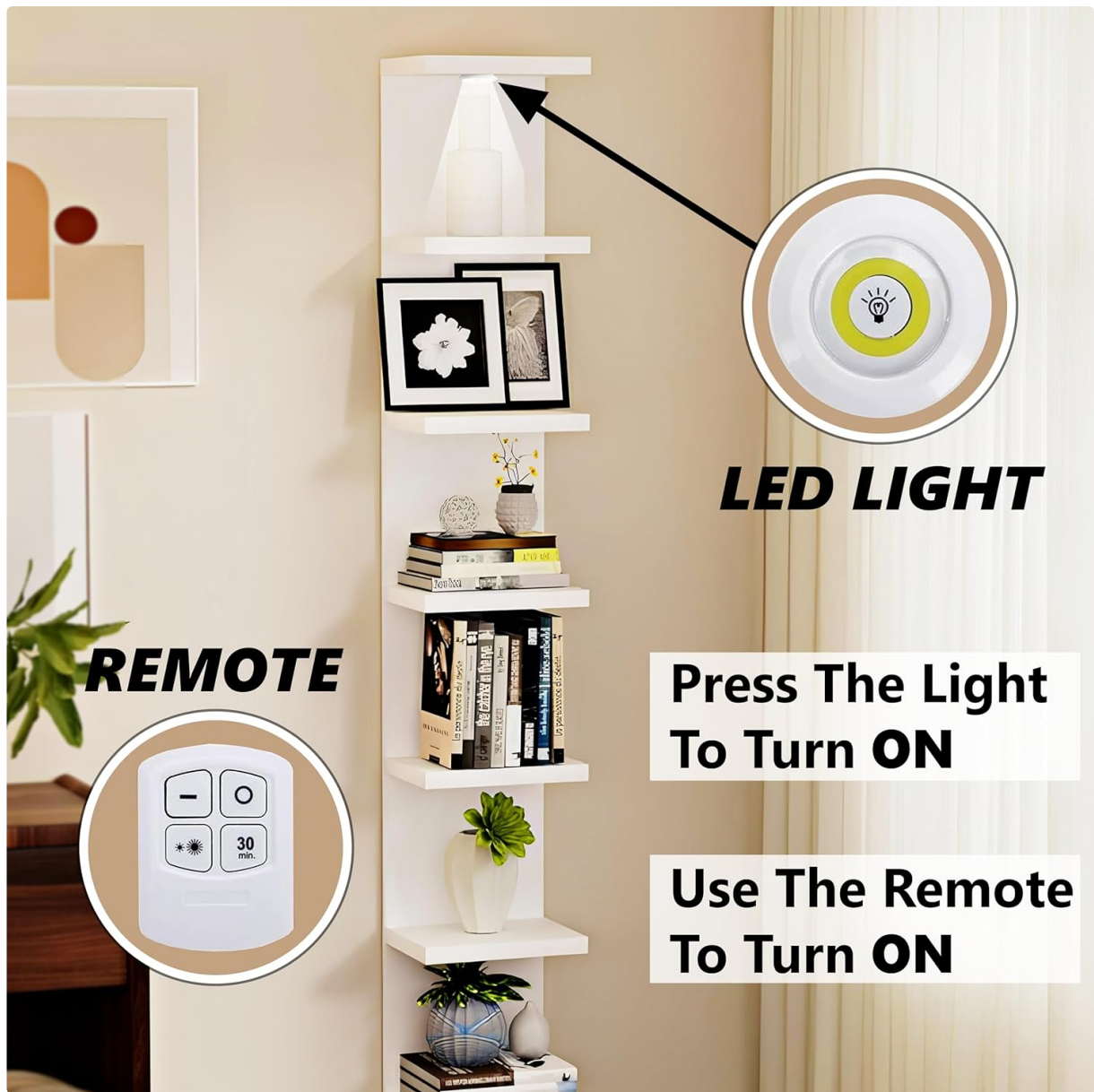
Image 5: Visual guide for the LED light and its remote control functions.