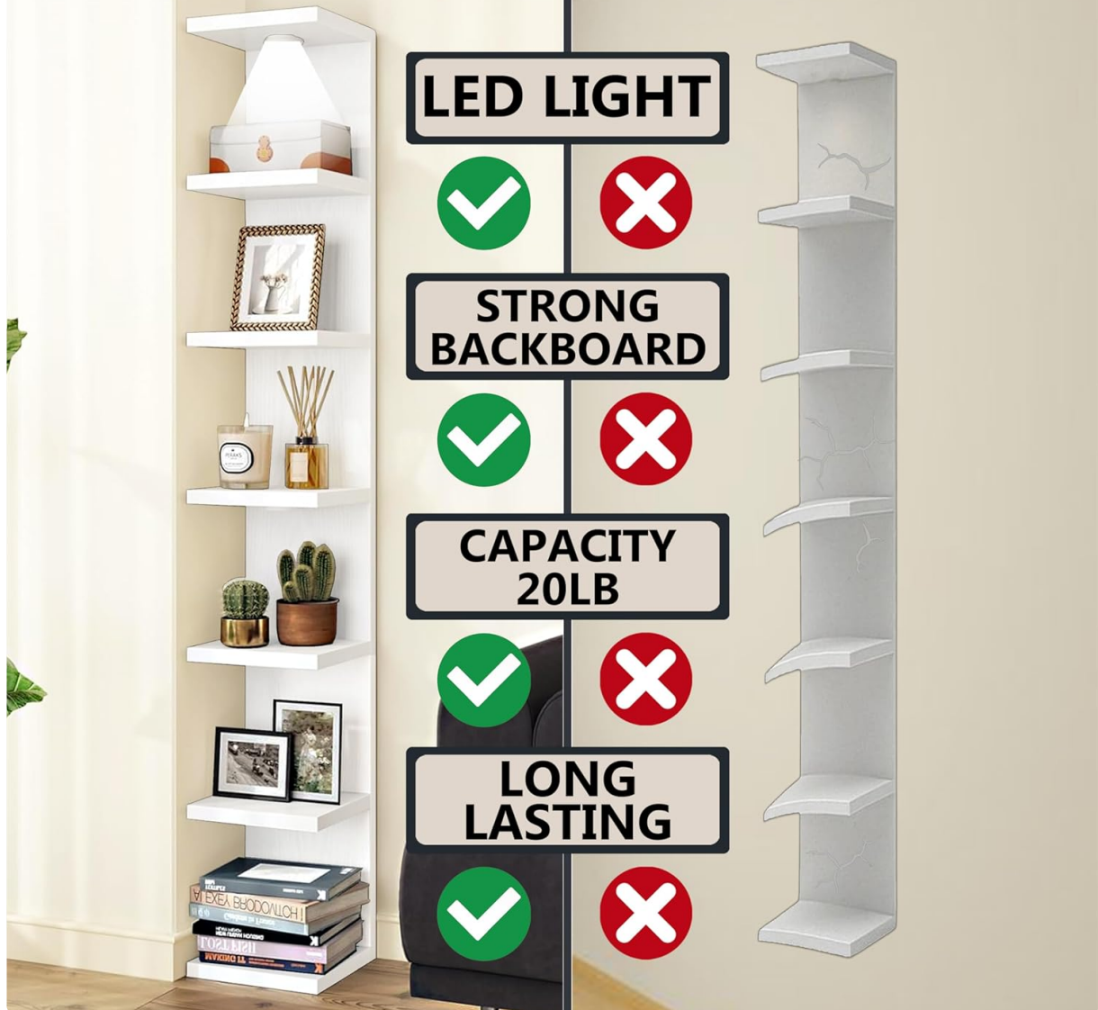
Image 2: Detailed view of key features including the LED light, robust backboard, and ease of maintenance.