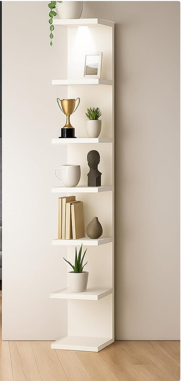
Image 3: Product dimensions and the strong backboard, crucial for stable assembly.