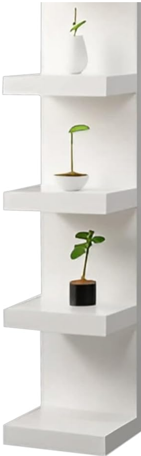
Image 1: The home stuff 7-Tier Wall Shelf Unit, showcasing its design and potential for display.