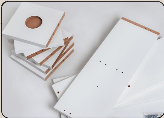
Upgraded Strong Backboard for Support