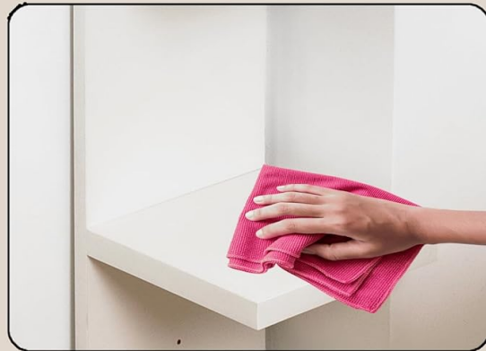
Easily Clean with Simple Wipe

Image 4: Illustration of the sturdy construction with a strong backboard and premium wood.