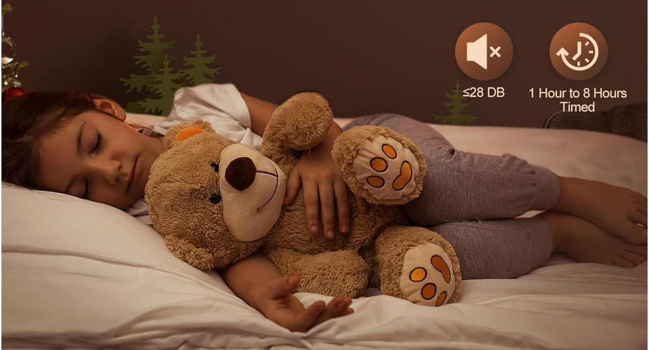
Image: A child sleeping peacefully in a bed with the electric fireplace in the background, illustrating its quiet operation. Icons indicate a low noise level ( \leq 28 dB) and a timer function (1 Hour to 8 Hours Timed).