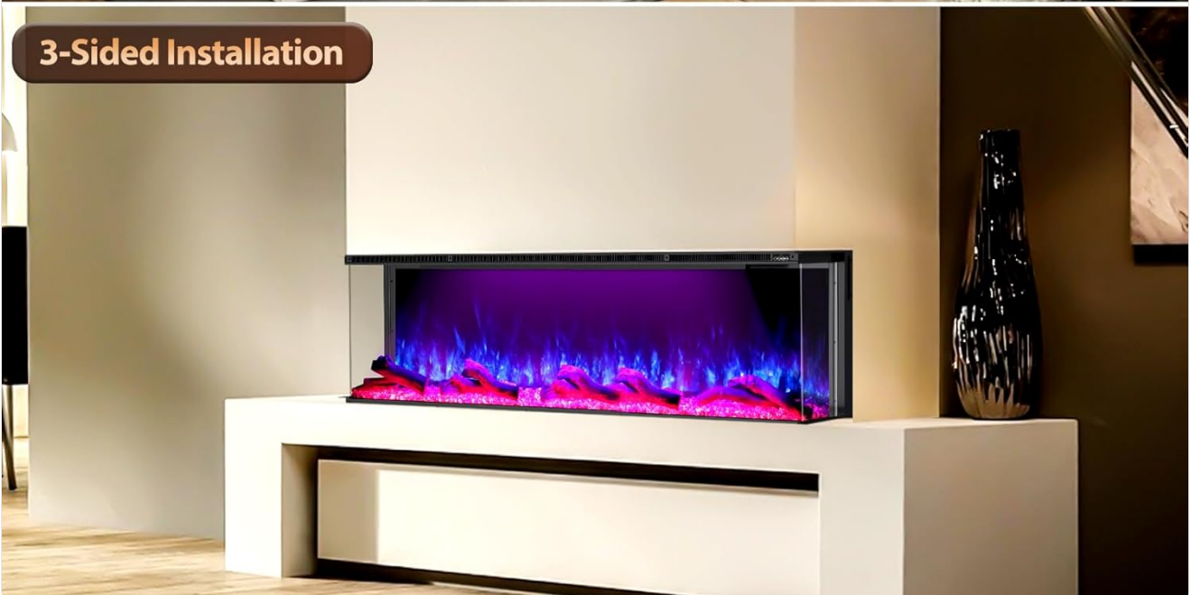
Image: Top panel shows a 2-sided installation where the fireplace is built into a wall, with the front and one side visible. Bottom panel shows a 3-sided installation, where the fireplace is placed on a low cabinet, allowing views from the front and both sides.