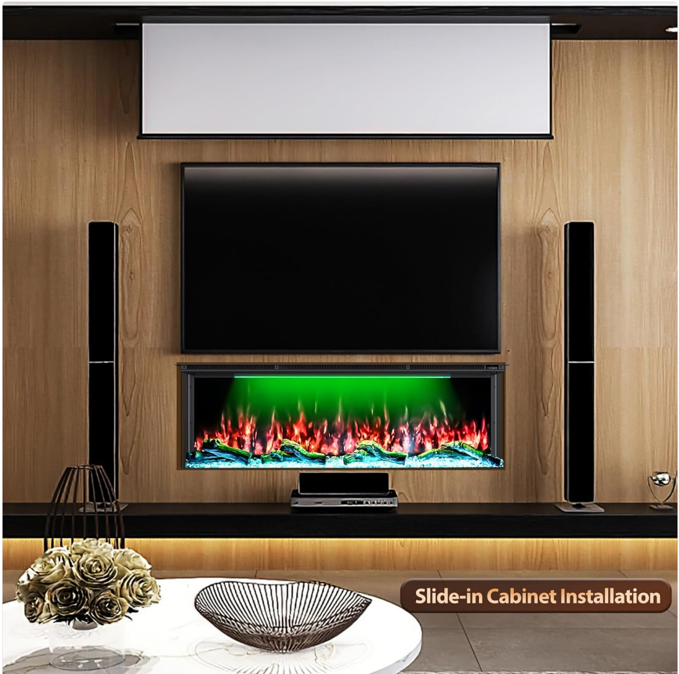
Image: The electric fireplace integrated into a modern wooden media cabinet, positioned below a television screen, demonstrating a slide-in cabinet installation.