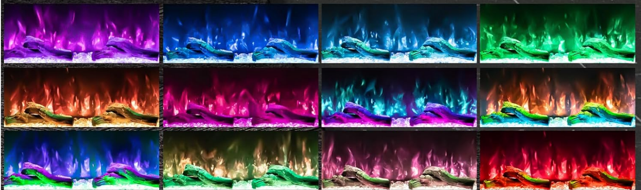
Image: A visual demonstration of the 251 RGB Log & Crystal Lighting Show. It illustrates how three groups of lights (flame, ember bed, downlight) can work together or be controlled separately to create various color combinations and effects.