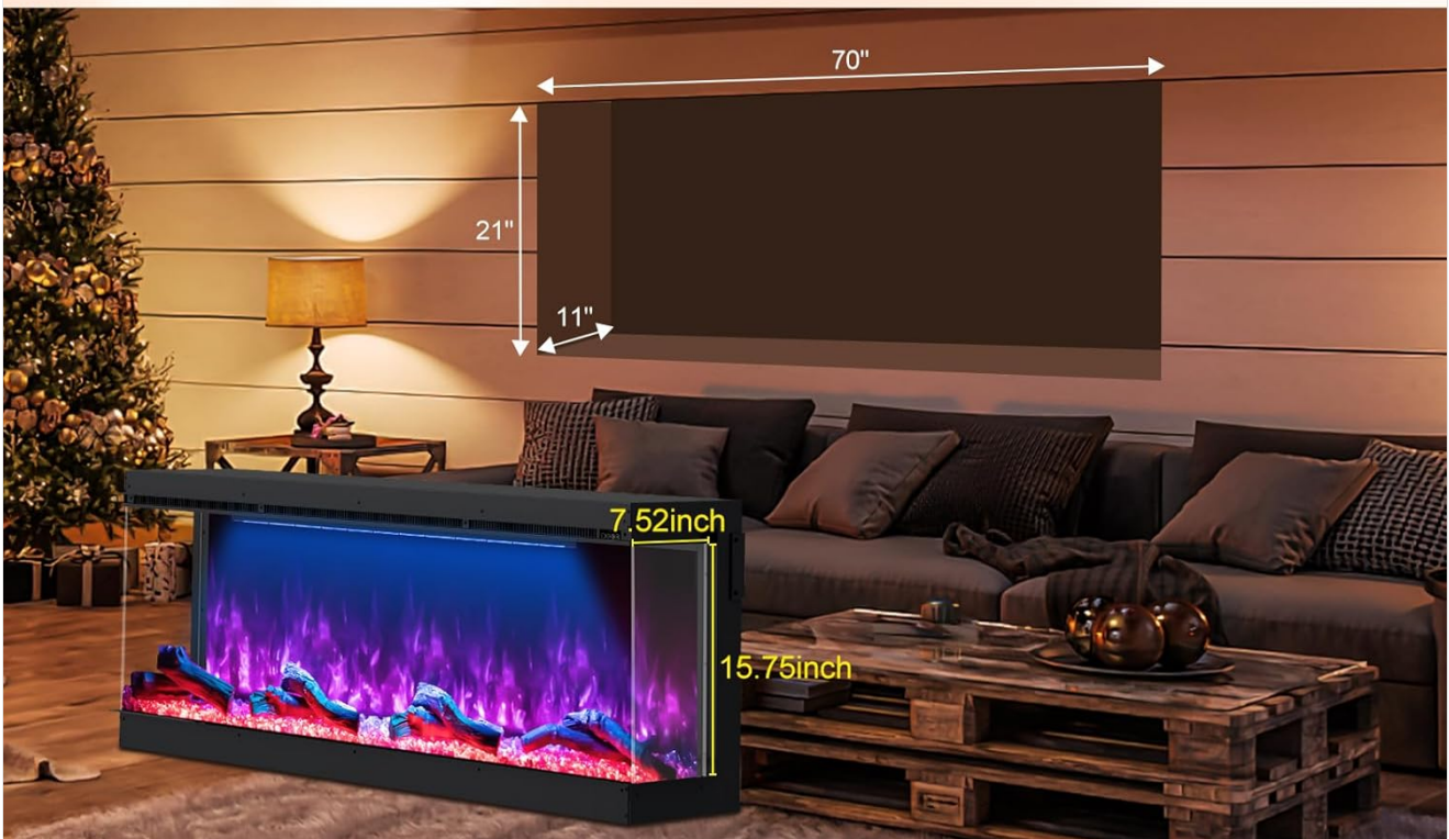
Image: A table detailing the dimensions (Width, Depth, Height) for various fireplace sizes, with the 70-inch model highlighted. Below the table, a diagram illustrates the 70-inch fireplace's dimensions and how it fits into a wall opening, shown in a living room setting.