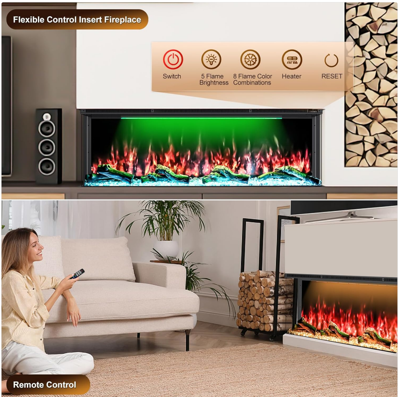
Image: Top panel shows a close-up of the fireplace's control panel with touch buttons for Switch, Flame Brightness, Flame Color Combinations, Heater, and Reset. Bottom panel shows a person using the remote control to adjust the fireplace settings from a sofa.