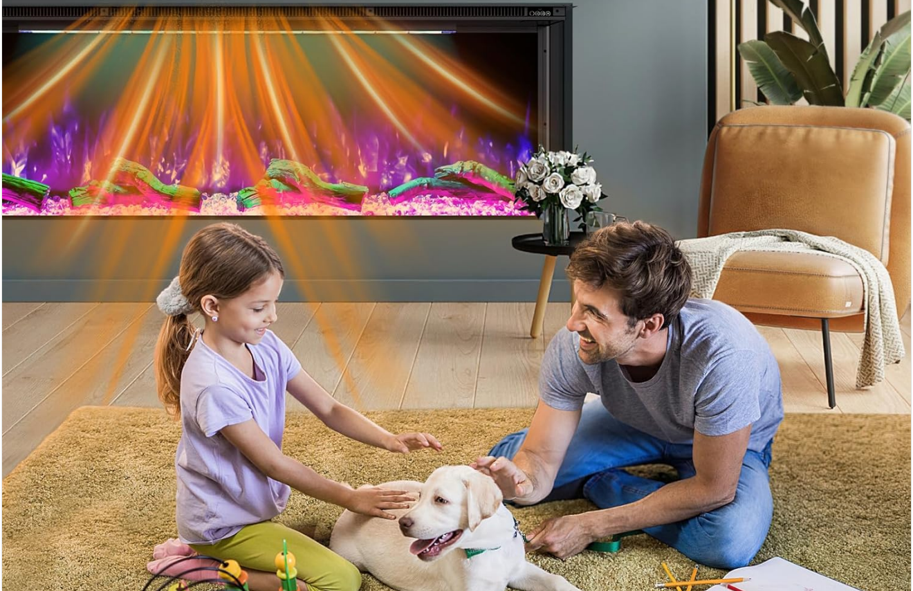
Image: A family enjoying a cozy living room with the electric fireplace providing warmth. An icon indicates a large heating range of up to 400 sq ft, with temperature control from 62°F to 82°F.