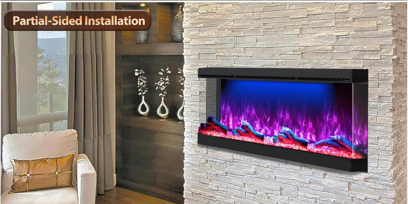
Image: Top panel shows a single-sided installation where the fireplace is fully recessed into a wall, with only the front visible. Bottom panel shows a partial-sided installation, where the fireplace is partially recessed into a stone wall, with the front and a portion of one side visible.