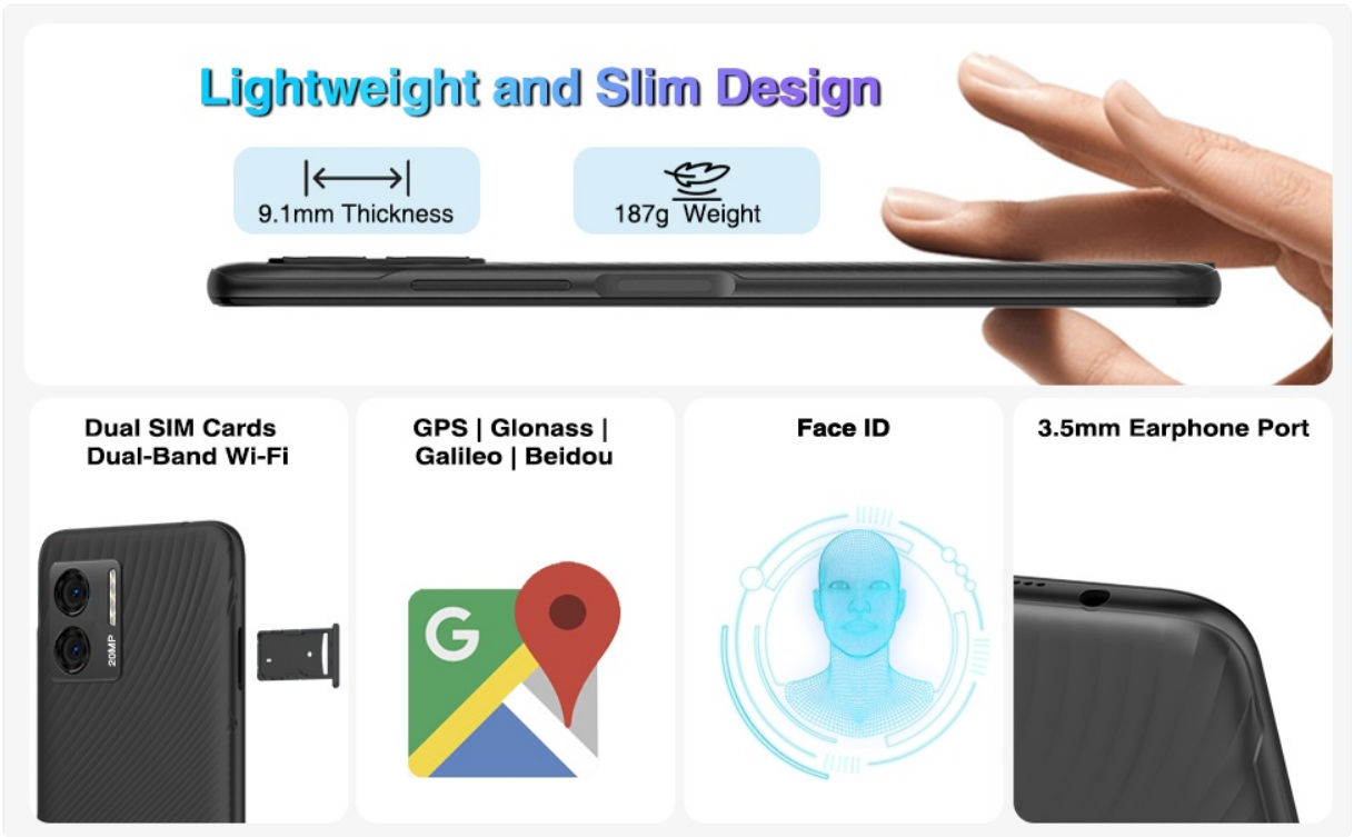
Figure 8: Connectivity and Features. This image displays various features including Widevine L1 support, 4G Dual SIM,

The DOOGEE N50S supports 4G cellular technology, dual-band Wi-Fi (2.4GHz & 5GHz), and GPS, GLONASS, BeiDou, and Galileo navigation systems. It also features Widevine L1 support for high-quality streaming and a 3.5mm earphone port for audio.