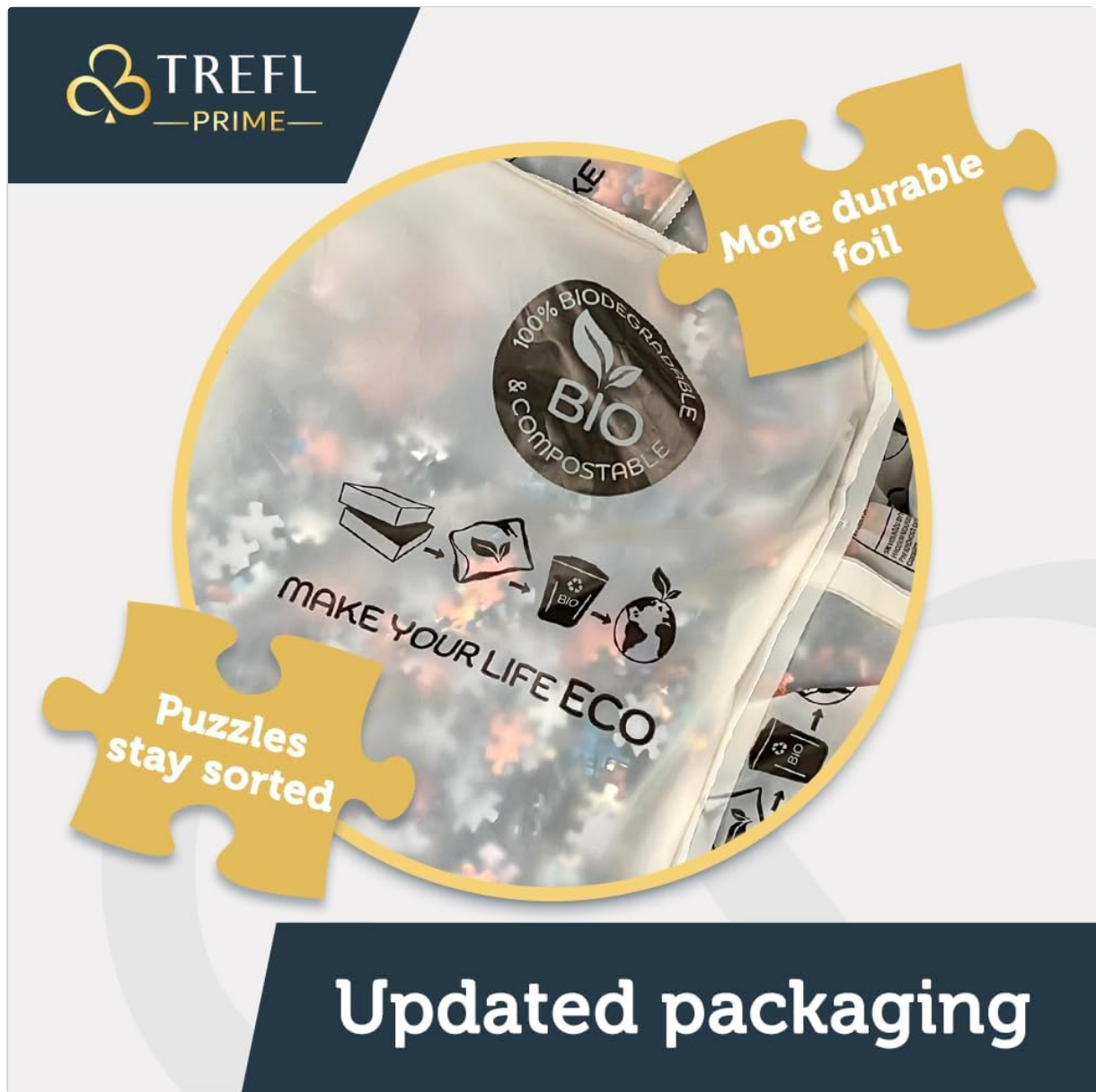
Image 2.2: The puzzle pieces are packaged in durable, biodegradable bags to keep them sorted.