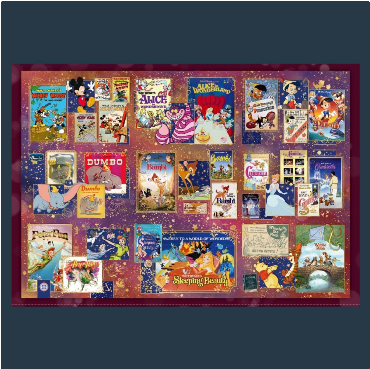
Image 1.2: The completed 13500-piece puzzle featuring a Disney Golden Age collage.