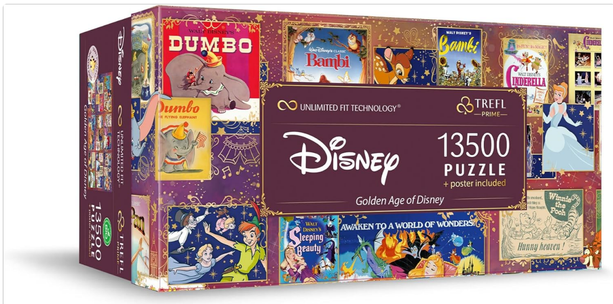
Image 1.1: The Trefl 13500 Piece Disney Golden Age Jigsaw Puzzle box.

This manual provides instructions for assembling and caring for your Trefl 13500 Piece Disney Golden Age Jigsaw Puzzle. This large-format puzzle features a collage of classic Disney movie posters, offering a challenging and rewarding experience for puzzle enthusiasts. The puzzle is manufactured with Unlimited Fit Technology and Trefl Prime quality, utilizing thick cardboard and FSC certified materials.