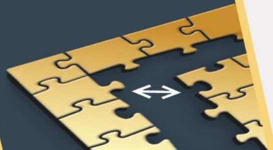
Image 2.1: Visual representation of the puzzle's dimensions and included aids.