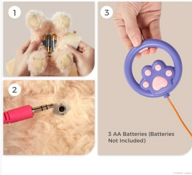
Image: Visual guide for battery installation and leash connection.