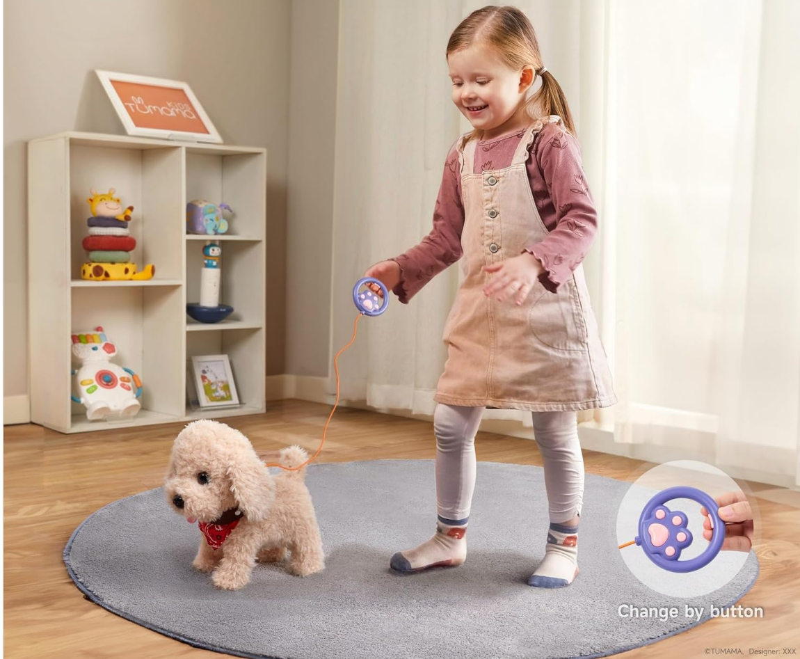
Image: A child demonstrating control of the walking puppy using the leash.