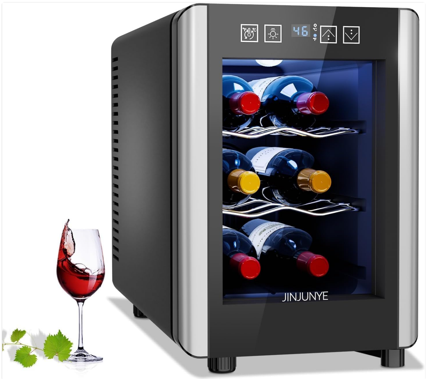
Image: The JINJUNYE 6 Bottle Wine Cooler, a compact black unit with a glass door displaying six wine bottles on wavy chrome shelves. A wine glass with red wine is placed next to it.