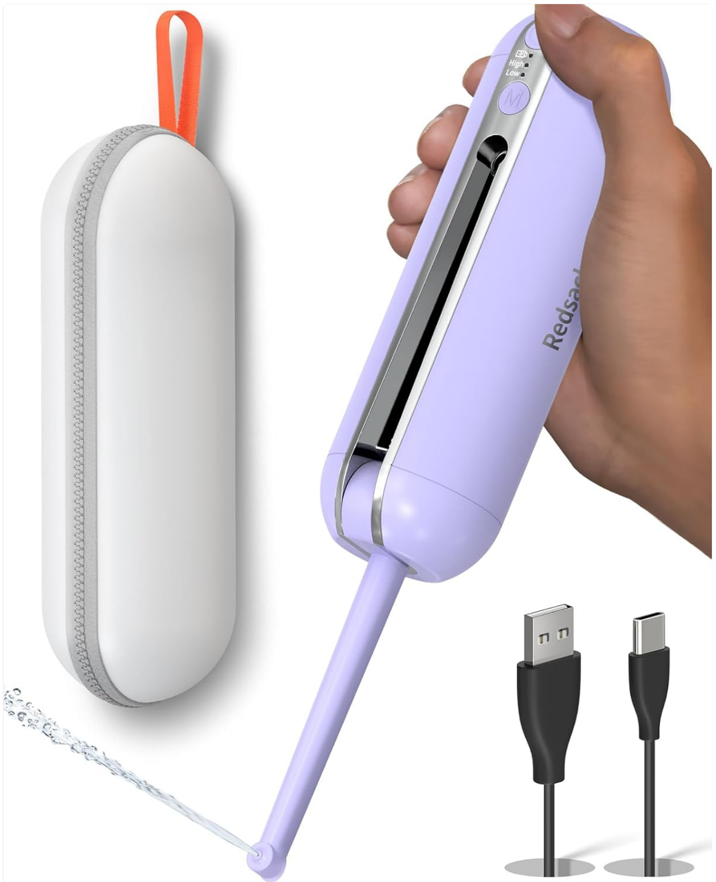
Figure 1: RedSack Electric Portable Bidet, showing the device, its protective carrying case, and the USB-C charging cable.