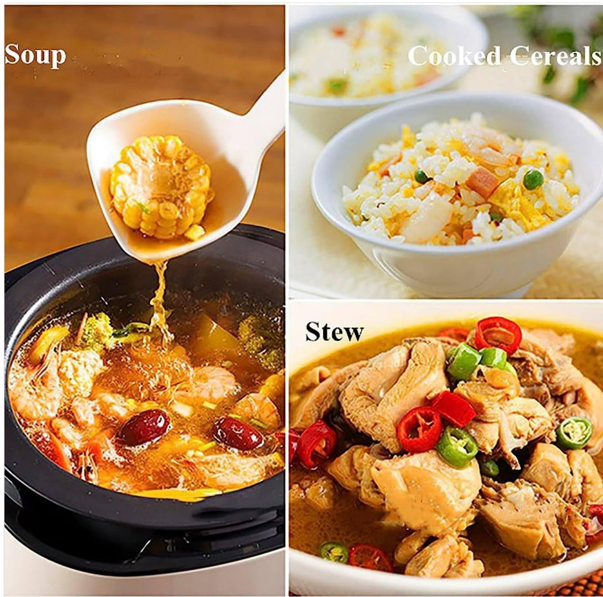
Figure 5.6: Examples of various dishes such as soup, cooked cereals, and stew that can be prepared with the automatic cooking machine.