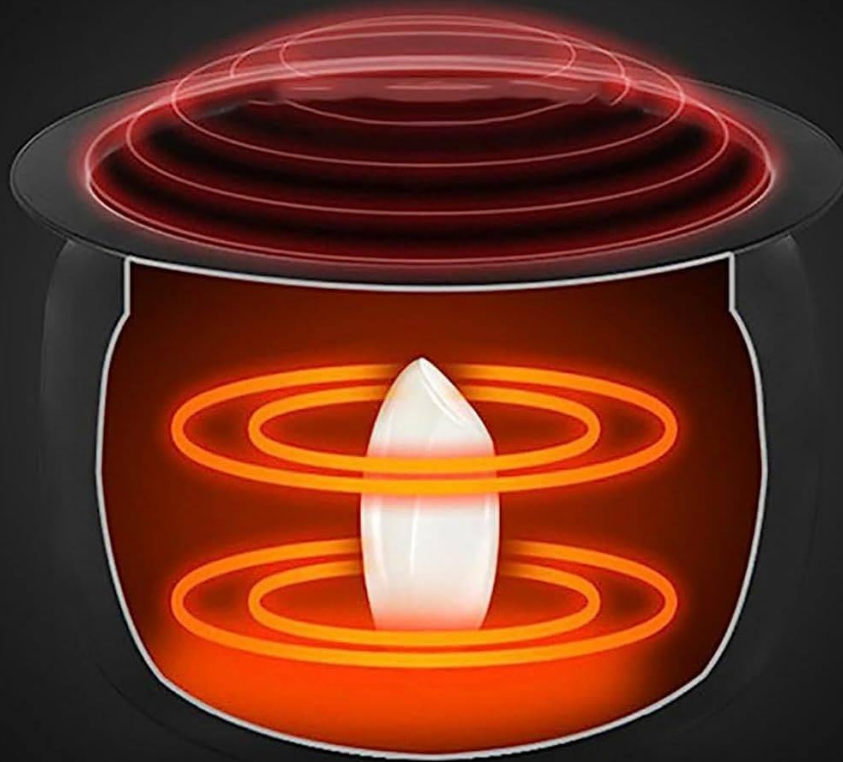
Figure 5.4: Visual representation of the IH electromagnetic heating technology, showing how heat is distributed evenly.