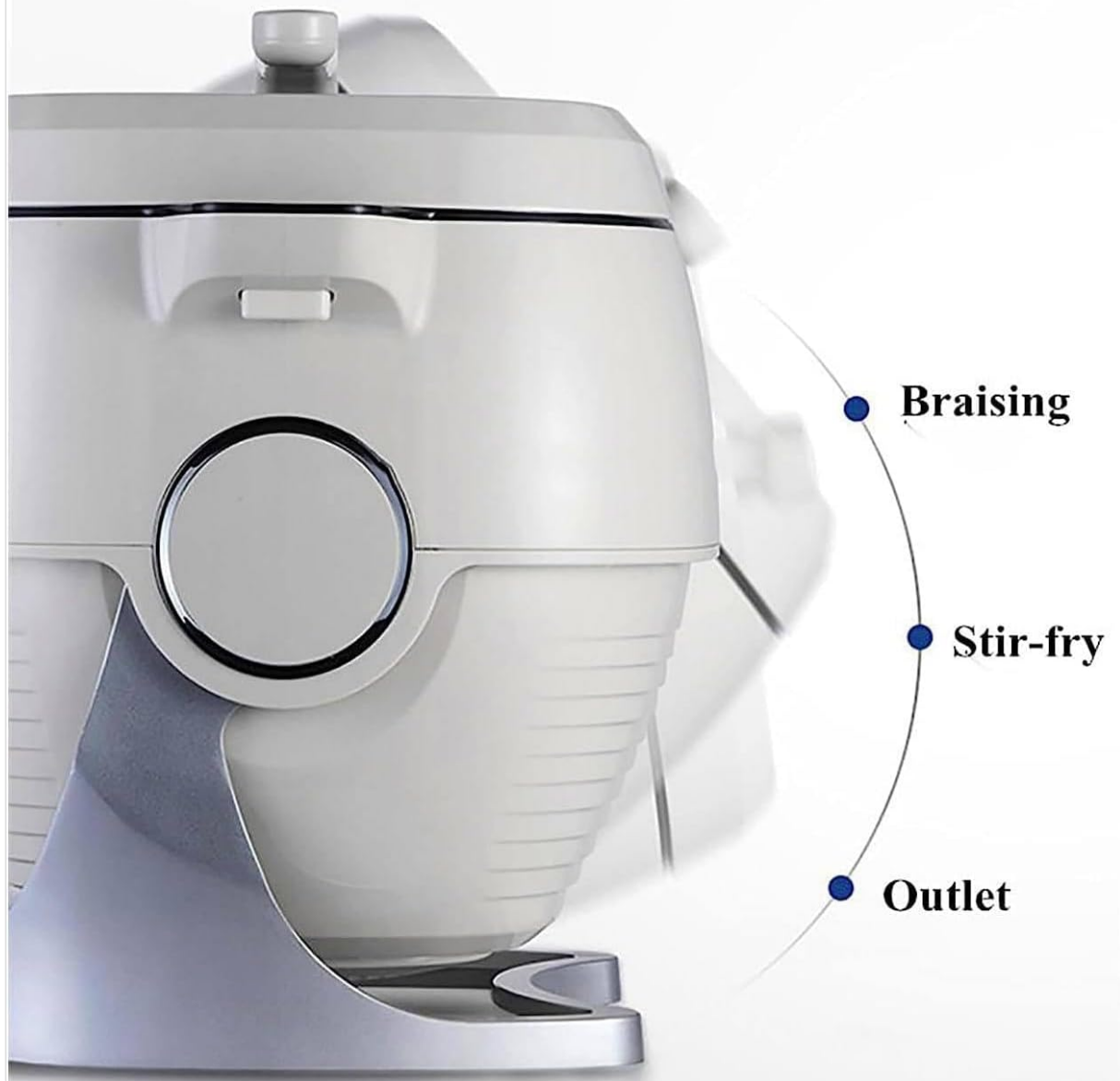
Figure 5.3: Illustration of the adjustable gear mechanism, indicating settings for braising, stir-frying, and pouring.