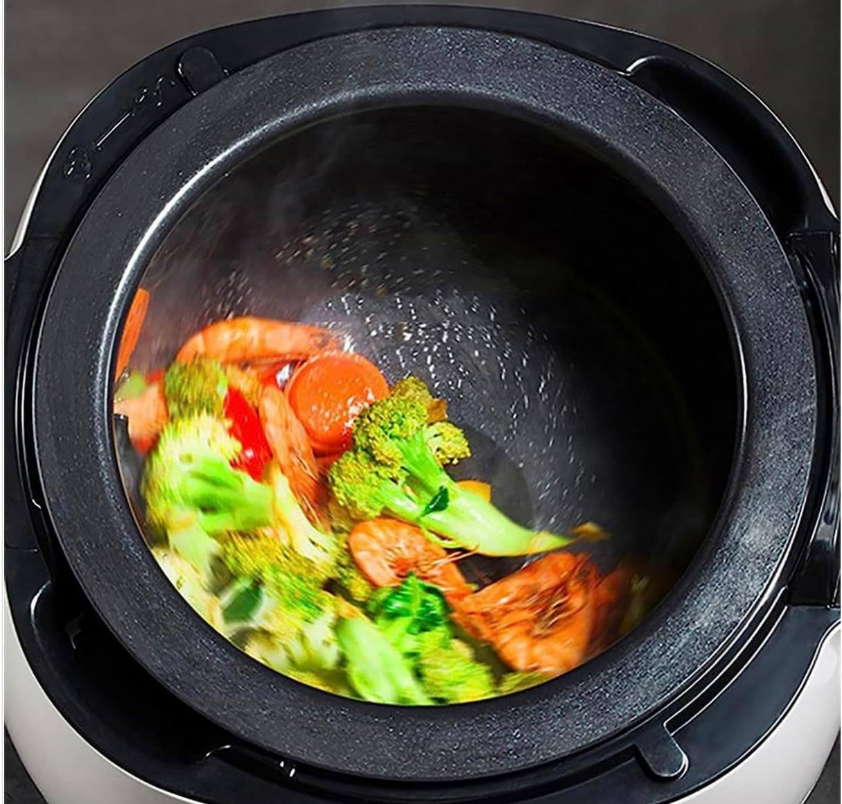
Figure 5.2: The internal view of the cooking pot demonstrating the automatic rotation for even cooking.