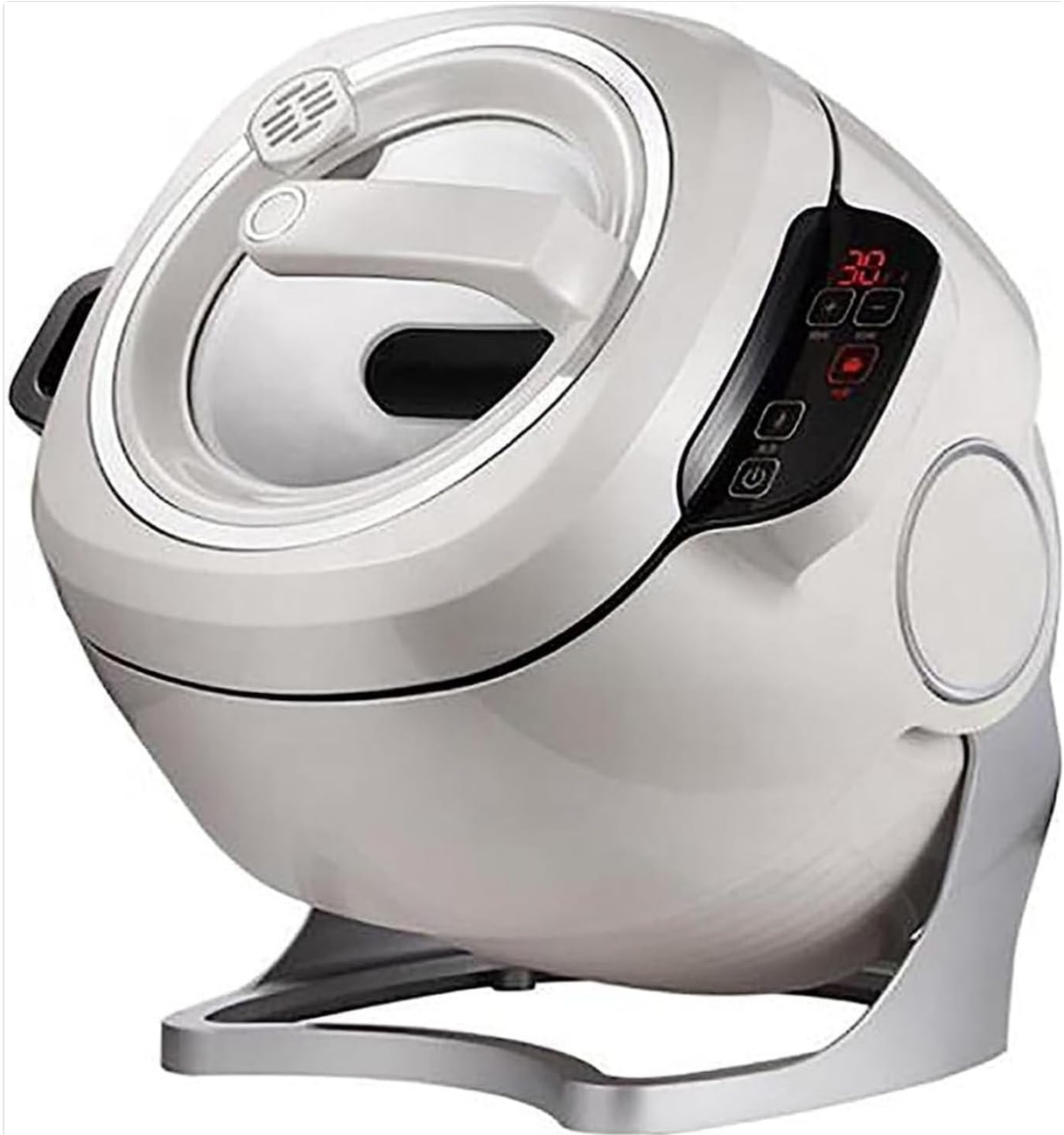
Figure 2.1: The RESKIU Automatic Cooking Machine, showcasing its compact design and integrated control panel.