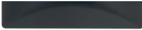
Figure 3: Rear view of the remote control with the battery compartment open, showing the slots for two AAA batteries. This image helps in correctly installing the batteries.