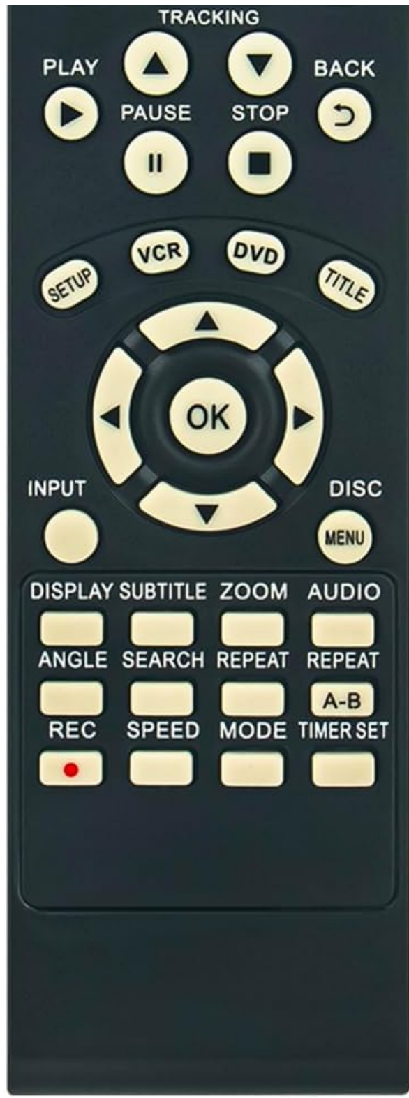
Figure 1: Front view of the VINABTY replacement remote control. This image displays the full layout of buttons, including power, number keys, playback controls, and function-specific buttons for DVD and VCR operations.