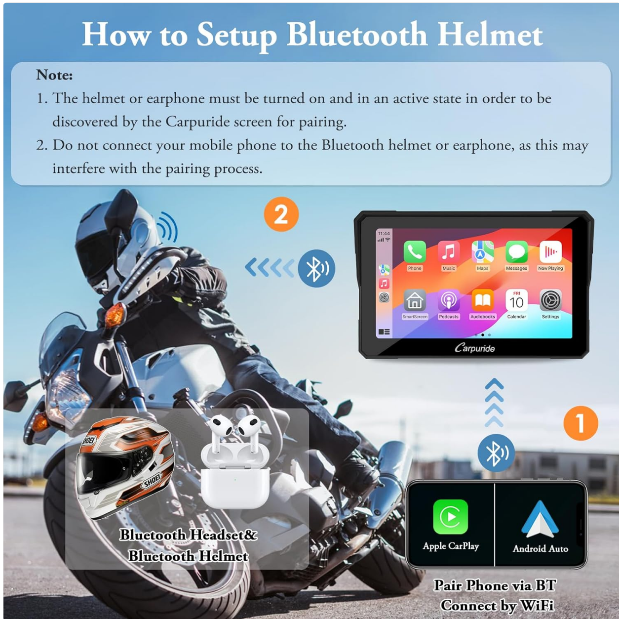
Figure 6.3: Diagram illustrating the process of connecting a Bluetooth helmet or headset to the Carpuride W702.