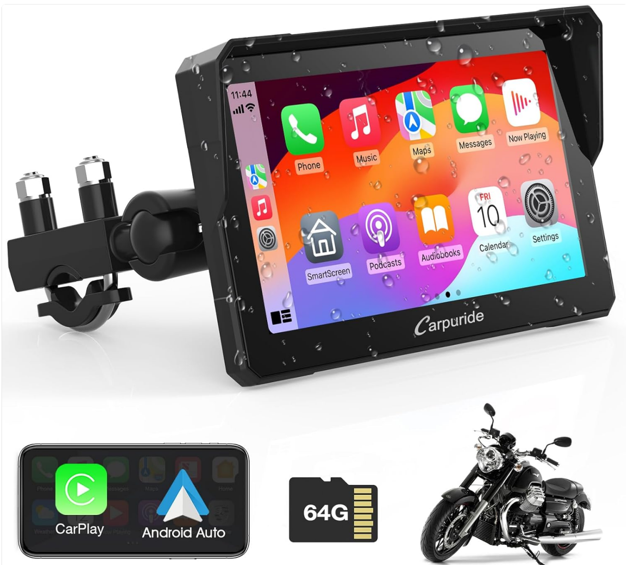
Figure 4.1: Front view of the Carpuride W702 unit, showcasing its 7-inch touchscreen and robust design.