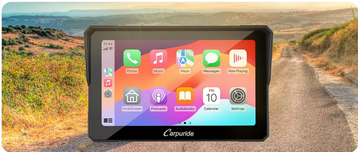
Sunny Days, High temperature, Sunscreen