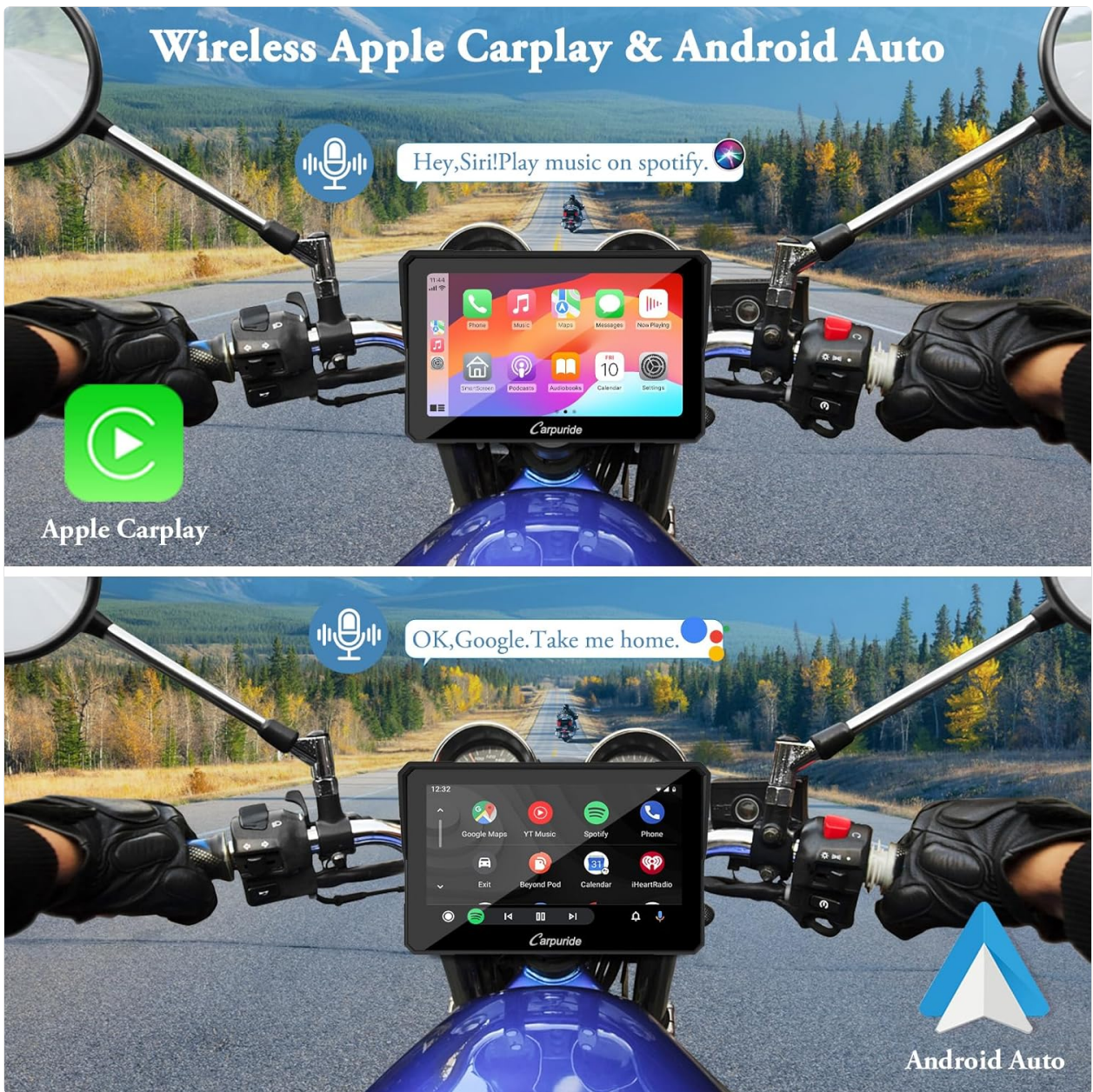
Figure 6.1: Display showing the user interface for both Apple CarPlay and Android Auto on the Carpuride W702.