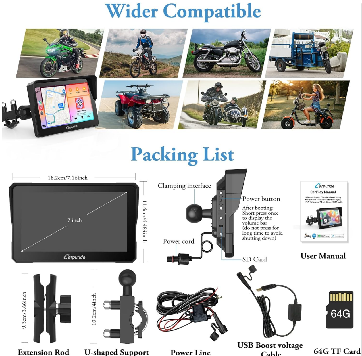
Figure 3.1: Contents of the Carpuride W702 package, including the main unit, various cables, mounting hardware, and user manual.