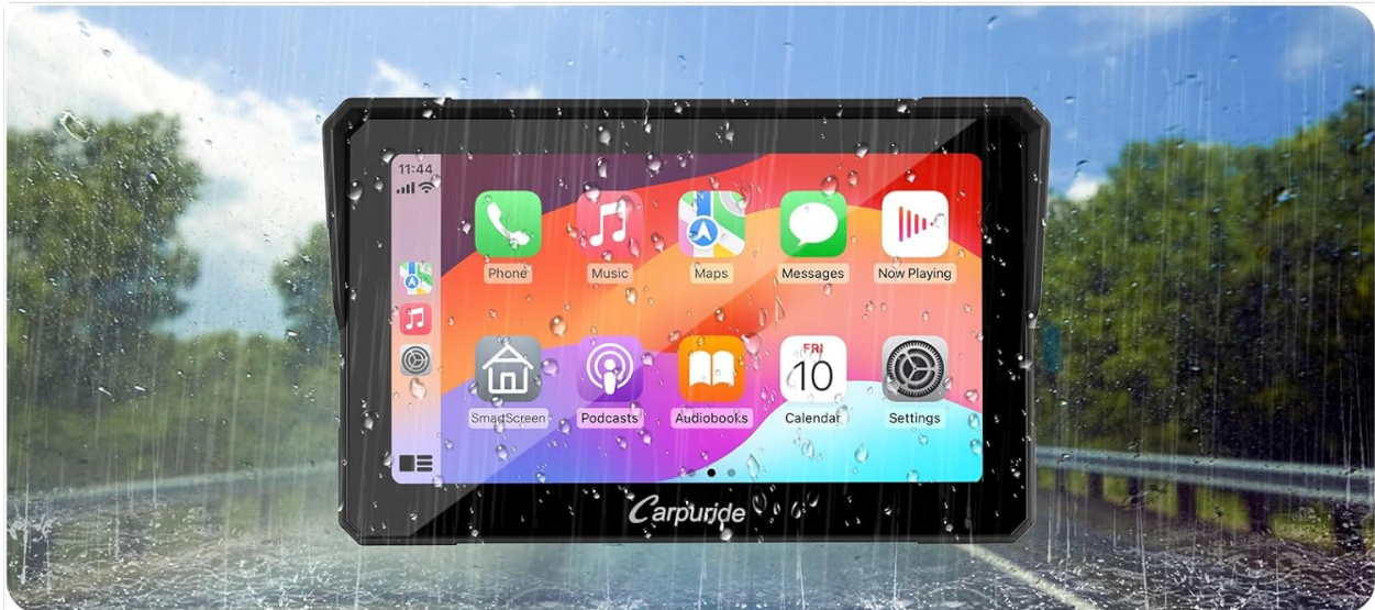
Waterproof for Riding in Rainy Days