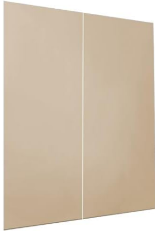
Sidewall with Zipper x2