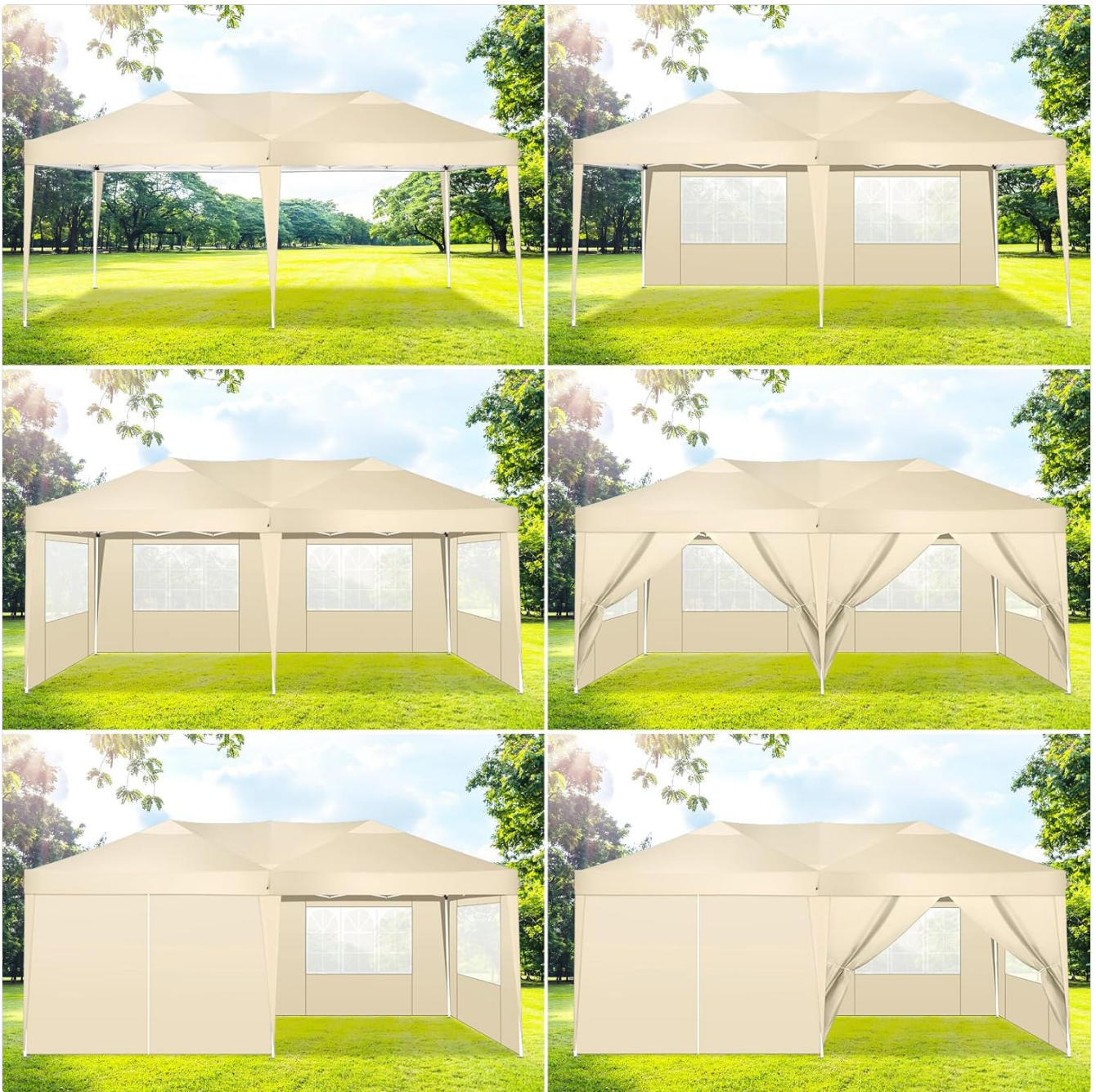
Figure 5: Examples of various sidewall configurations for different event needs.