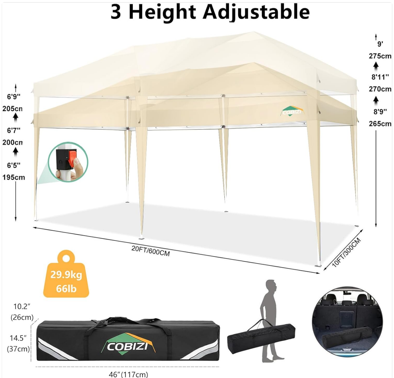
Figure 4: Illustration of the 3 adjustable height settings for the canopy tent.