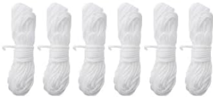
6 x Ropes