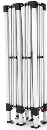
Canopy Frame x1