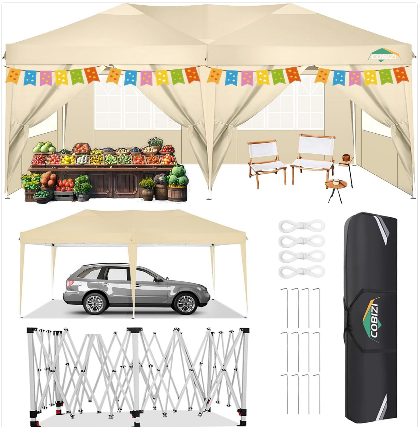
Figure 1: COBIZI 10x20 Pop Up Canopy Tent with included components and various setup examples.