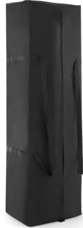
Carry Bag x1