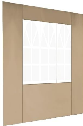
Sidewall with PVC Window x2