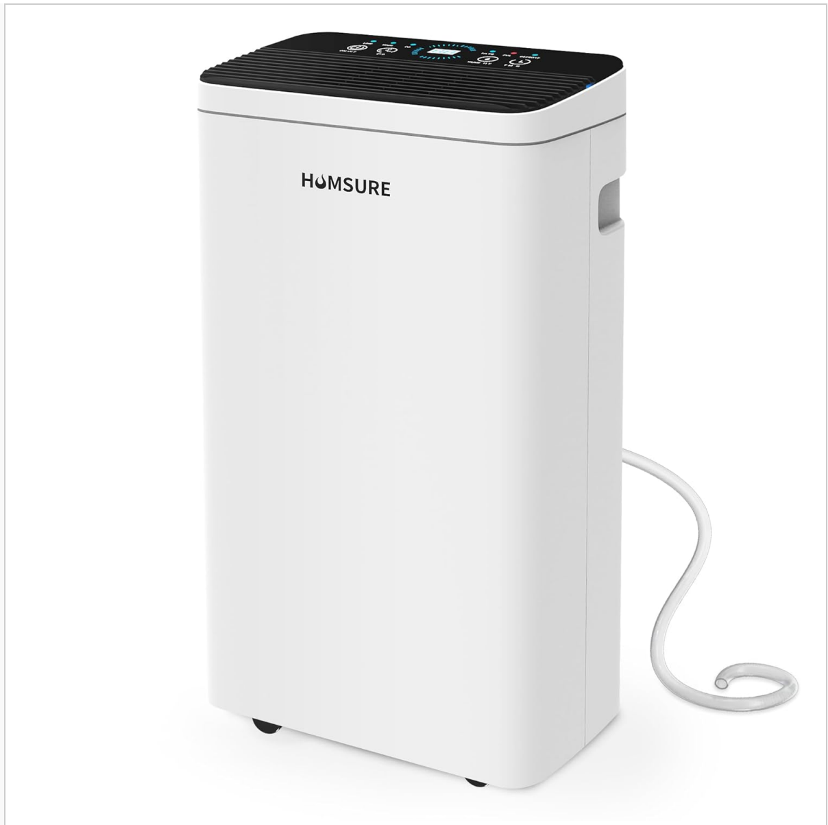
Figure 1.1: Humsure 30 Pint Dehumidifier

This image shows the Humsure 30 Pint Dehumidifier in a white finish, with its control panel visible on top and a drainage hose connected to the side, extending to the floor.