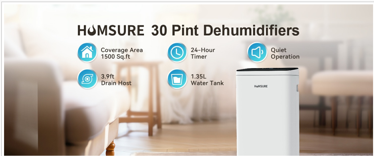
Figure 3.1: Overview of Key Features

This image highlights the main features of the dehumidifier, including its coverage area, timer function, quiet operation, drain hose length, and water tank capacity.