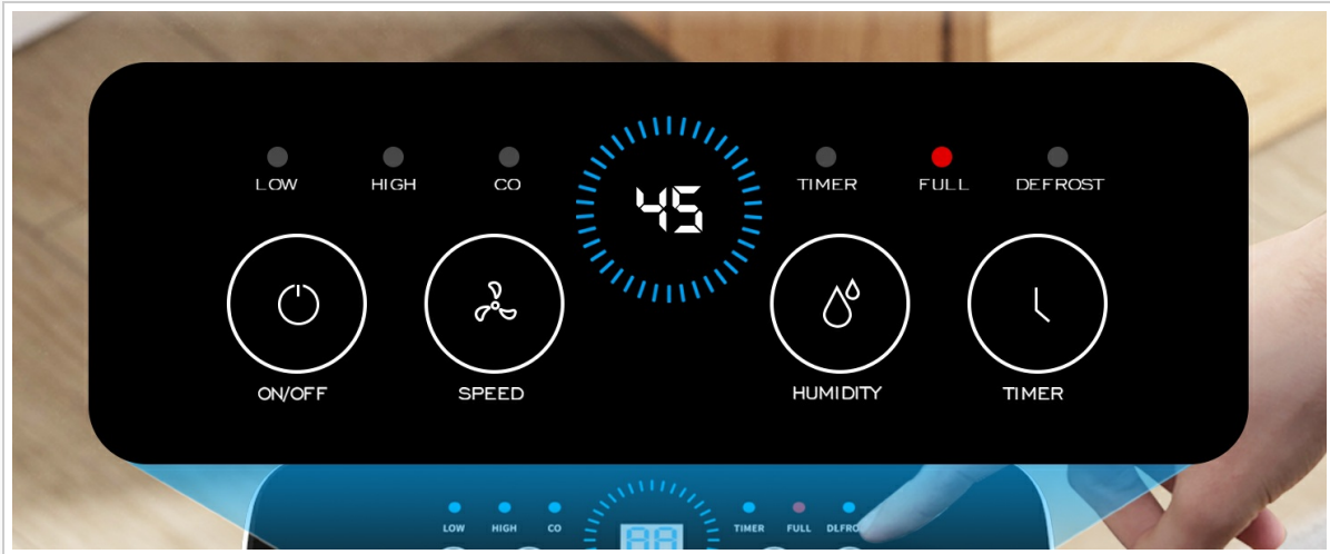
Figure 5.2: Silent Dehumidification

This image emphasizes the dehumidifier's quiet operation, particularly in sleep mode (below 45dB), making it suitable for use in bedrooms without disturbing rest.