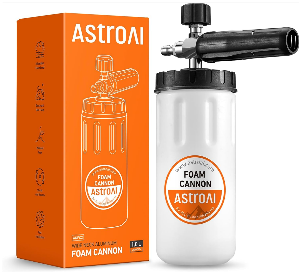
Image: The AstroAI Wide Neck Foam Cannon, showing the product and its retail packaging.