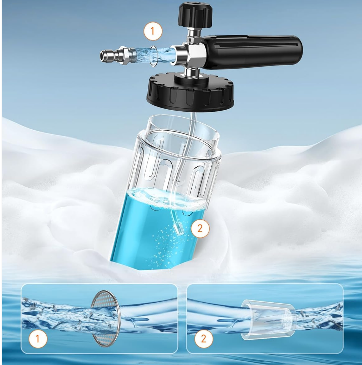
Image: Internal view of the foam cannon's double filtration system, designed to prevent impurities.