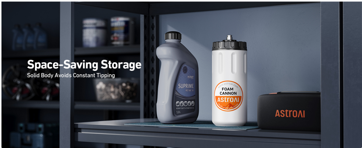
Image: The foam cannon stored upright on a shelf, demonstrating space-saving storage.