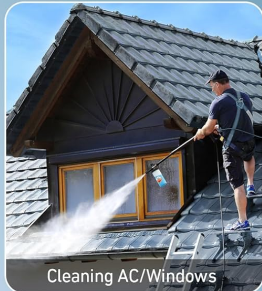
Image: Examples of the foam cannon's versatility, including car washing, yard watering (with appropriate nozzle), and cleaning exterior surfaces.