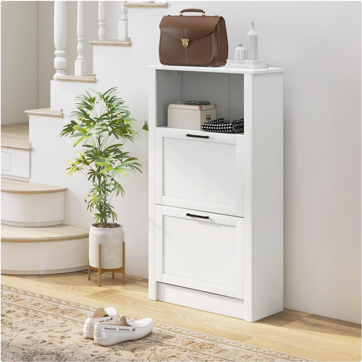
Image: The HOMCOM Shoe Cabinet positioned in an entryway, demonstrating its compact design and integration into a home environment. It features an open top shelf and two lower flip-down compartments.