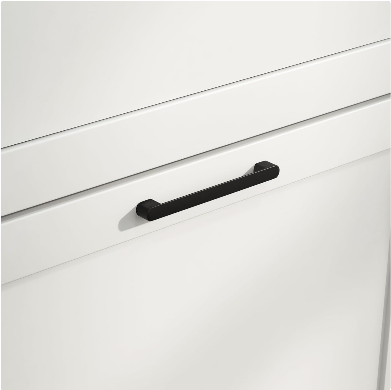
Image: A close-up view of the black metal handle on one of the flip drawers, showing its design and attachment point.

depth (9.4"), along with internal measurements for the flip drawers.