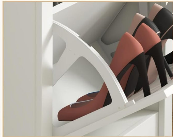
Image: A visual representation showing how the interior adjustable divider can be removed to accommodate taller items like ankle boots or high heels, illustrating the cabinet's versatility.