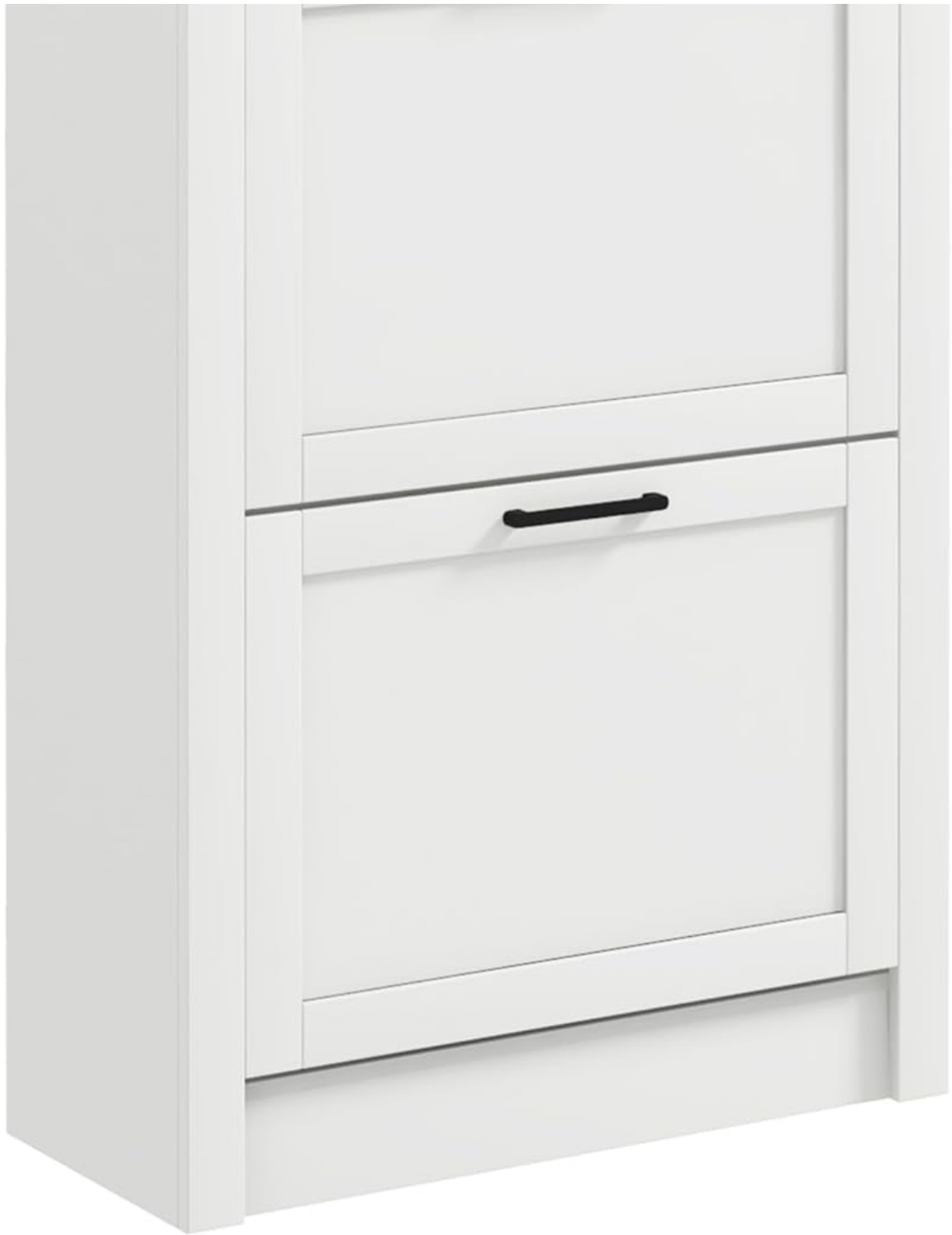
Image: A direct front view of the HOMCOM Shoe Cabinet, highlighting its clean white finish and black handles on the flip drawers. The open top compartment is visible.