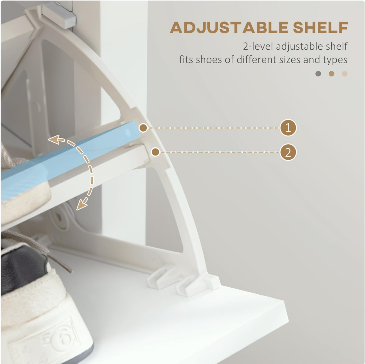
Image: A close-up view demonstrating the adjustable shelf feature within a flip drawer. The image shows how the shelf can be moved to different height levels to accommodate various shoe sizes.