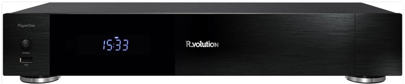
Figure 1: Front view of the R-Volution Player ONE 8k. This image displays the sleek black design of the media player, featuring a power button on the left, a front USB port, and a central digital display showing the time.