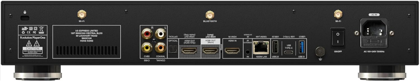
Figure 2: Rear panel connections of the R-Volution Player ONE 8k. This image shows the comprehensive array of ports on the back of the device, including HDMI outputs, USB ports, Ethernet, optical, coaxial, and analog audio outputs, along with Wi-Fi and Bluetooth antennas.