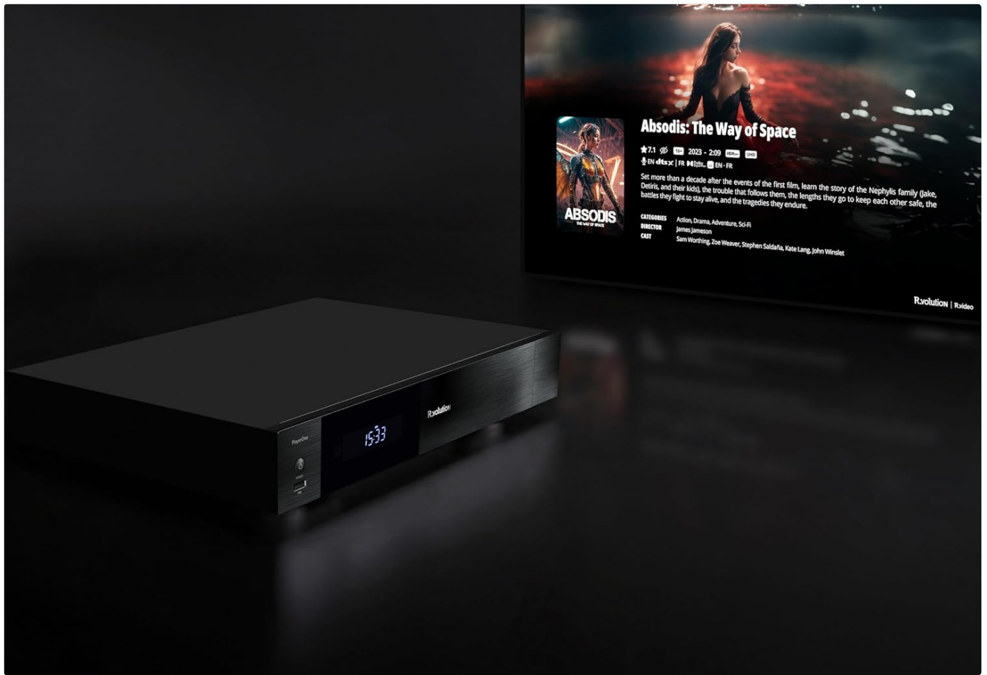
Figure 4: R.video user interface in action. This image illustrates the Player ONE 8k connected to a display, showcasing the R.video media management system with movie details, cover art, and playback options.

The Player ONE 8k features an intuitive interface for managing and playing your media content. The R.video application provides a rich visual experience for your movie and TV show collection.