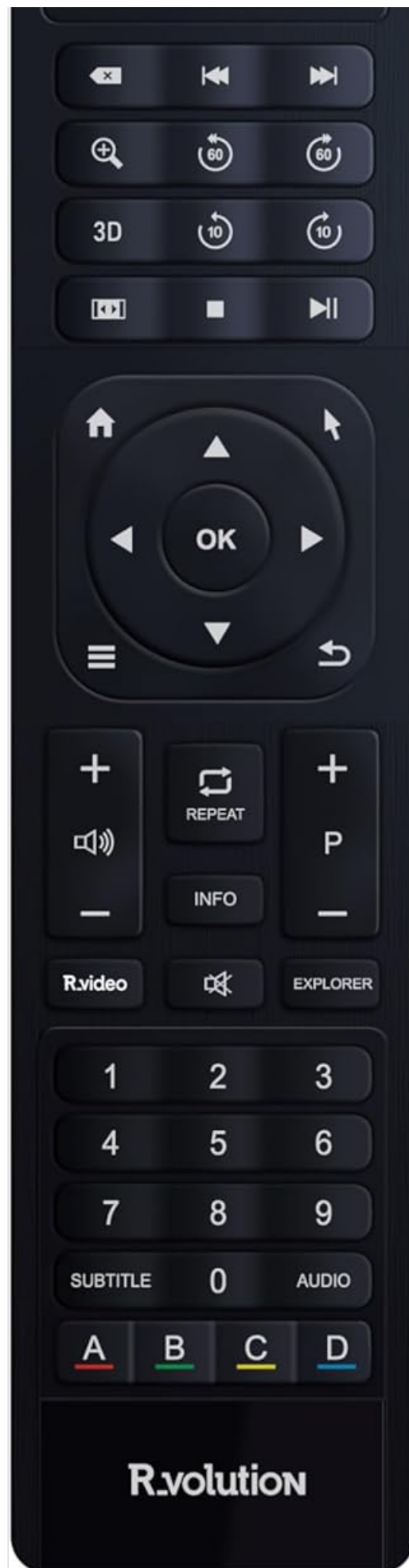
Figure 3: Remote control for the R-Volution Player ONE 8k. This image displays the ergonomic design of the remote, with clearly labeled buttons for power, volume, navigation, media playback controls, and dedicated R.video and Explorer buttons.