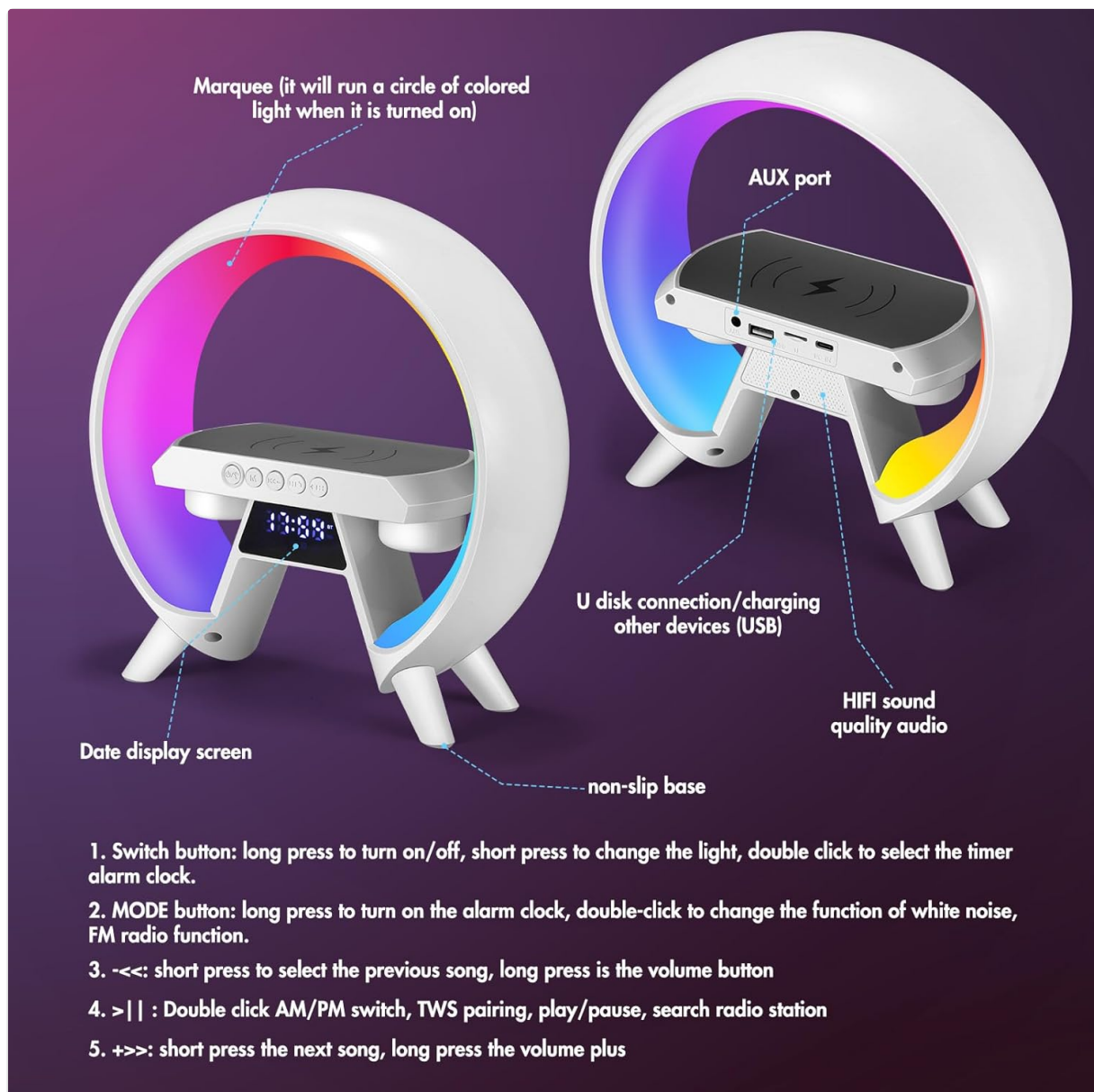
Figure 2.1: Front and rear view of the HM-G6 lamp with labeled controls and ports.