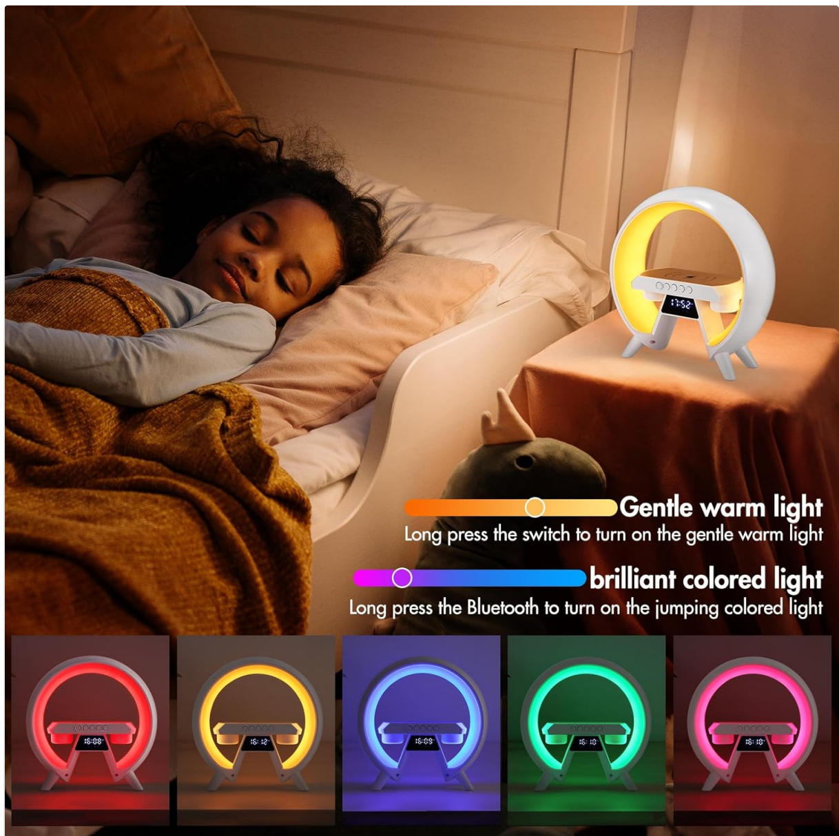
Figure 4.1: Gentle warm light and brilliant colored light modes.