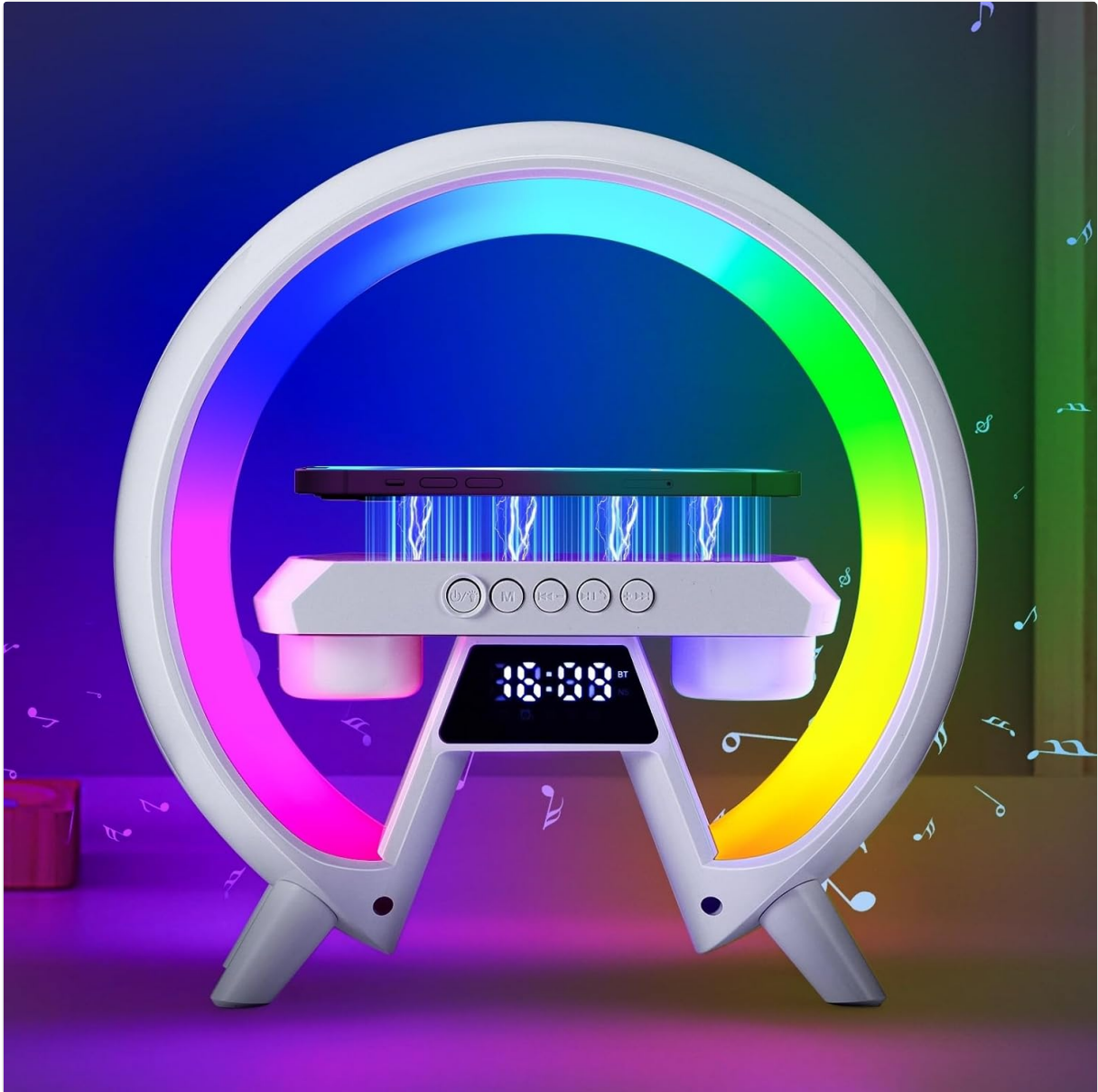
Figure 3.1: HM-G6 Atmosphere Lamp in operation.