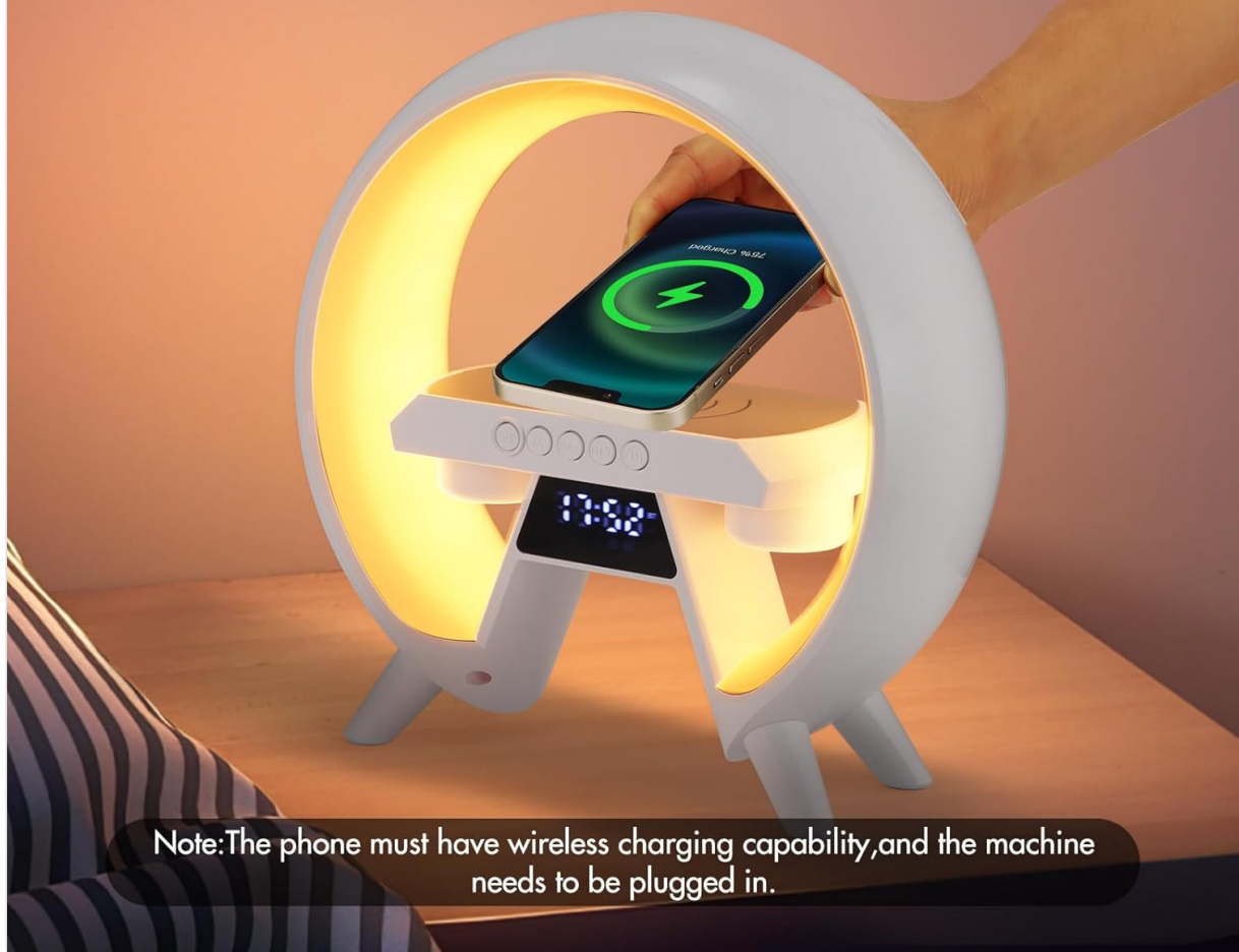
Figure 4.3: Wireless charging in progress.

Built-in 15W phone wireless charging make charging easier