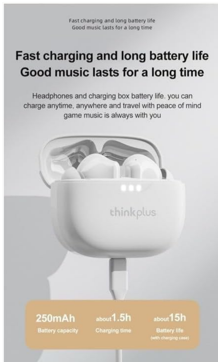
Figure 3.1: Lenovo Thinkplus LP3 Pro white earbuds in their charging case, illustrating the charging process and battery information.