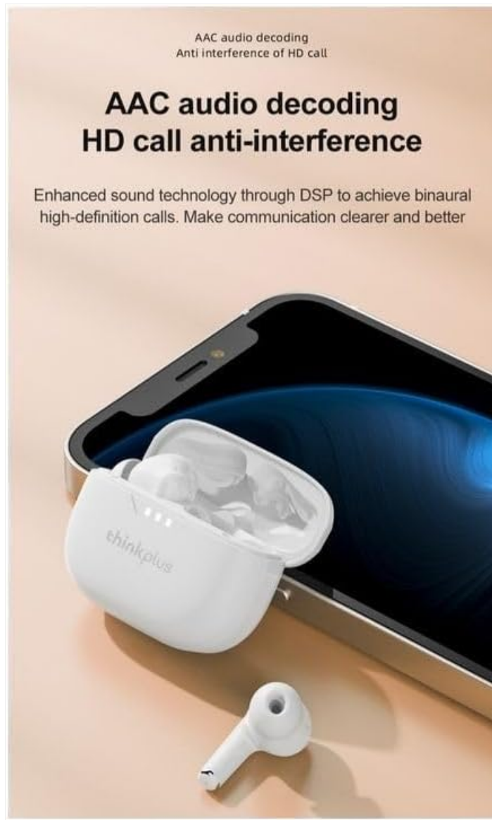
Figure 4.1: Lenovo Thinkplus LP3 Pro white earbuds demonstrating enhanced call quality through AAC audio decoding and anti-interference technology.