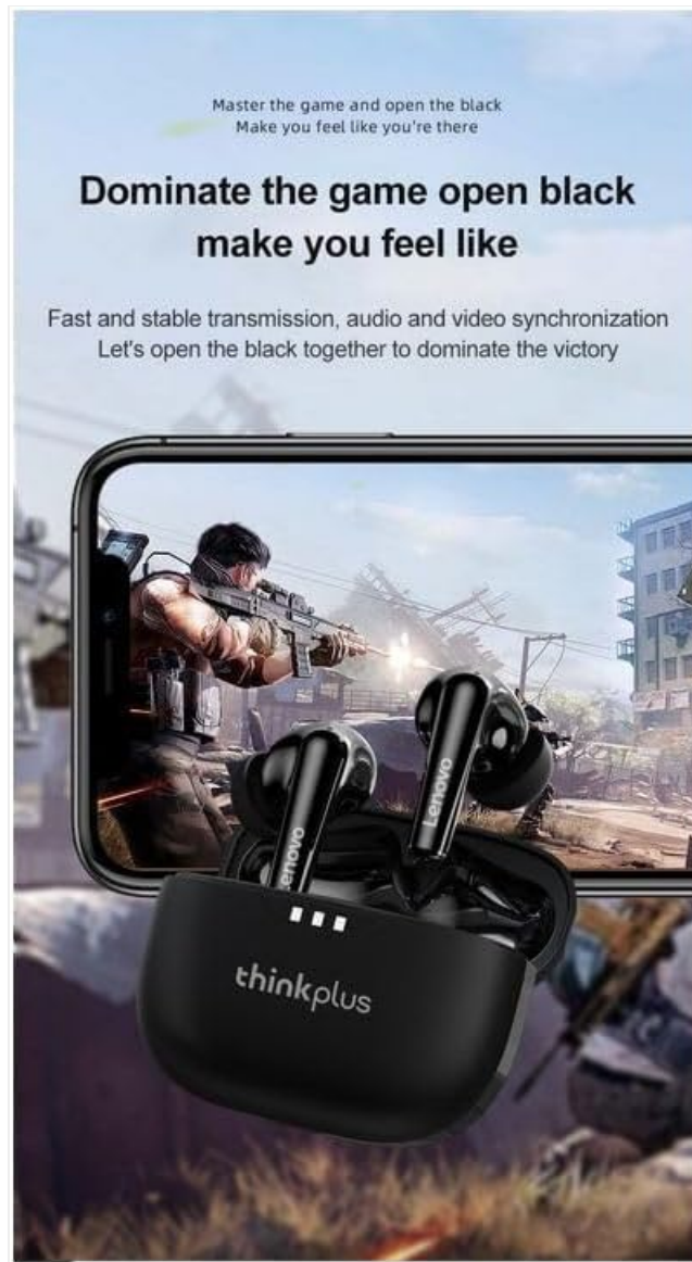
Figure 4.2: Lenovo Thinkplus LP3 Pro black earbuds shown with a gaming phone, emphasizing their low-latency performance for an immersive gaming experience.