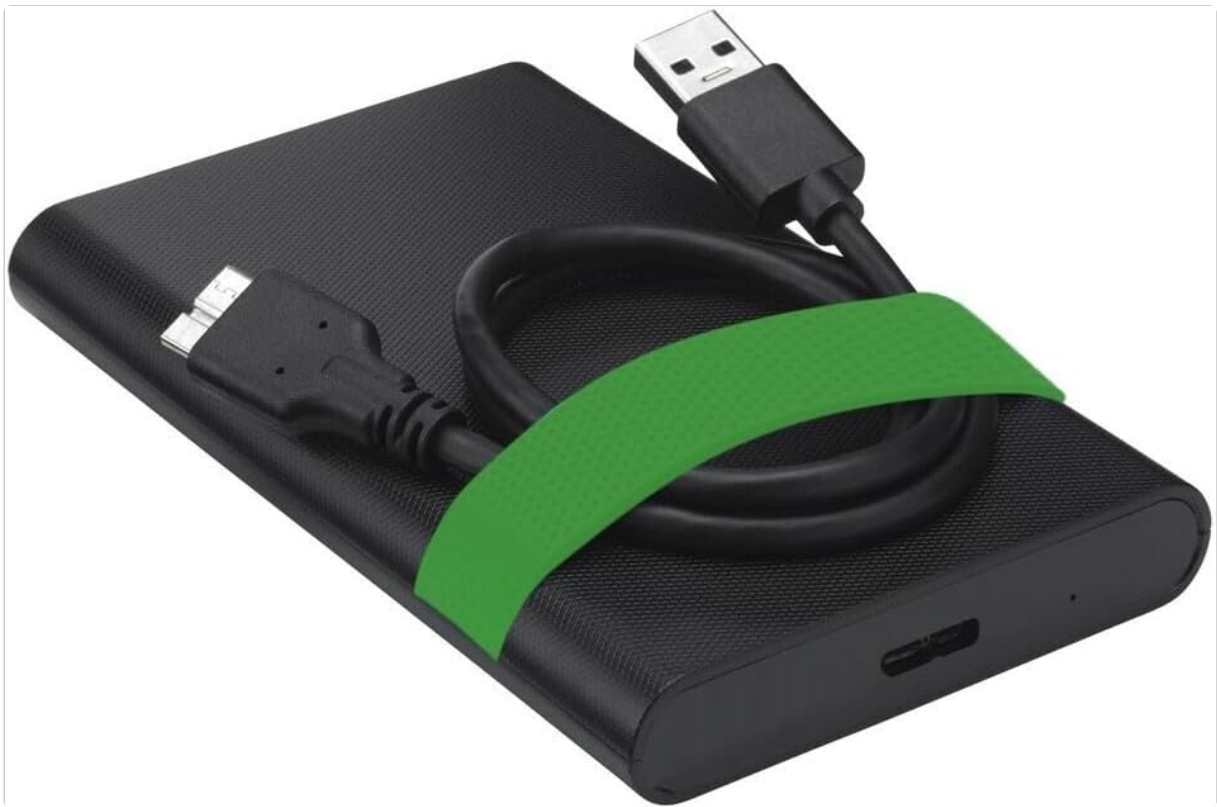
Image 6.1: The Verbatim Portable Hard Drive with its USB cable connected, illustrating the connection point on the drive.