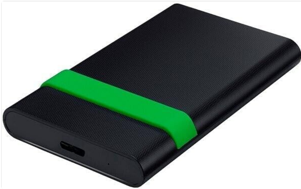
Image 4.1: Top view of the Verbatim Portable Hard Drive. The drive is black with a textured surface and features a distinctive green band across its width.