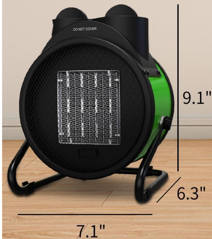
Image: A composite image showcasing the heater's practical features, including its 8ft power cord, non-slip base, portable handle, and overall dimensions.