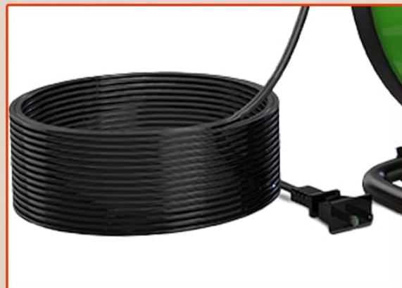
8ft Power Cord