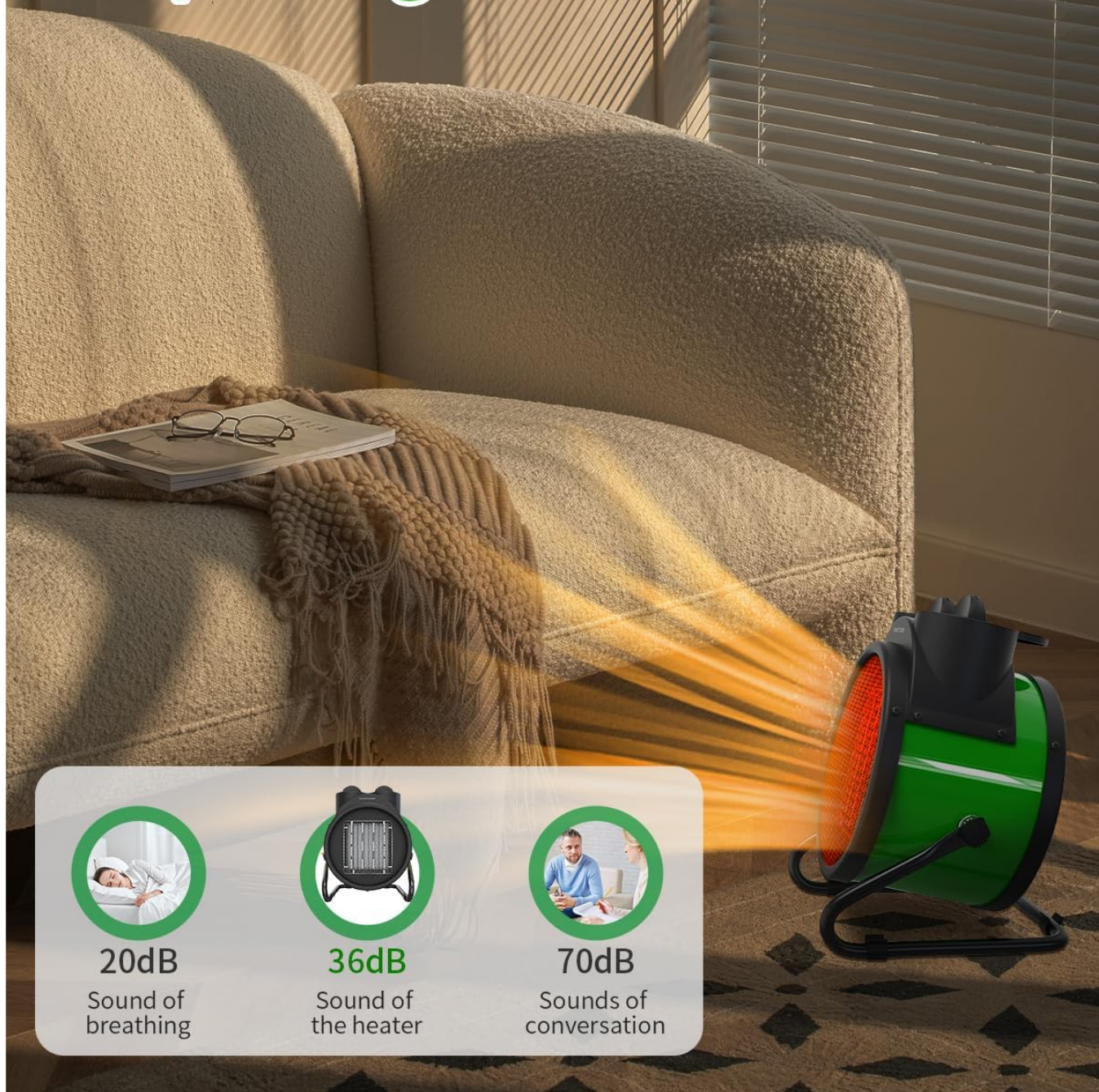
Image: A scene illustrating the heater's quiet operation, with a graphic comparing its sound level (36dB) to common sounds like breathing (20dB) and conversation (70dB).