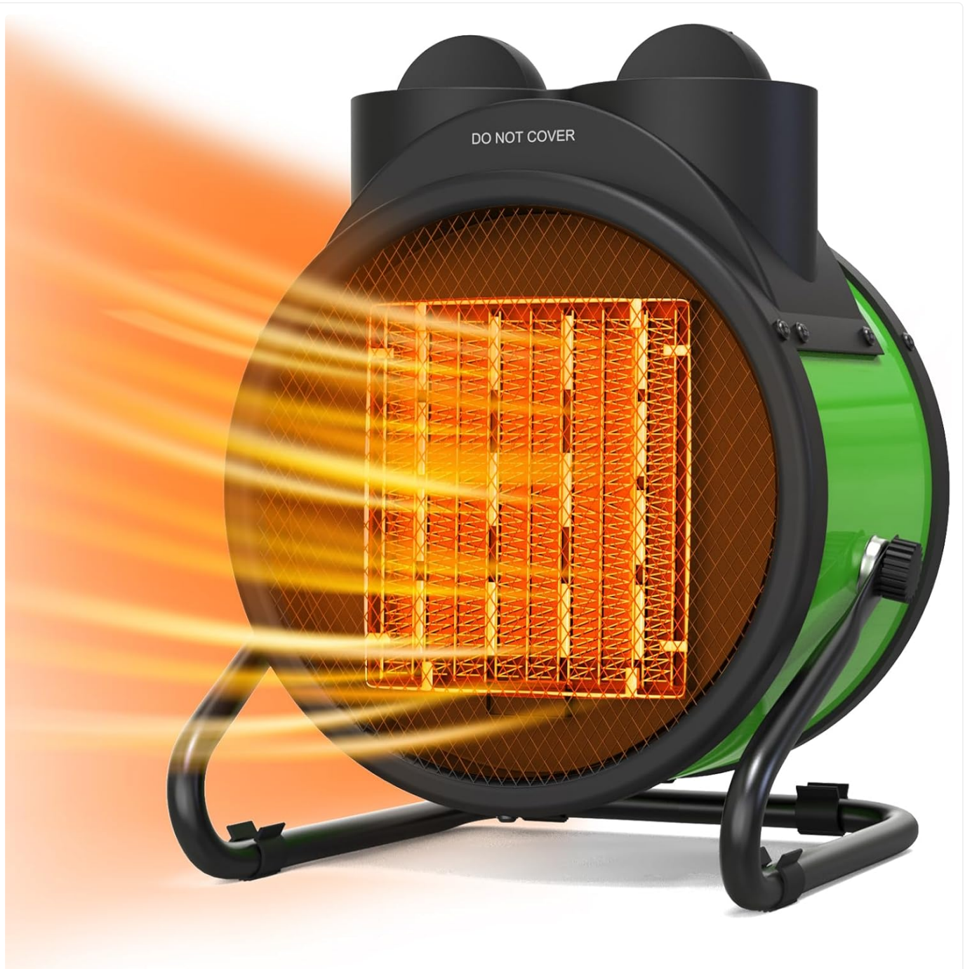
Image: The tectake 1500W Portable Electric Space Heater in operation, showing heat emanating from the front grill.