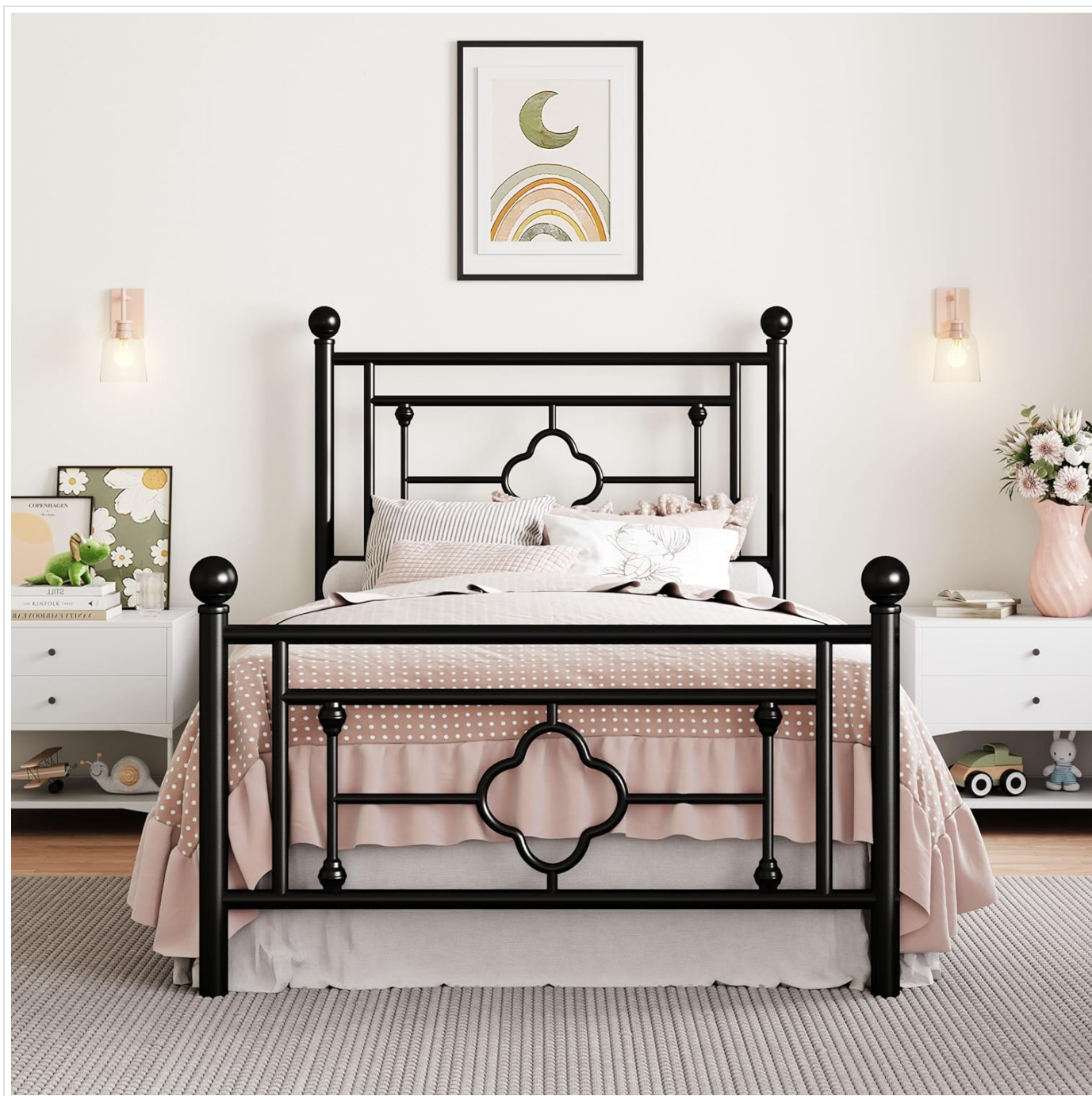
Figure 1: Fully assembled SHA CERLIN Twin Size Metal Platform Bed Frame in black, showcasing its vintage iron-art headboard and footboard design.