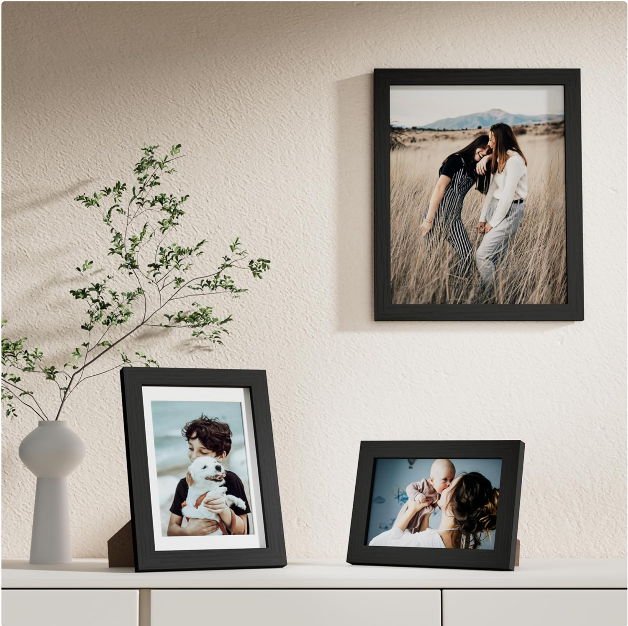
Image: Frames displayed on a tabletop and mounted on a wall, demonstrating versatile placement.