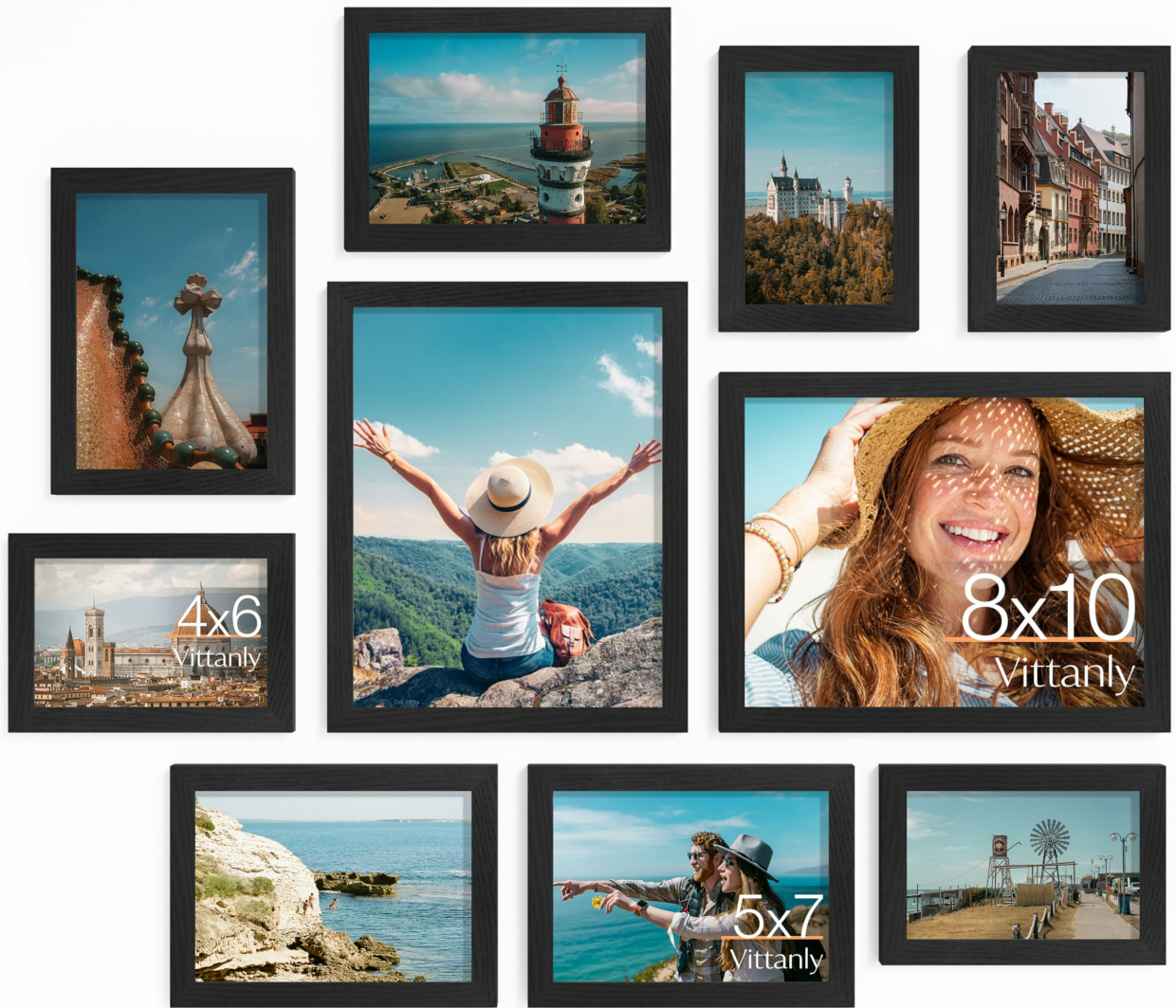
Image: A complete set of Vittanly 10 Pack Picture Frames in black, displayed as a gallery wall arrangement.