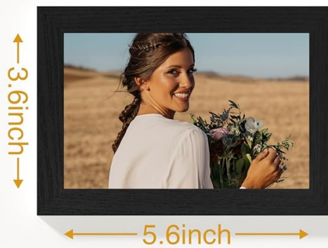
Image: Visual representation of the multi-size frames and their dimensions.