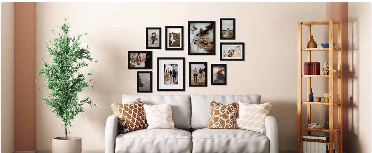
Image: Detailed breakdown of the frame's structure and materials.