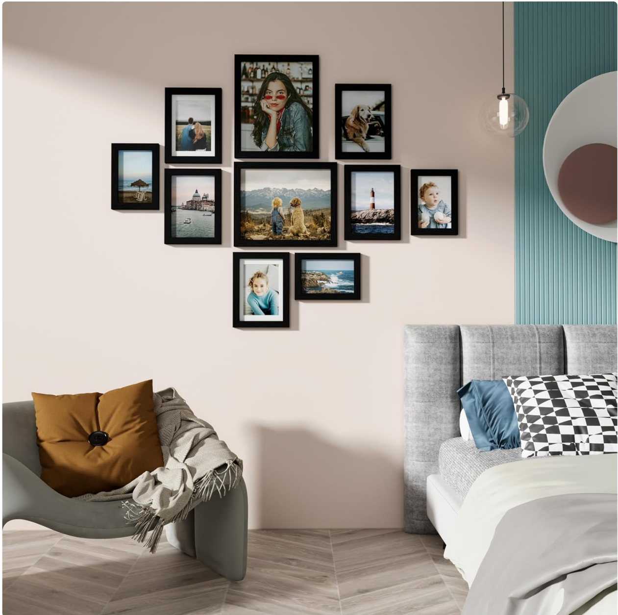
Image: An example of a gallery wall arrangement using the Vittanly 10 Pack Picture Frames in a living room setting.

Video: An overview of the Vittanly 10 Pack Picture Frames Collage Wall Decor, highlighting its features and aesthetic appeal.